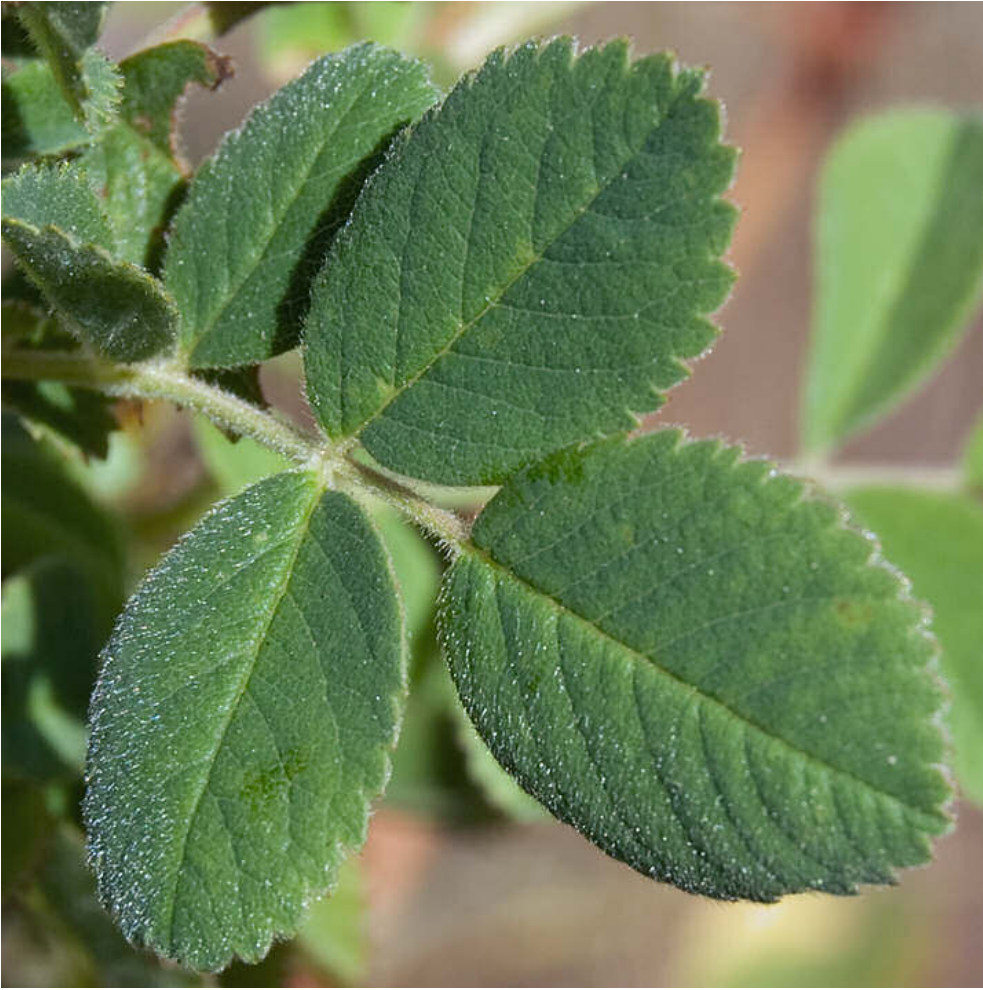
A form of R. californica with downy leaflet margins and surfaces. Marin County, California.