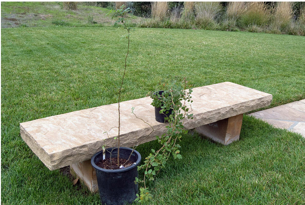
Different roses sold as R. pinetorum by different botanical gardens.