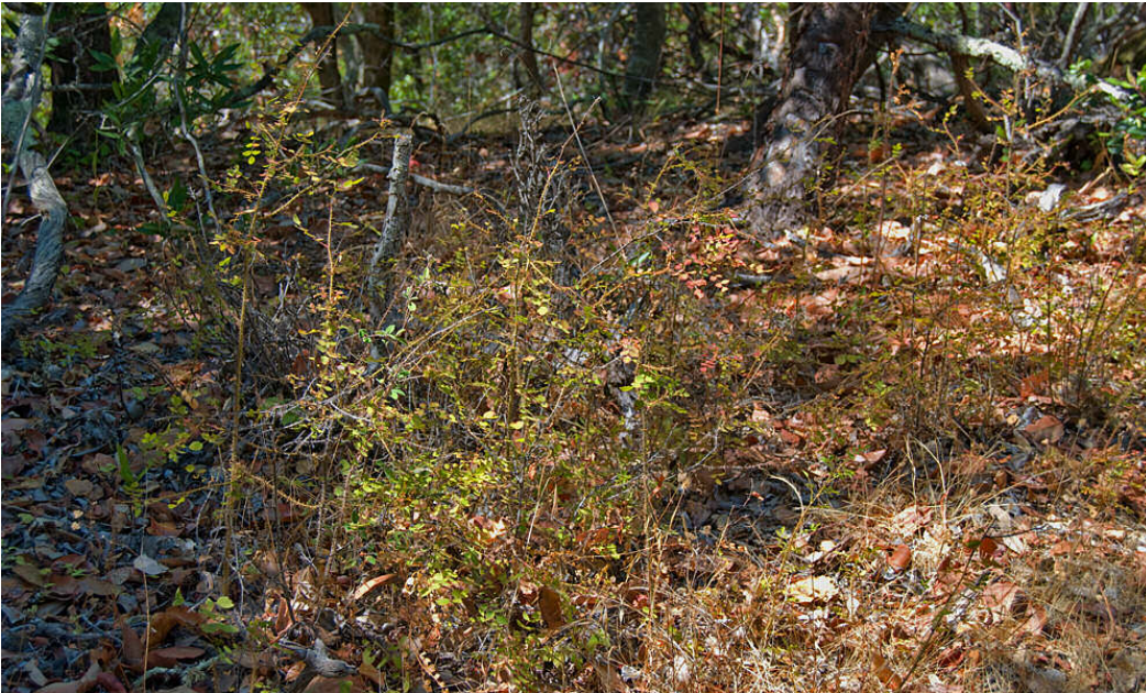
R. gymnocarpa in the Coastal Ranges, San Pedro Ridge, San Rafael, California.