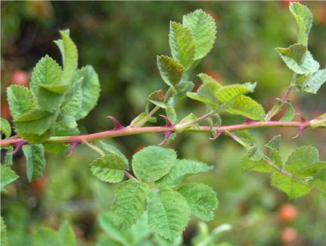
R. californica 's falcate prickles, Thin straight prickles can appear above and below these hooked prickles. Sonoma County, California.