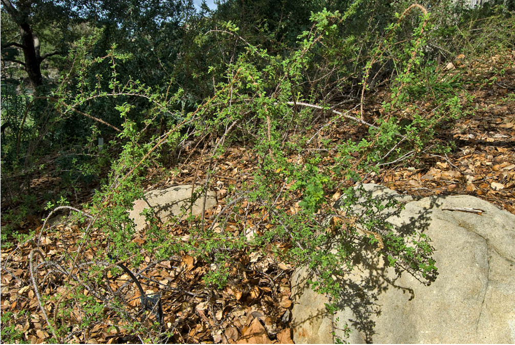
R. minutifolia in January, Santa Barbara Botanic Garden.