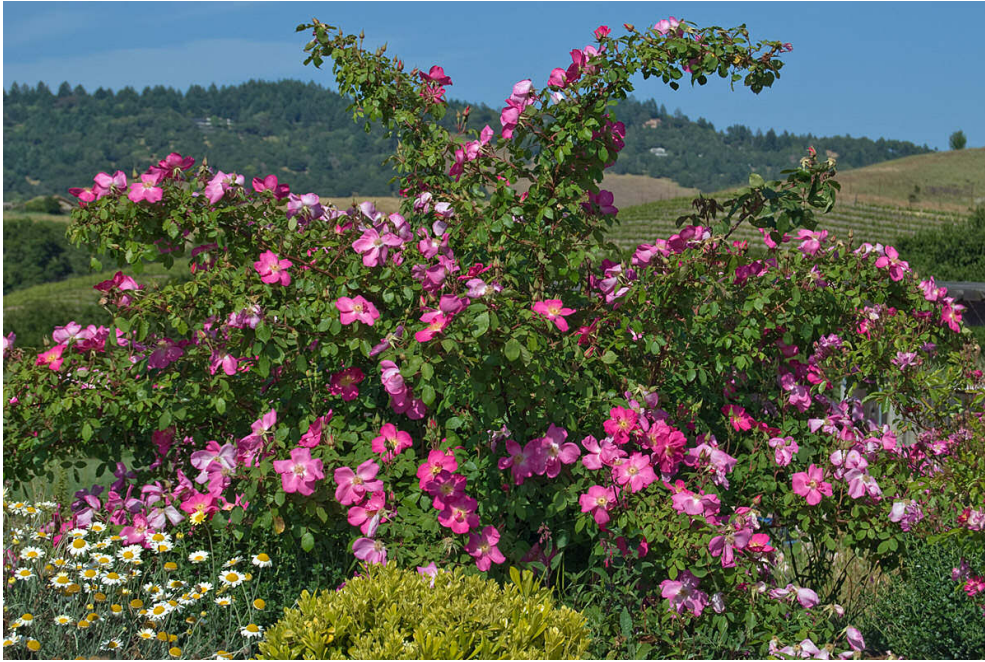
'Schoener's Nutkana' before it grew to 8 feet x 10 feet in my Sonoma County garden.