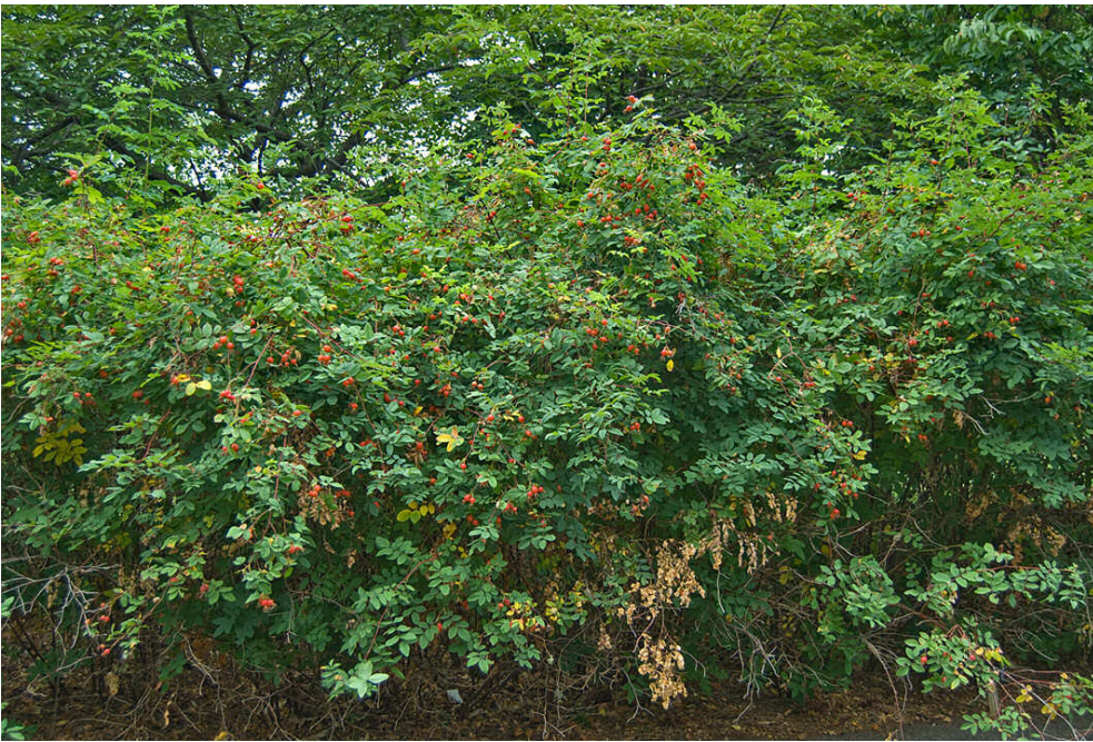
R. nutkana , Arnold Arboretum, Boston, Massachusetts.