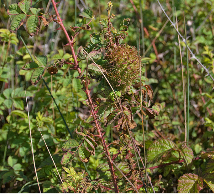
Rose gall. Regular cane on left. Galled cane on right is hyper-thorny.