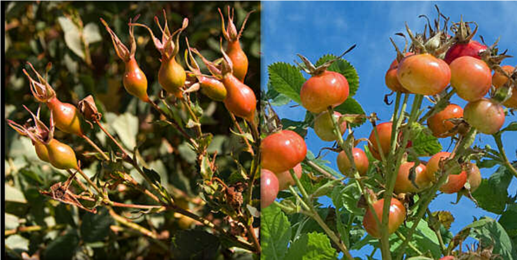
R. californica hips from different thickets two miles apart. Sonoma County, California.