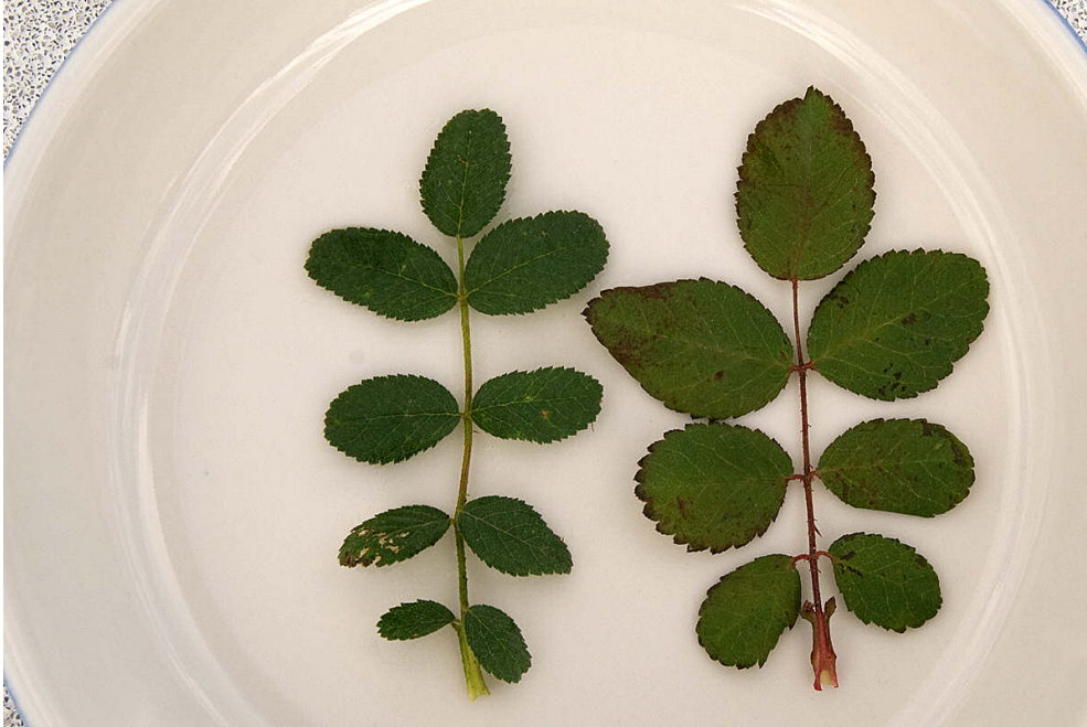
Leaves from purported R. pinetorum .