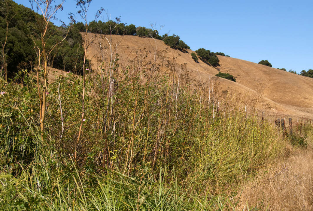
Fenceline thicket of R. californica in the Coast Ranges, Sonoma County, California.