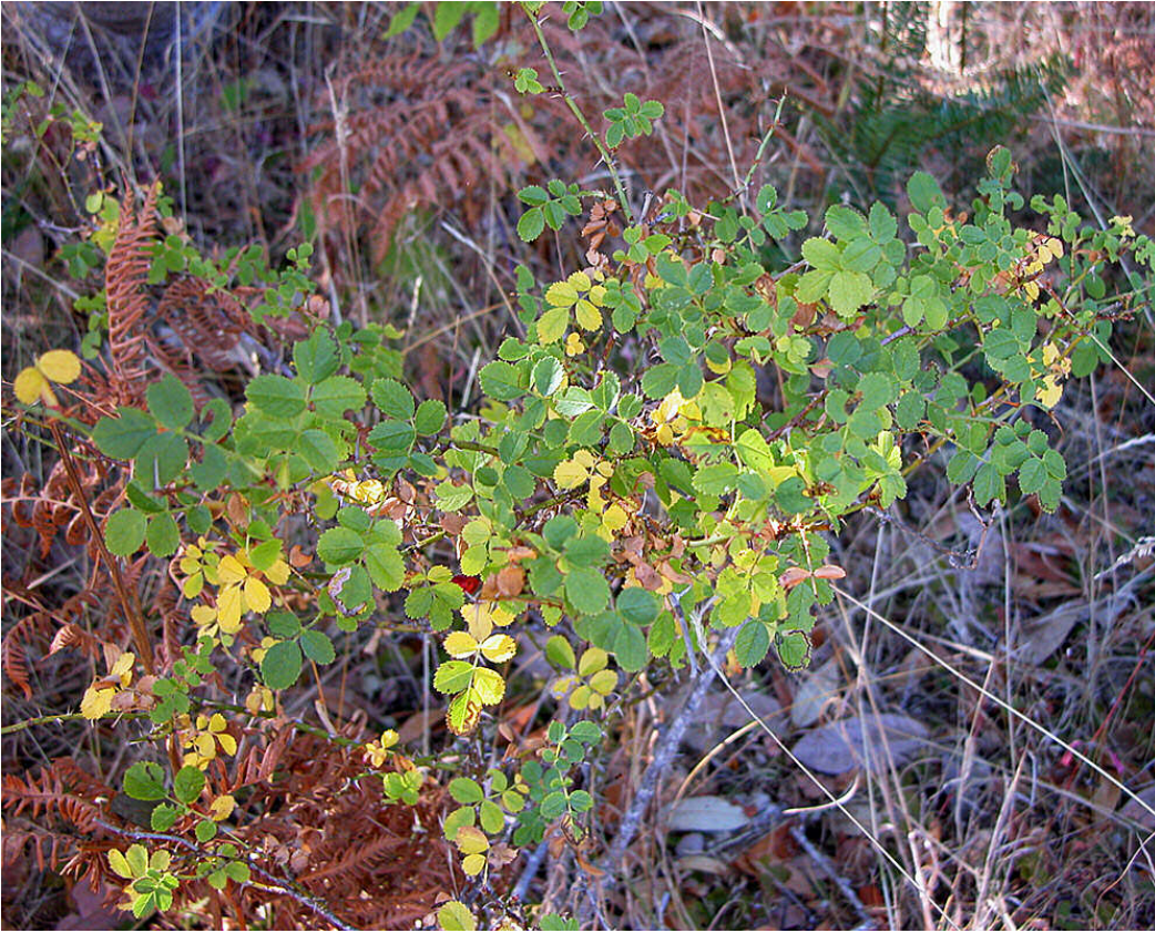
Maybe R. spithamea late in the summer, Coastal Ranges, Humboldt County.