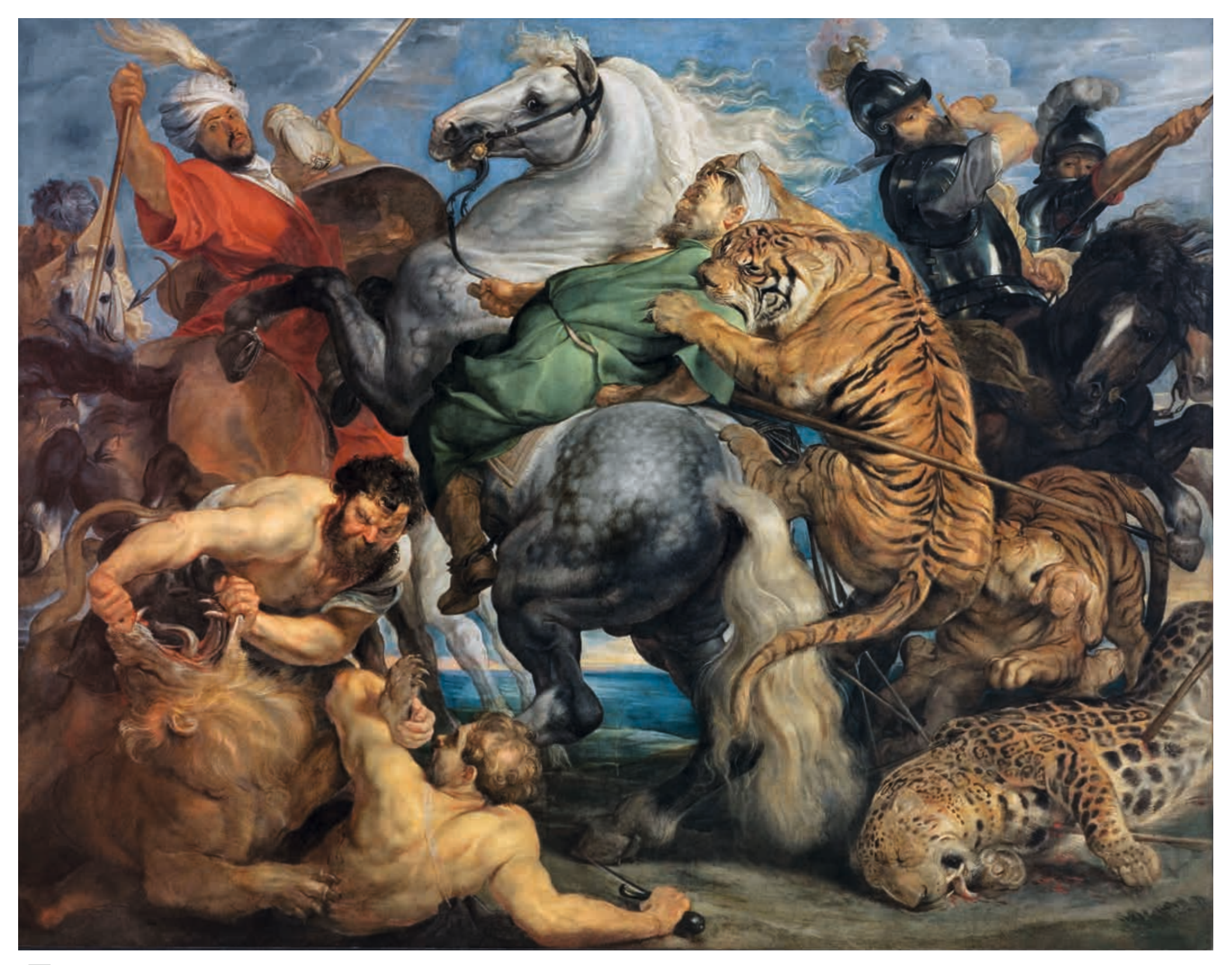
Cat. 1 Peter Paul Rubens Tiger, Lion and Leopard Hunt, 1616 Oil on canvas, 256 × 324.5 cm

Musée des Beaux-Arts de Rennes