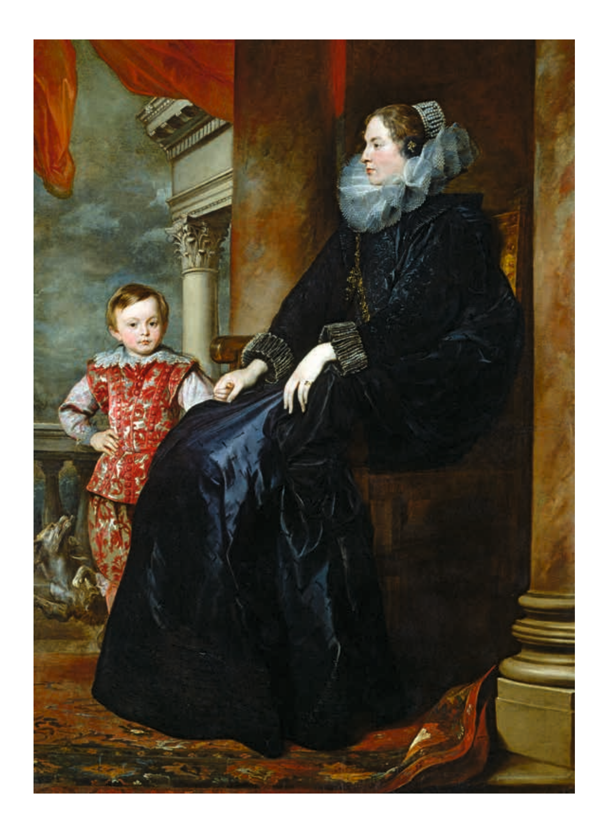
Cat. 105 Sir Anthony Van Dyck A Genoese Noblewoman and Her Son, c. 1626 Oil on canvas, 191.5 × 139.5 cm

National Gallery of Art, Washington, Widener Collection, 1942.9.91