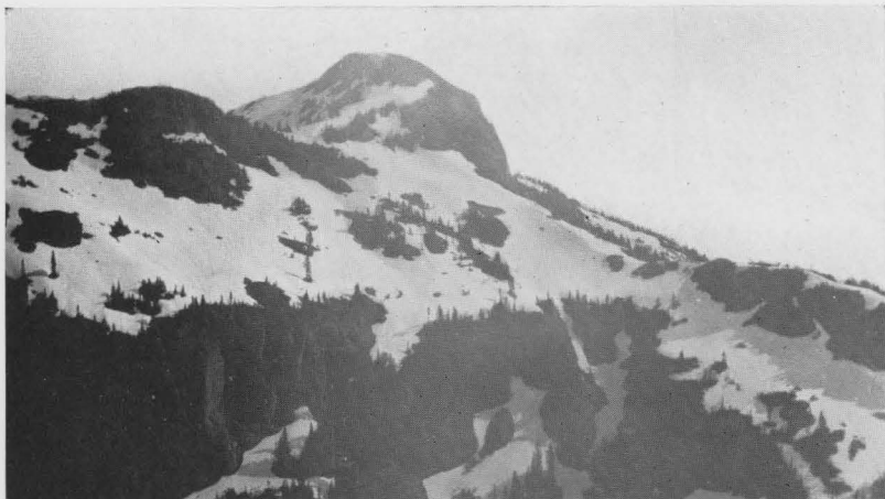
Mountain at head of Cottonwood Creek, Cowichan Lake, Vancouver Island.