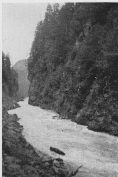
Kitsault River. Alice Arm, Northern B.C.