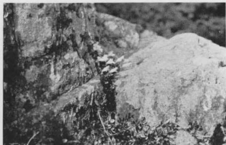
Pentstemon Menziesii . Vancouver Island.