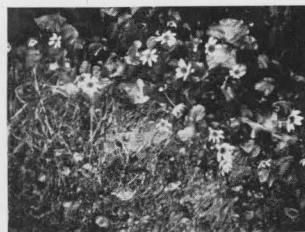
Caltha leptosepala . Alice Arm, Northern B.C.