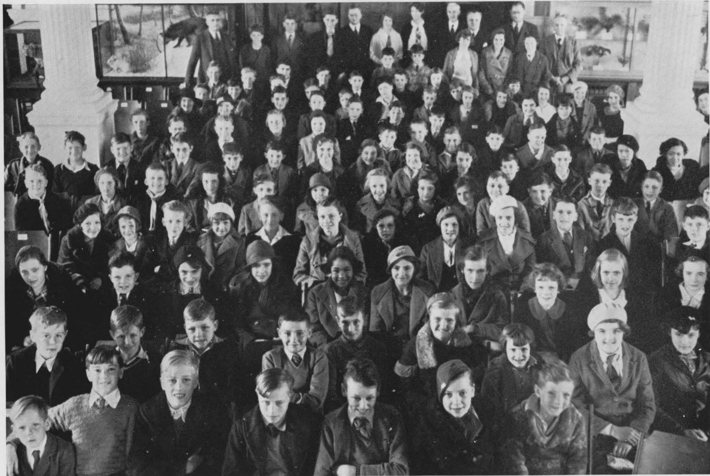
SCHOOL-CHILDREN ATTENDING LECTURES IN PROVINCIAL MUSEUM, VICTORIA, BRITISH COLUMBIA.