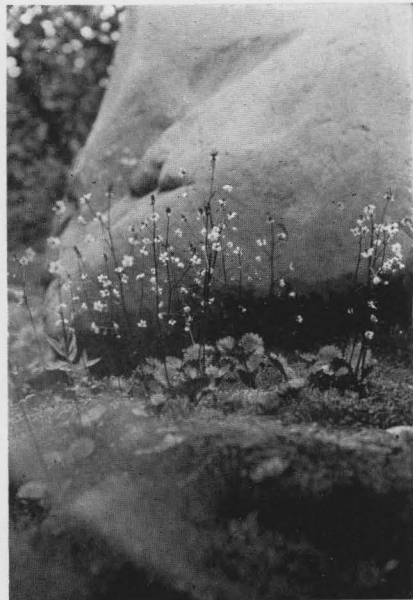
Mountain Saxifrage. Alice Arm, Northern B.C.