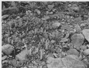
Salix arctic . Alice Arm, Northern B.C.