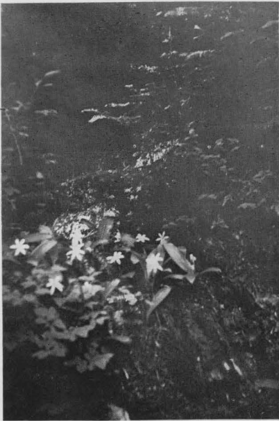
Clintonia uniflora. Alice Arm, Northern B.C.