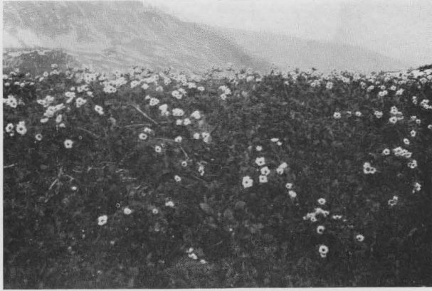
Anemone narcissiflora. Alice Arm, Northern B.C.