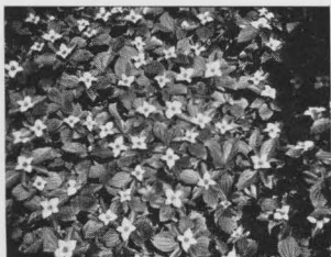
Cornus Canadensis . Alice Arm, Northern B.C.