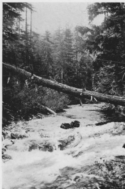
Northern Country, Bridge across Cariboo Creek. Alice Arm, Northern B.C.