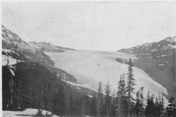
First glimpse of Kitsault Glacier. Alice Arm, Northern B.C.