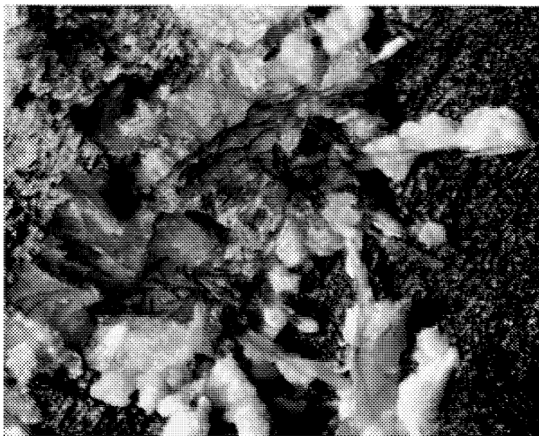
FIG. 1. Clusters of yellow flakes and coarser red-orange plates of martyite on V-U replacement of organic material. Field of view is 1.4 mm across.