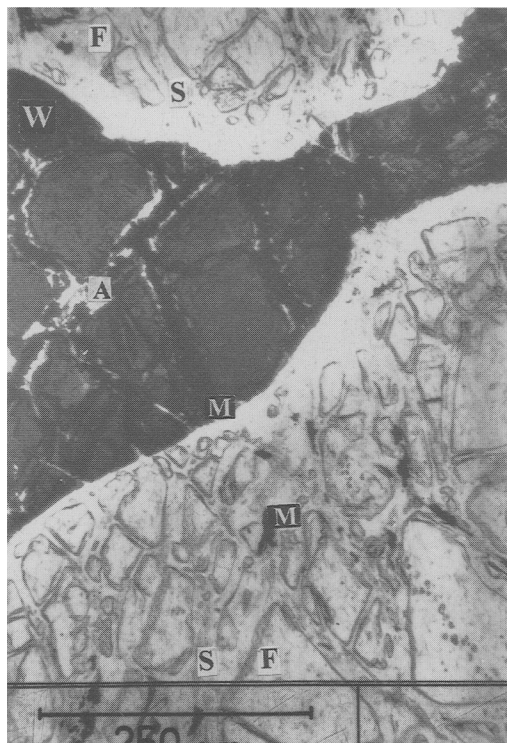
FIG. 1. Photomicrograph showing warwickite (W) and its alteration products: boron-rich minerals (A) and magnetite (M). Forsterite (F) is partly altered to serpentine (S) and magnetite (M). Sample GGU 425360.

Warwickite which constitutes about 5% of the two samples investigated occurs in large black anhedral grains, up to 5 mm, which are somewhat altered. Warwickite also occurs in slender unaltered crystals a few millimetres long, locally enclosed in grains of forsterite. In thin section warwickite is mostly opaque but along grain boundaries and in extreme thin section it is translucent. The colour varies slightly: in one sample it is dark brown with pleochroism from brown to very dark brown in another sample it shows pleochroism from brown to deep brownish red. In reflected light warwickite is grey with a slight bluish brown tinge and a reflectivity higher than spinel (7 R%) and lower than magnetite (21 R%). No internal reflections were observed in reflected light. Alteration of warwickite resulted in a network of alteration minerals (Fig. 1) resembling the network of serpentine and magnetite after forsterite. The alteration minerals from warwickite are fine-grained and consist of magnetite and a colourless mineral with low birefringence which in reflected light is dark grey with very low reflectivity. The grain-size does not allow determination by transmitted light microscopy. Back