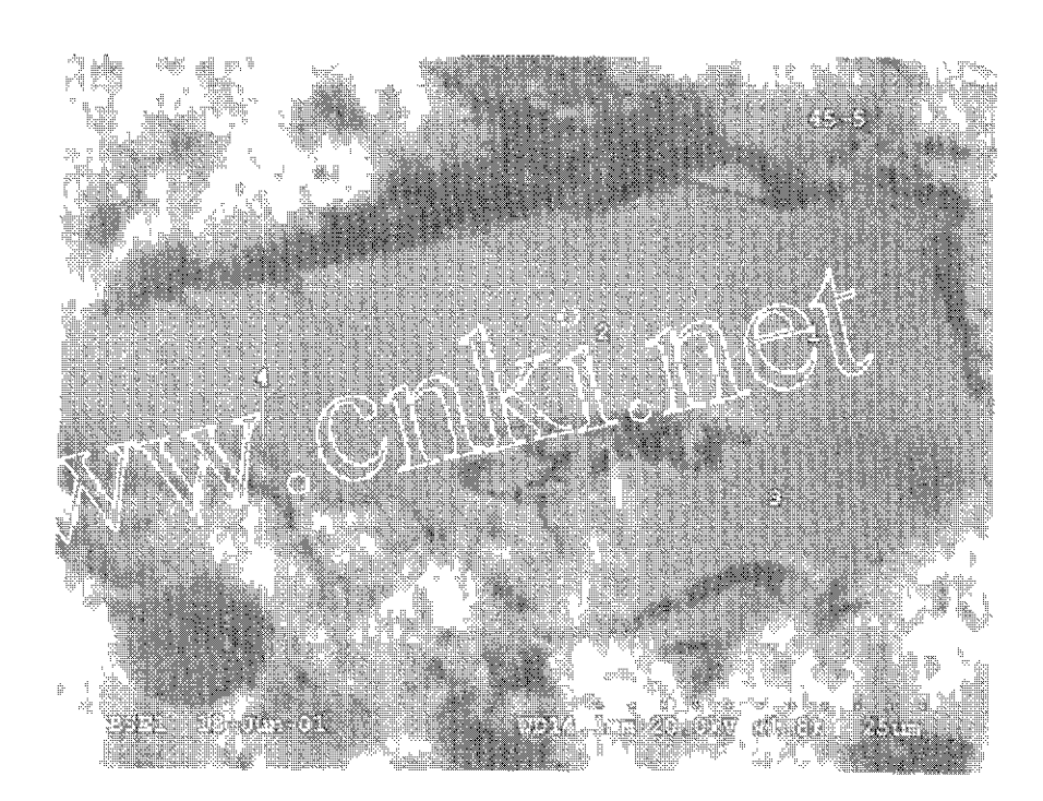
Fig. 1. SEM image of yarlongite. It is shown as the greyish area in the center of the figure. The chemical composition of measurement points 1 and 3 are listed in Table 3.

The chromitite has mined been at the Luobusha mine for over a decade, and a number of pods are exposed in open pits. About 1500 kg of ore was removed from the orebody C31 of the Luobusha mine. The samples were handwashed, air-dried and