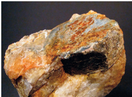
FIG. 1. Rough crystal of arrojadite-(BaNa) from the Luna pegmatite. The crystal is 4 cm in diameter.

During the last five years, one of the authors (FV) has found, in the mine dumps of the Luna dike mining locality, several masses or roughly crystallized individuals of a mineral corresponding to a member of the arrojadite group. These masses, up to 5 cm in diameter, are hosted by albite and associated fluorapatite. The crystallochemical investigations indicated that the mineral was a new phosphate, which was named arrojadite-(BaNa). It corresponds to the Ba-Na-rich member of the arrojadite mineral group, in which