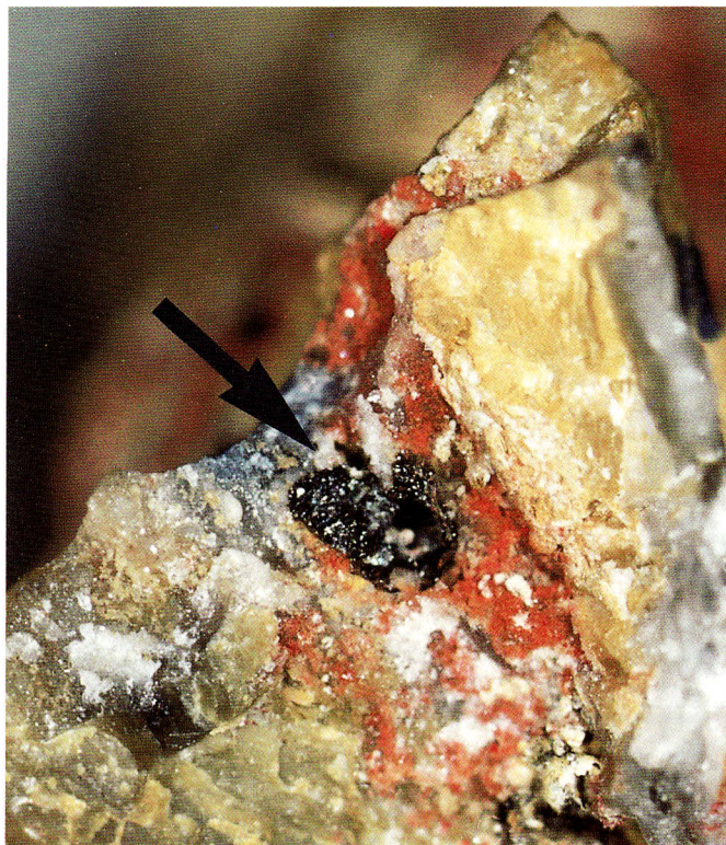
Figure 1. Wattersite crystal (at arrow) in host rock. Crystal is 2 mm in longest dimension. Blue marking adjacent to the crystal is due to a felt pen.

Precession single-crystal studies, employing Zr-filtered Mo radiation, showed that wattersite is monoclinic, with measured and calculated unit-cell parameters: a = 11.24 , b = 11.65 , c = 6.581 Å,