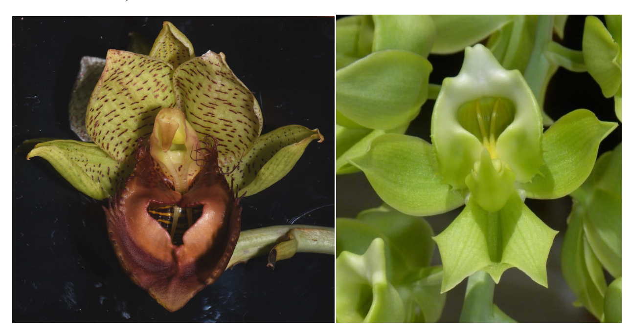
Catasetum cucutaense Uribe-Velez & Sauleda.