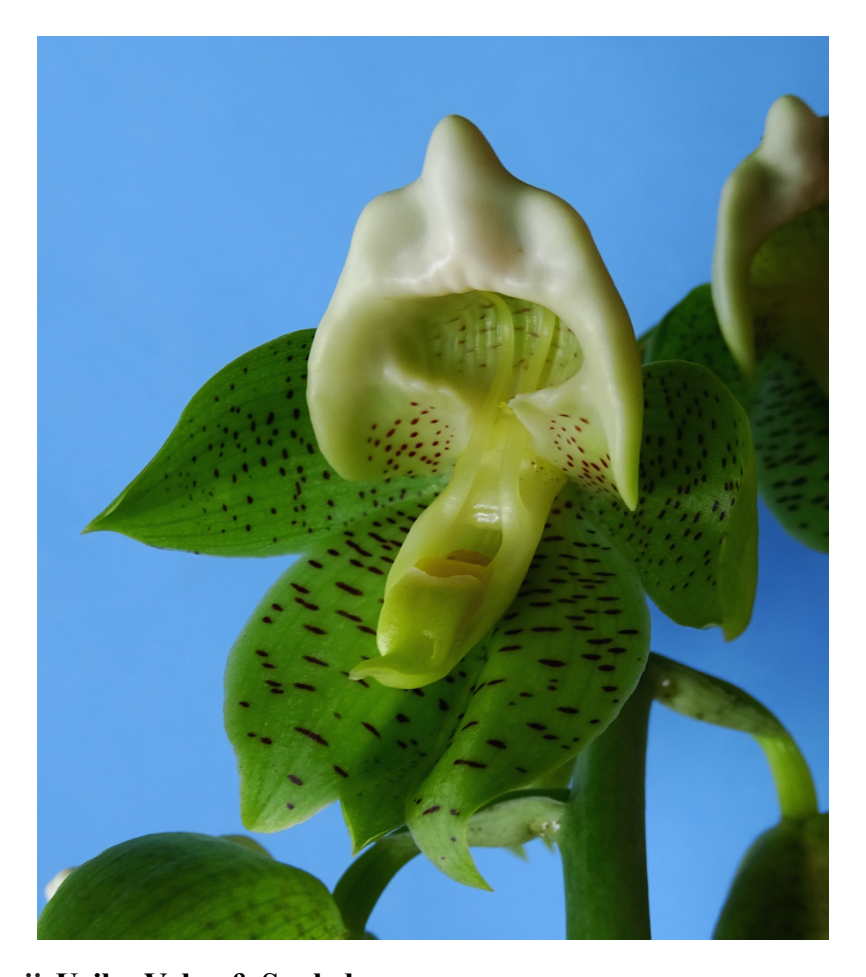
Catasetum bolivarii, Uribe-Velez & Sauleda.