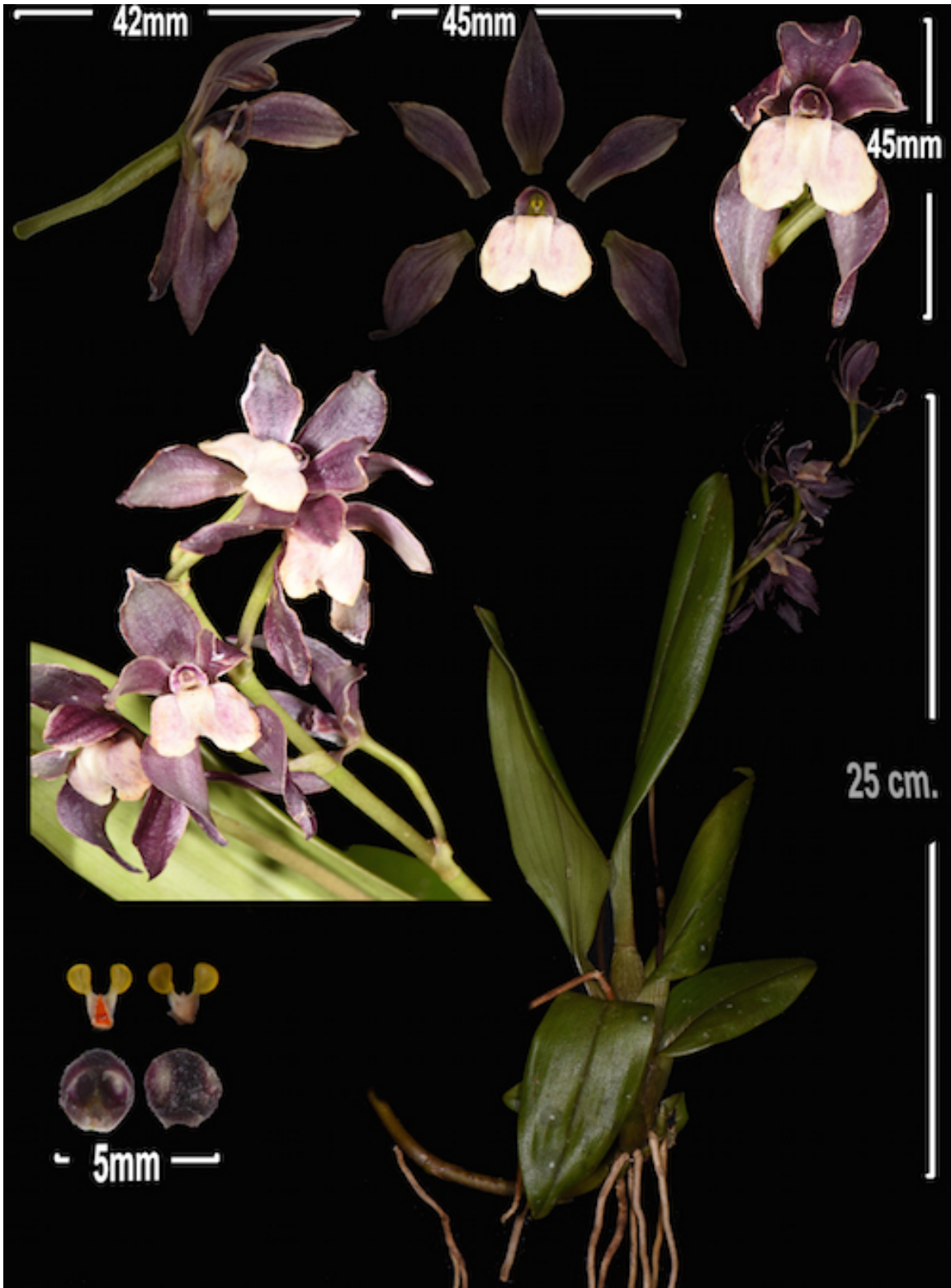
Oliveriana uribe-vezlezii Saulea.