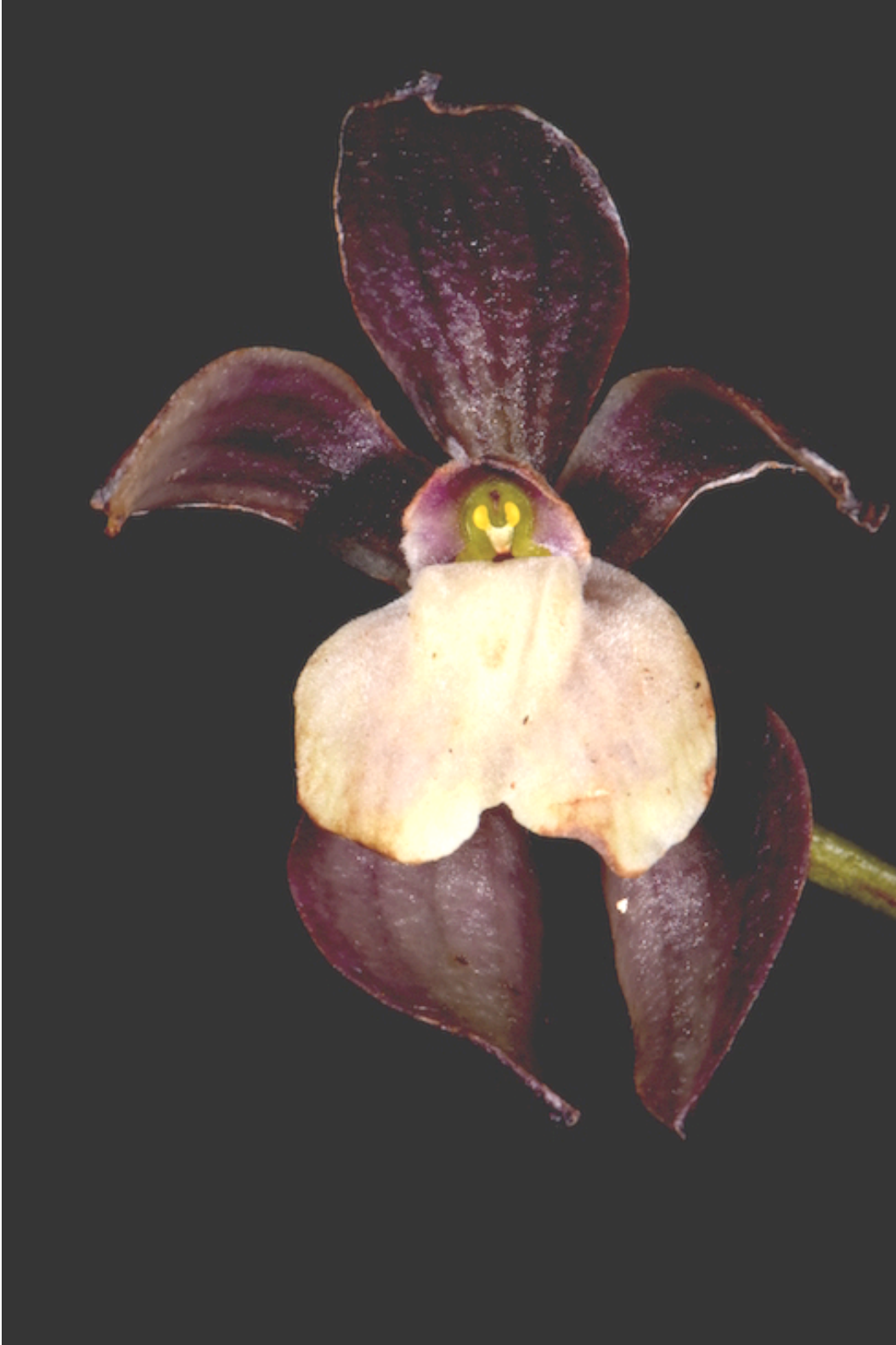
Oliveriana uribe-vezii Saulea.