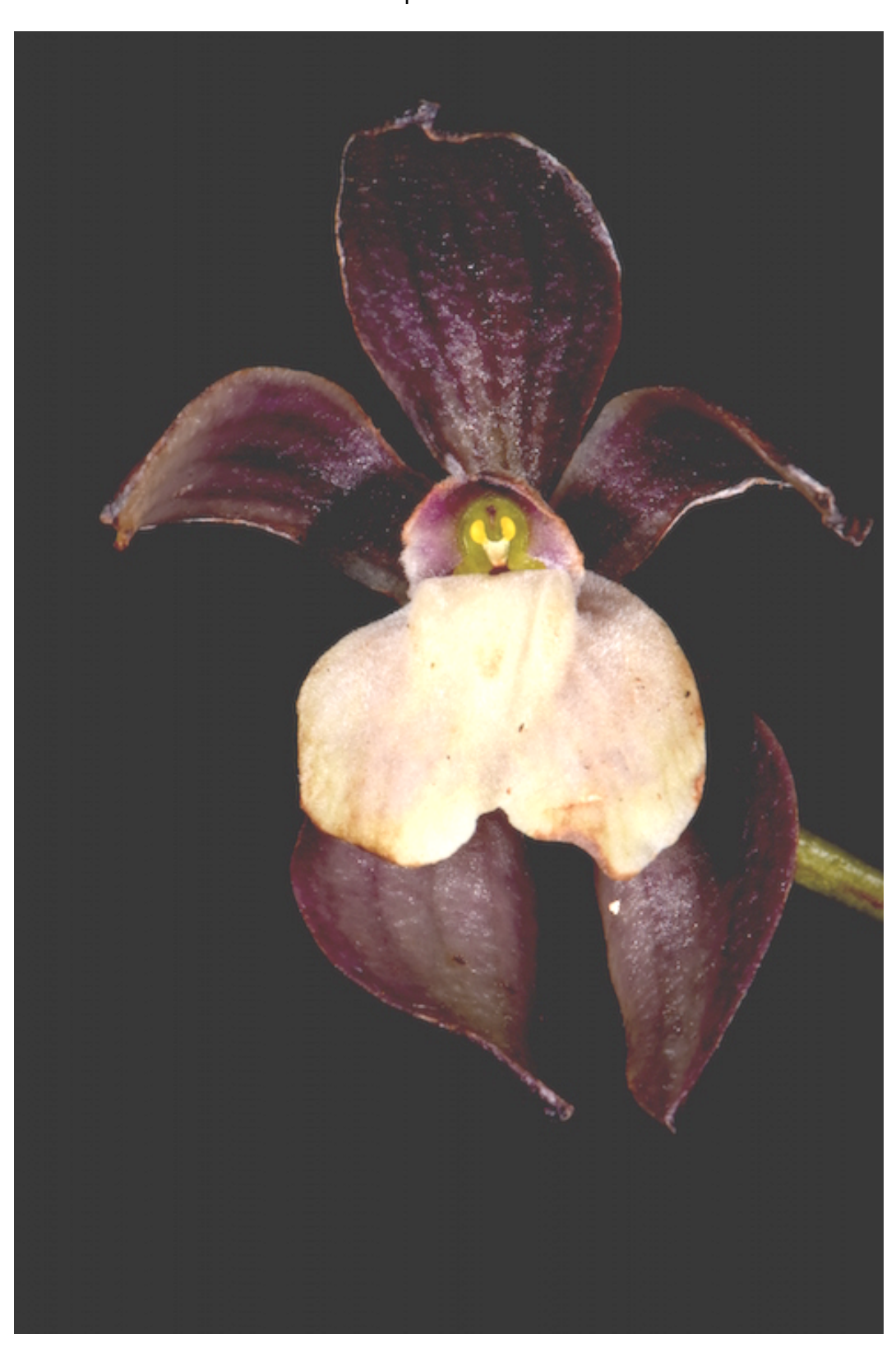
Oliveriana uribe-velezii Sauleda.