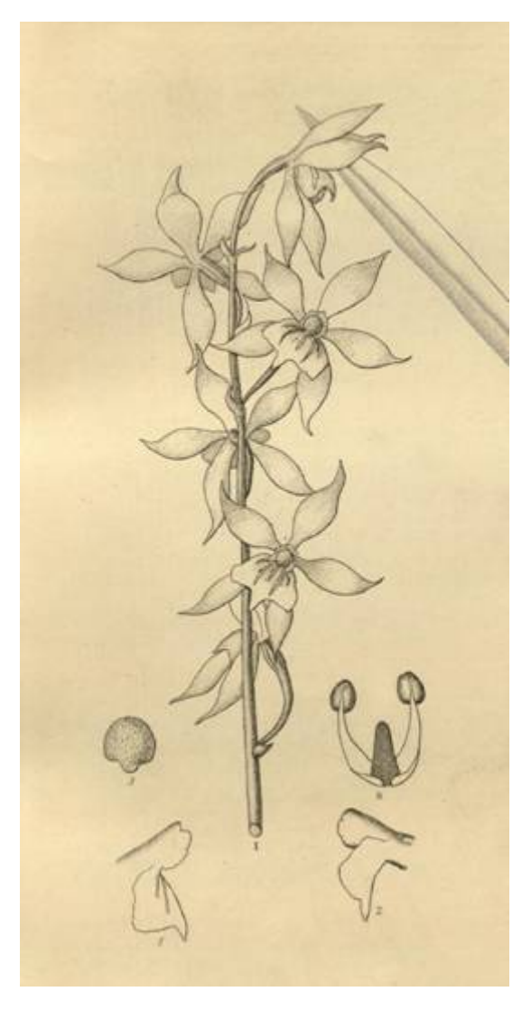
Oliveriana egregia Rchb. f. Type species for the genus Oliveriana Rchb. f. from Xenia Orchidacea – Beirage sur Kenntniss der Orchideen. Leipzig, F. A. Brockhaus.