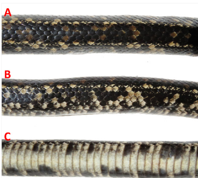
Figure 3. Partial melanism specimen body views. A: Dorsal, B: Lateral, C: Ventral.