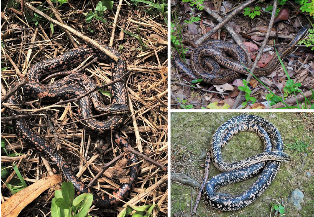
Figure 2. Different presentation of partial melanism morph in some P. chamissonis specimens from O'Higgins Region.

A total of 77 records of P. chamissonis were obtained in the O'Higgins Region (Table 2). Of those, 33 individuals (42.8%) presented the phenotypic pattern of partial melanism, in different degrees of pigment coverage, from small diffuse black spots along the body to dark individuals with black pigmentation over a large area of their body, generally over a soft pink or grey basal colour (Figures 2-3). No completely melanic specimens were observed.