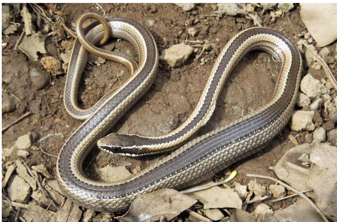
Figure 1. Typical morph of P. chamissonis . Rio Cachapoal, Machalí, O'Higgins Region.

This article describes the percentage of occurrence of the phenotypic variant called partial melanism in P. chamissonis recorded in the O'Higgins Region, and compares it to the complete distribution of the species, postulating that this morph has a greater expression in this territory than in the rest of its range.