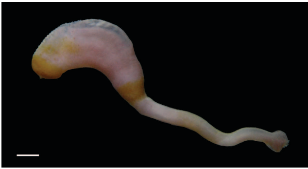
Fig. 1: Specimen of Phascolion caupo from San Pedro del Pinatar (Western Mediterranean). Scale bar = 1 mm.

face area of 0.04 m 2 . To separate the macrofauna from sediment, the samples were sieved through a 0.5 mm mesh screen. Afterwards, the macrofauna was fixed in 10% buffered formalin and preserved in 70% ethanol. Depth and sediment type were recorded at each station (Buchanan, 1984). Sipunculans were dissected to study their internal anatomy using a binocular microscope and fine scissors with a 3 mm blade (Moria MC19). Small structures with high taxonomic value, such as papillae and hooks, were observed under the microscope. To identify the species, we examined the introvert hooks, a distinctive characteristic between P. caupo and P. strombus (Cutler, 1994). Phascolion strombus presented claw-like hooks (type I hooks) (Fig. 3A), while P. caupo presented scattered broad-based hooks, with the tip rounded (type III hooks) (Fig. 3B).