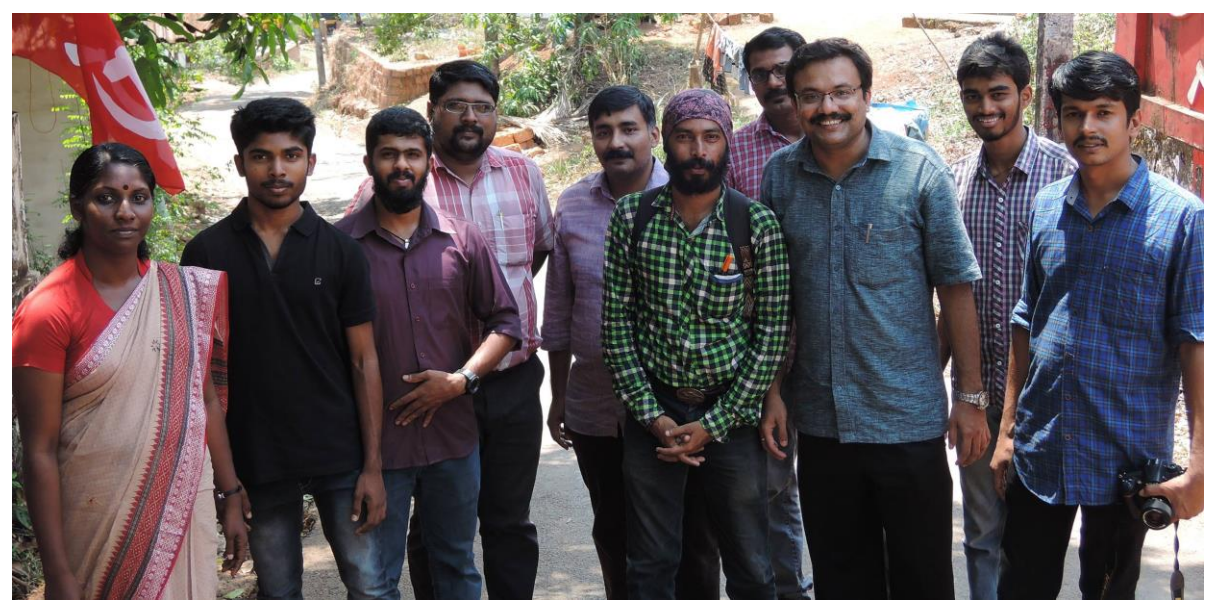
Figure 6 Research team with the members of MARC involved in the protection of the subterranean fishes