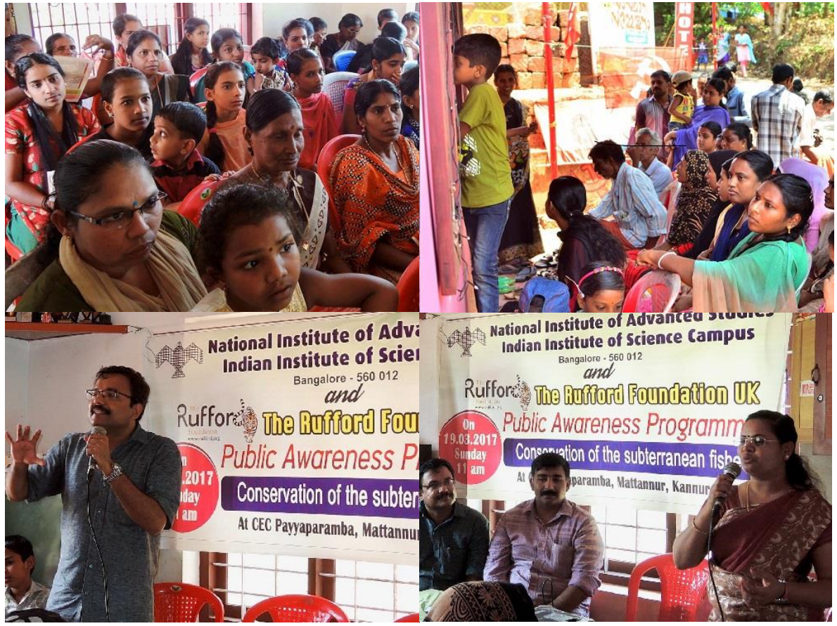
Figure 5 The public awareness programme conducted at Mattannur, Kannur district