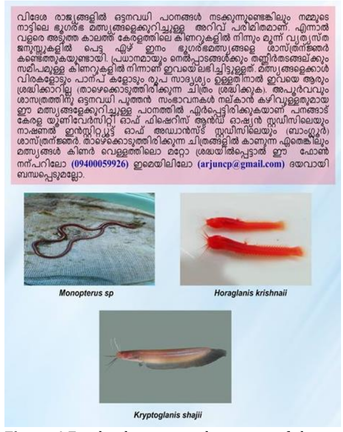
Figure 4 Facebook post on subterranean fishes

A poster on the subterranean fish with photographs and the contact details of the research team was prepared (Fig. 4) and shared in various Facebook pages to create grassroots level awareness about these rare fishes. We got very good response and many people contacted the research team over telephone to know more about this fishes and they assured that they will inform us when they come across these fishes.