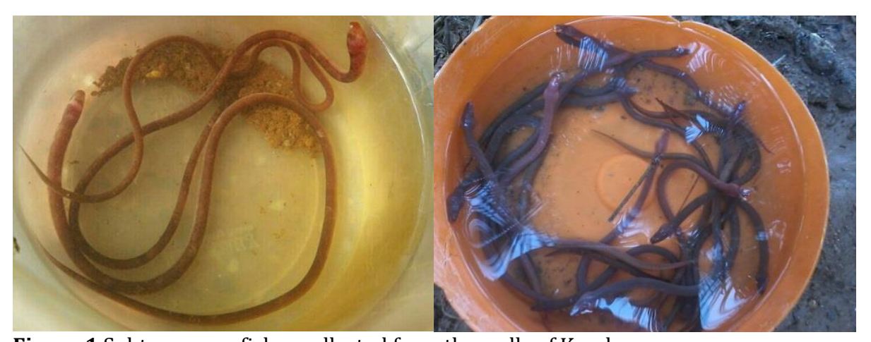
Figure 1 Subterranean fishes collected from the wells of Kerala

Research team visited the locations from which the subterranean fishes had been reported and the water bodies had been studied for the presence of the subterranean fishes and a few Kryptoglanis shajii and Monopterus sp. (Fig.1) were collected for the taxonomic studies. The owners of the wells or the land through which the small water channels passing through were interviewed to know the season at which the focal species appear in the wells/ water channels of that region.