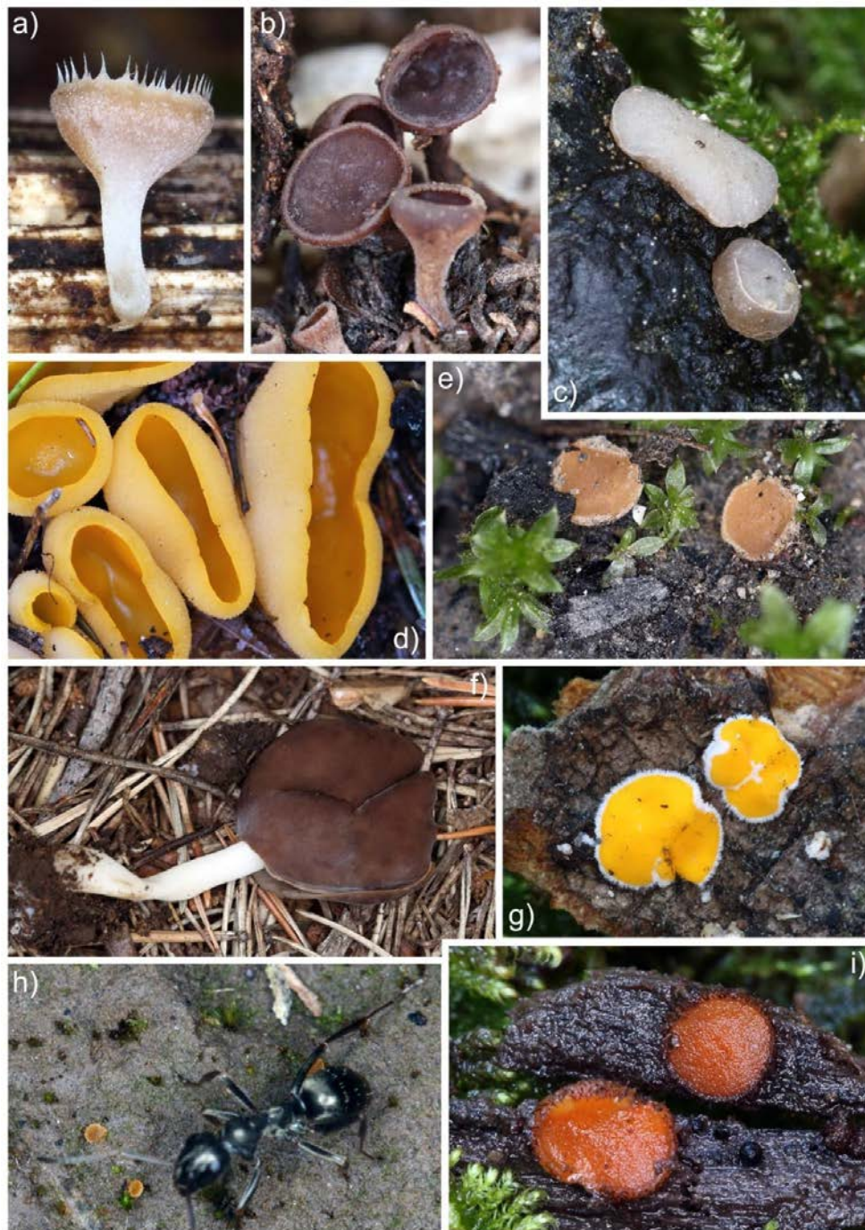
Figure 2. – a) Crocicreas sp., Masna Luka – Nature park Blidinje; b) Rutstroemia echinophila , NP Una, Martin Brod; c) Thecotheus rivicola , river Kruščica – Central Bosnia and Herzegovina; d) Sowerbyella rhenana , Nišići; e) Leucoscypha semi-immersa , Kruščica riverbank; f) Helvella albella , Masna Luka – Nature park Blidinje; g) Lachnellula fuckelii on Pinus mugo branches, Prenj Mt; h) Octospora coccinea and comparison with ant size; i) Scutellinia cejpai , Prenj Mt.