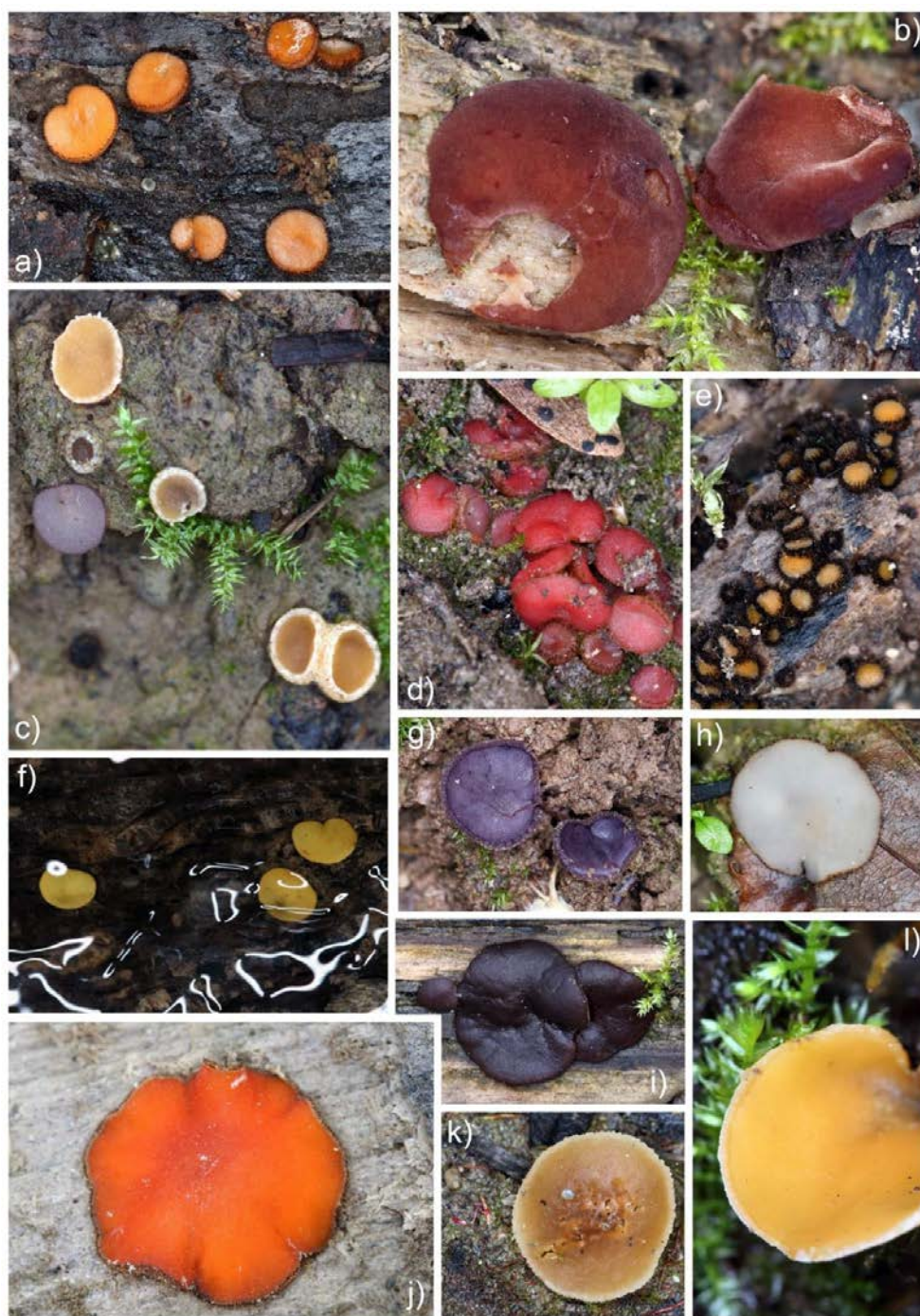
Figure 3. – a) Scutellinia crinita , virgin forest Ravna vala – Igman Mt.; b) Peziza subisabellina , Jelenjača - Visočica Mt.; c) Leucoscypha patavina , Visočica Mt.; d) Parascutellinia violacea , Rakitnica riverbank ; e) Scutellinia setosa , Jelenjača – Visočica Mt.; f) Aquatic ascomycetous fungi – Vibrissea flavovirens ; g) Peziza gerardii , Visočica Mt.; h) Fully developed Geopora cervina ascoma; i) Pachyella sp., Javornik – Igman Mt.; j) Scutellinia olivascens , Jelenjača – Visočica Mt.; k) Peziza varia , Rakitnica sandy riverbank; l) Geopyxis sp., javornik – Igman Mt.