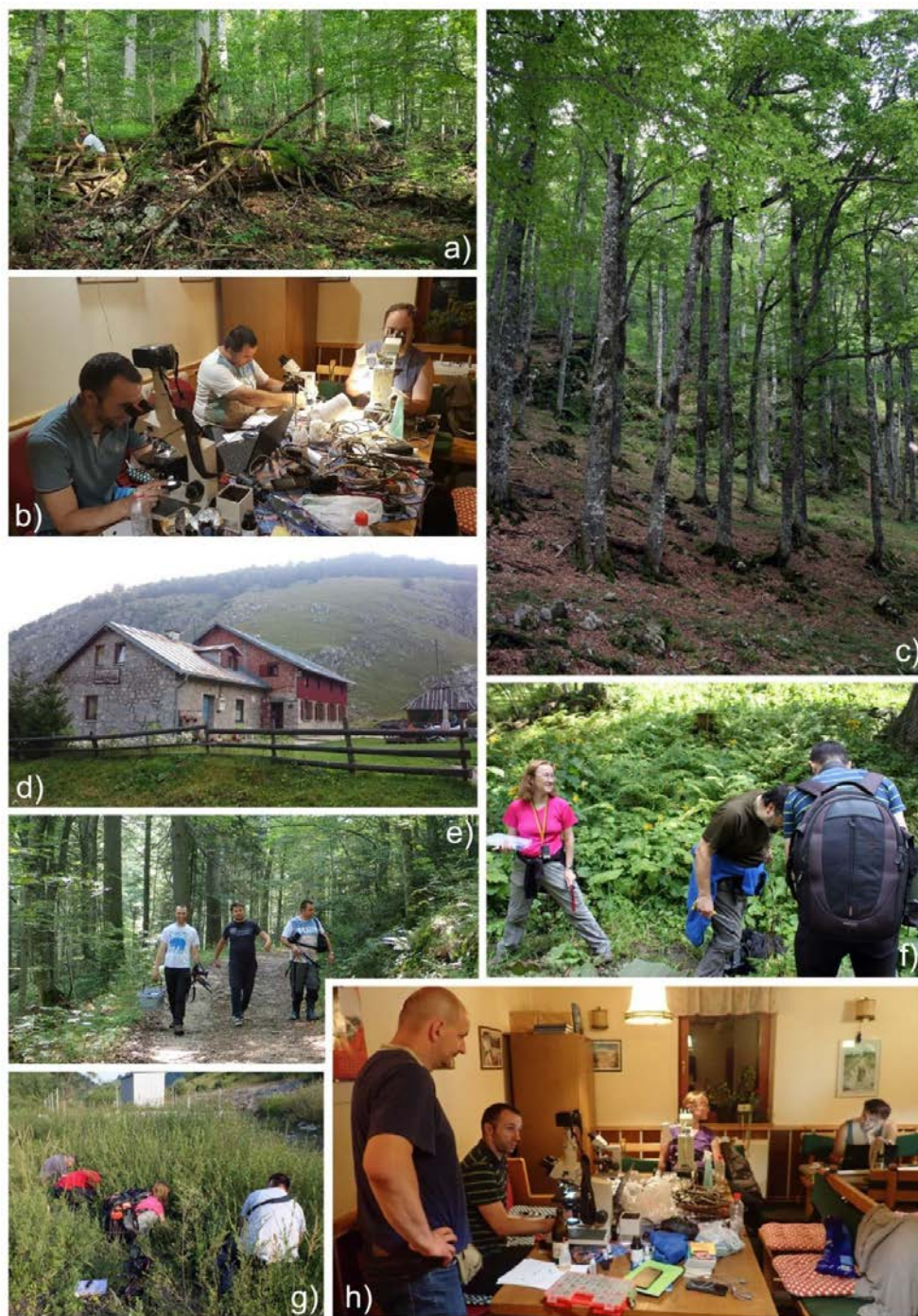
Figure 4. – a), e) Scenery from the virgin forest Ravna vala – Igman Mt.; c) Jelenjača, Visočica Mt.; b), h) Laboratory hours, Workshop Tušila – Visočica Mt; d) Mountain hut Tušila were mycological workshop have been organized, Visočica Mt.; f) Javornik, Igman Mt.; g) River Rakitnica, searching for ascomycetes in the willow shrubs.