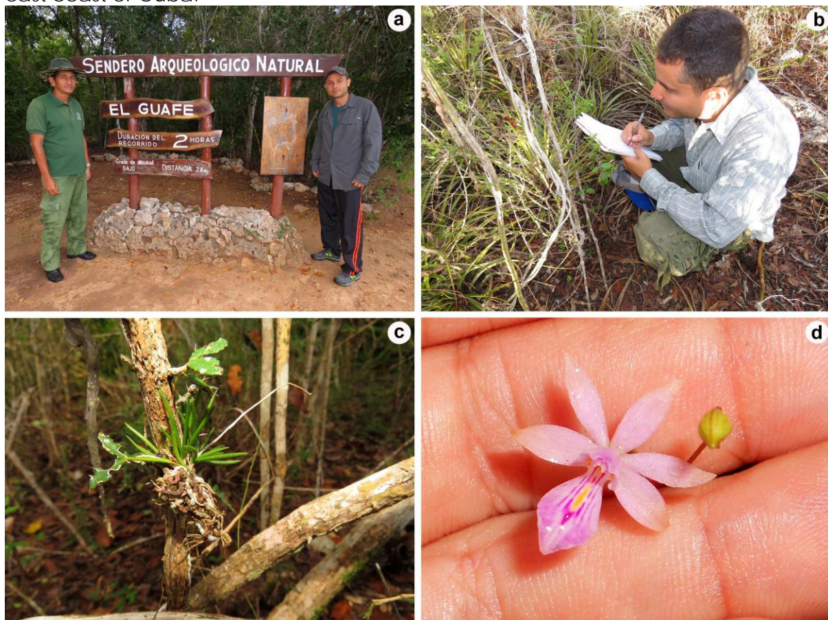
Figure 2. Monitoring of Tetramicra malpighiarum [Orchidaceae] population in “El Guafe”, Desembarco del Granma National Park, Granma province. a) Part of the teamwork at the entrance of the path “El Guafe”, b) Ecological data collection at T. malpighiarum population, c) T. malpighiarum plant in its habitat, d) T. malpighiarum flower.