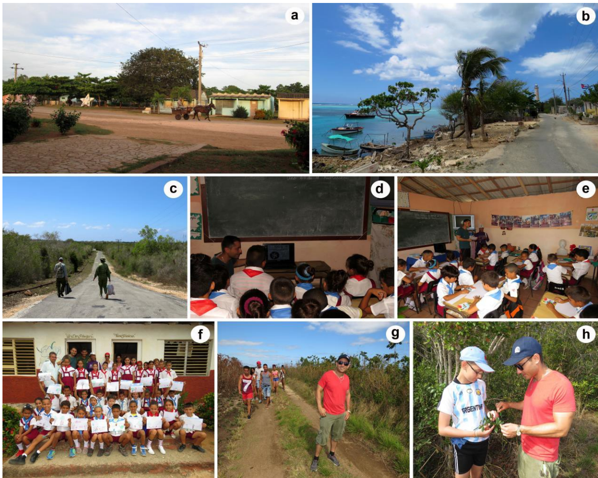
Figure 3. Awareness, environmental education and dissemination activities of the project developed in different human communities located within and on the periphery of the Desembarco del Granma National Park, Granma province. a) Belic Community, b) Cabo Cruz Community, c) Expedition to Cabo Cruz community during one of the visits, d-e-f) Different educational activities developed with primary school children in the communities where our work was carried out, g-h) Interpretive tours developed with children and young people of the communities where our work took place.