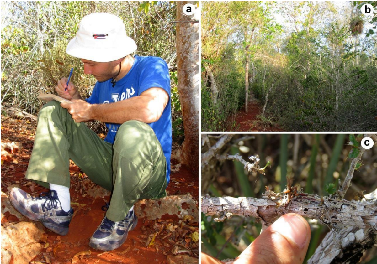
Figure 2. a) Field work in the population of Tetramicra malpighiarum [Orchidaceae] in "El Guafe", Desembarco del Granma National Park, Cuba. b) Habitat of T. malpighiarum in "El Guafe" [transition forest between semideciduous forest and coastal xeromorphic scrubland]. c) Tetramicra malpighiarum individuals in their habitat in "El Guafe".