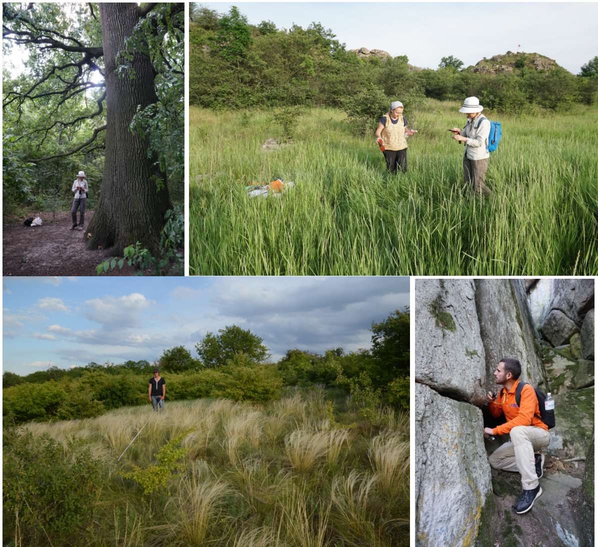
Expedition field work, June-September 2019

According to the National Habitat Catalogue of Ukraine and the results of our field work during June-October 2019, 32 main habitat types are present at the territory of the park, among them there are 20 habitats protected by Resolution 4 of the Berne Convention.