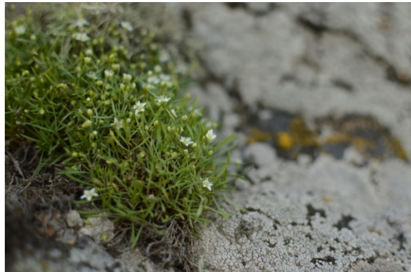
Dianthus hypanicus - endemic of siliceous rocky outcrops in Southern Bug river basin (left); Moehringia hypanica - narrow endemic species with three known populations in National Nature park Buzkyi Gard (right).