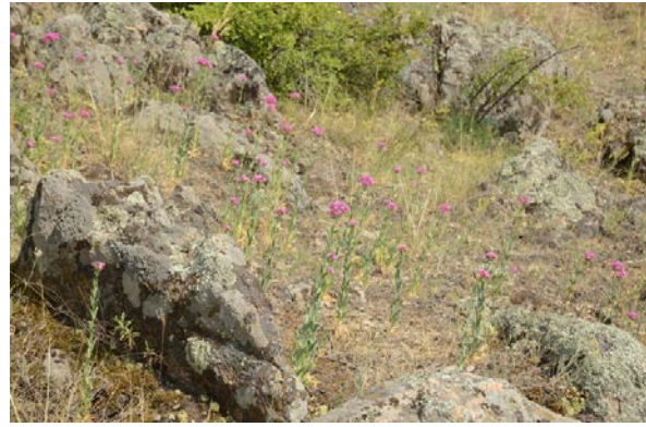
Gymnospermium odessanum - endemic of Pontic steppe region (left); petrophytic steppe vegetation with endemic plant species Silene hypanica in vicinity of Bohdanivka village (right).