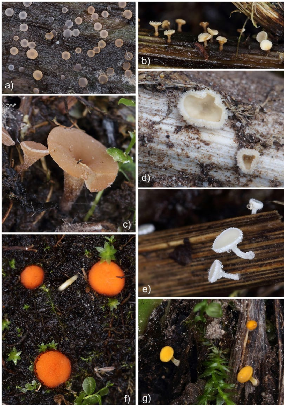
Figure 4. a) Orbilia sarraziniana , Lake Gornje Bare (Mt. Zelengora); b) Cyathicula sp. from Rumex , Lake Donje Bare (Mt. Zelengora); c) Myriosclerotinia duriaeana , Lake Crno (Mt. Treskavica); d) Trichopeziza mollissima , Lake Veliko jezero (Mt. Treskavica); e) Lachnum schoenoplecti , Lake Gornje Bare (Mt. Zelengora); f) Scutellinia heterosculpturata , Lake Gornje Bare (Mt. Zelengora); g) Hymenoscyphus menthae , Lake Veliko (Mt. Treskavica). Photo: Nedim Jukić