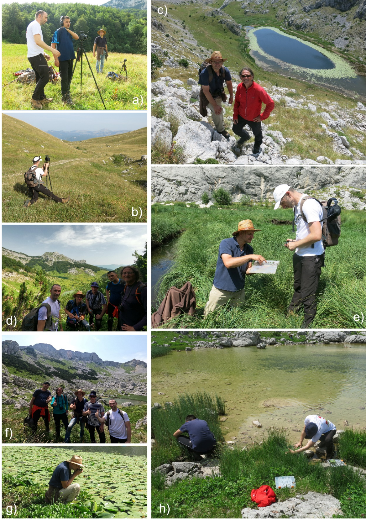
Figure 3. a)-h) Scenery and photos from field research at Lake Veliko, Lake Platno, Lake Bijelo (Mt. Treskavica) and Lake Kladopoljsko (Mt. Zelengora).