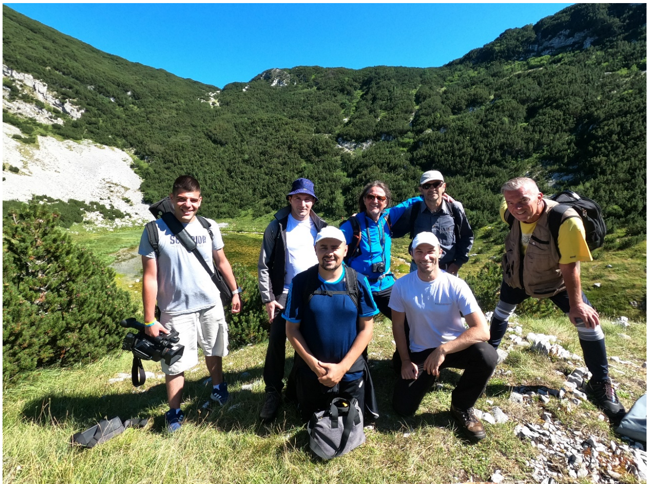
Figure 1. At Lake Lokvanjsko, Mt. Bjelašnica with team from National Broadcasting Service (BHRT).