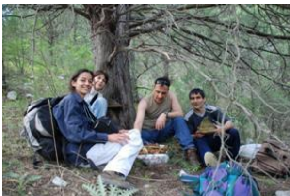
Photo of team in the field