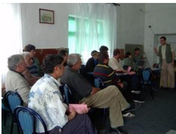
Workshop in Calakli in progress

In October 2008 a meeting was organised with Ministry of Environment and Physical Planning and Galicica National Park and local representatives, with the main topic - protection of Golem Grad islet and the measures to be undertaken.