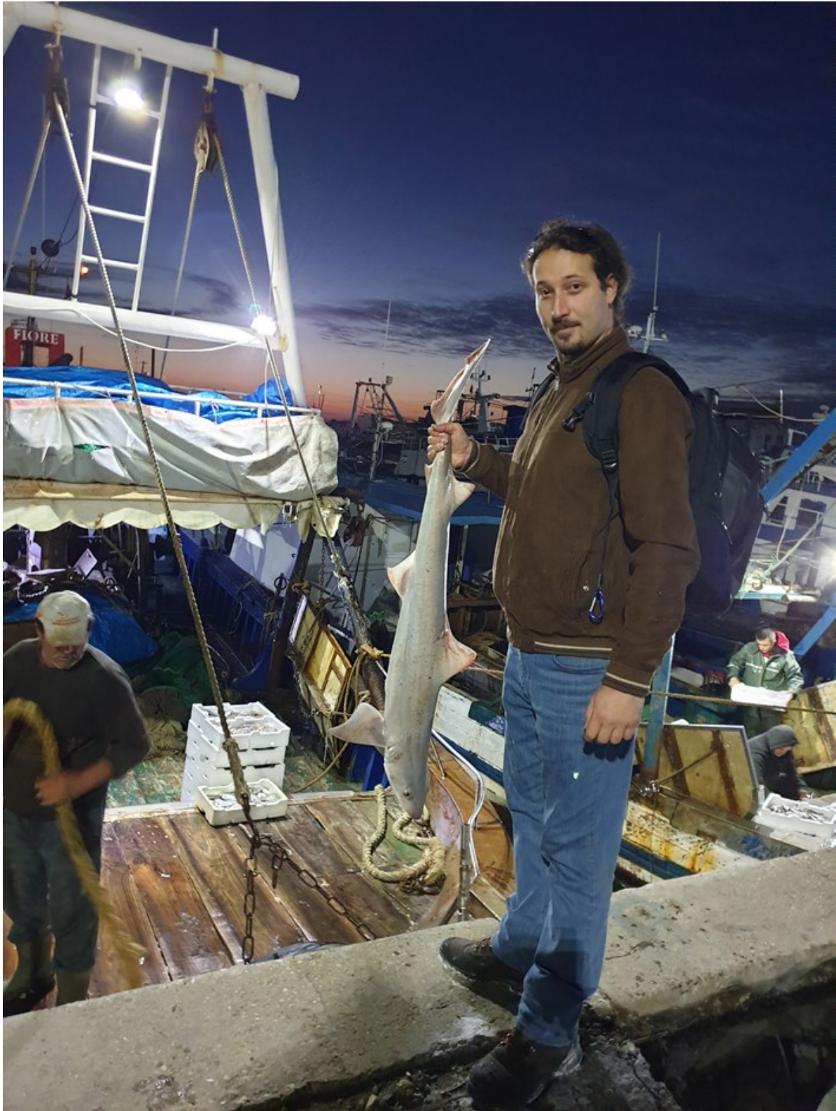
Monitoring the landed sharks in Triport December 2021.