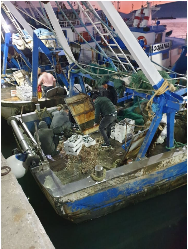
Bottom trawlers in Triport January 2022.