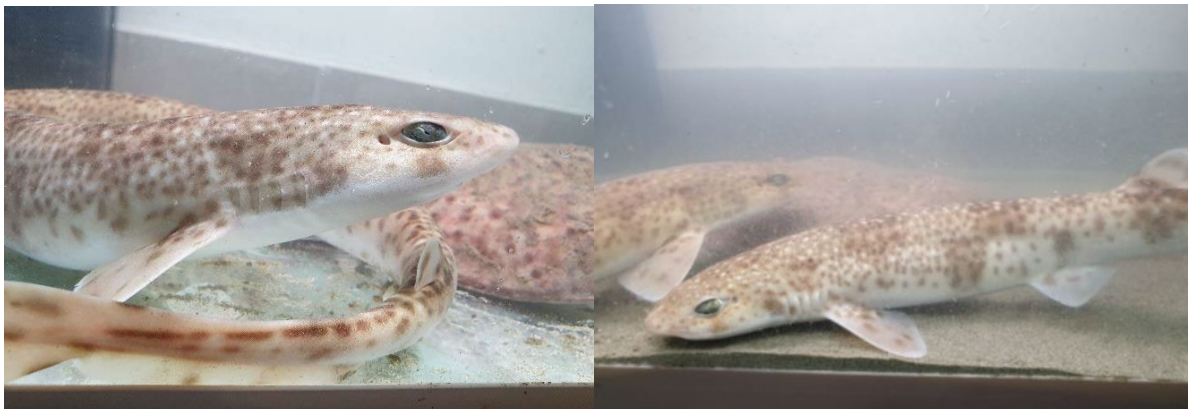
Fig. 5-6: Gravid catsharks and torpedo rays caught by bottom trawlers and resuscitated in our oxygen-rich quarantine aquariums, prior to release.

Individuals that showed any signs of life were immediately subjected to resuscitation in our oxygen-rich quarantine aquariums and were released back to the sea after 3 days of detailed stress measurements and observation. In such a way, we have released numerous gravid catsharks ( Scyliorhinus canicula and Scyliorhinus duhameli ), blackspotted smooth-hounds ( Mustelus punctulatus ) and marbled electric rays ( Torpedo marmorata ). Obtained scientific data will be used to increase the post-release survival rates.