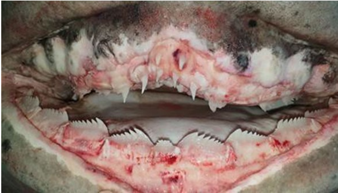
Fig. 7-8: Adult female (500 cm TL, 410 kg TW) sampled in Triport, Vlorë.