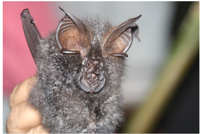
Fig. 2 - Frontal view of R. luctus captured in Parbati cave of Paang, Parbat on October 2017.

In Parbat district, a single individual of R. luctus was observed roosting inside Parbati cave (N28° 15'10.8", E83° 38'36.5" at 846 m above sea level) on October 12, 2017. The cave consisted of two chambers, one accessible and another inaccessible. It had four entrances with an estimated 25 m height, 10 m and 17 m width in two openings and 85 m length in the accessible flank. The length of inaccessible chamber could not be estimated. The surrounding vegetation consisted of Bambusa spp , Ficus spp , Diploknema butyracea (Roxb.) H.J. Lam and Pinus roxburghii Sarg. Mist nets were installed at the cave openings of both sides and R. luctus was captured in the mist net set up at the Southern opening at a height of two meters from ground level. Harp traps were not used in this site because of the large height and width of the entrance. C. sphinx , Rhinolophus pussilus , Rhinolophus affinis , Miniopterus schreibersii , H. armiger and