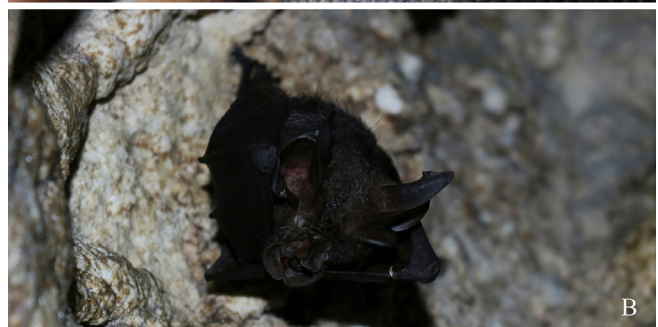
Fig. 4 - Differentiating characteristics between Rhinolophus pearsonii and Rhinolophus luctus . Figure 'A' is a R. pearsonii with smaller noseleaf devoid of any basal circular lappets on either side of sella (Photo credit: Hari Basnet). Figure 'B' is a R. luctus with clear basal circular lappets."