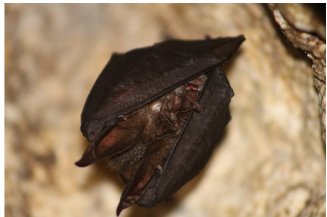
Fig. 3 - R. luctus with a well-developed lancet photographed in Bat Cave, Kaski on March, 2018.