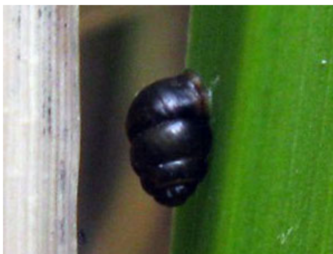
Fig. 3. Alive Vertigo moulinsiana on the grass in the vicinities of Velyka Glusha (plot 10).

The 33 specimens of V. moulinsiana (fig. 2) were collected in the two distant plots (at 5.5 km from each other) in fens, mainly alive from the vegetation, most frequently from the leaves of Carex spp. (fig. 3). Width of shell in collected specimens is 1.4–1.6 mm, height — 2.4–2.7 mm. Shell is ovate, dark brown or reddish, of 4.5–5 whorls. Aperture with broadly reflected margins, palatal incision, clear callus and 5–7 teeth: 1 parietal, 1 columellar, 1 basal, 2 palatal and often also additional small parietal and/or palatal. This is clearly corresponding to the descriptions of V. moulinsiana and within the known variability of this species (Pokryszko, 1990; Balashov, 2016 b).