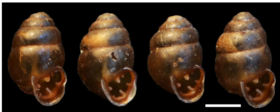
Fig. 2. Shells of Vertigo moulinsiana from the vicinities of Velyka Glusha (plot 10), scale bar 1 mm.