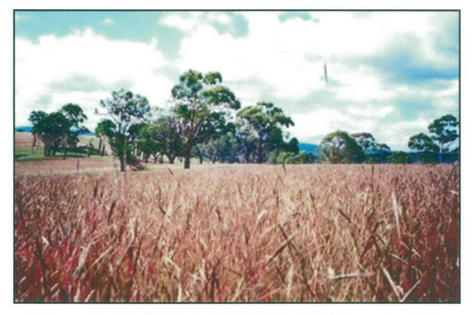
Redgrass ( Bothriochloa macra ) dominated ground-storey vegetation, near Armidale, NSW