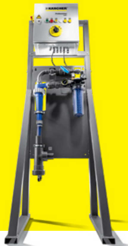
WRP Car Wash water reclamation system