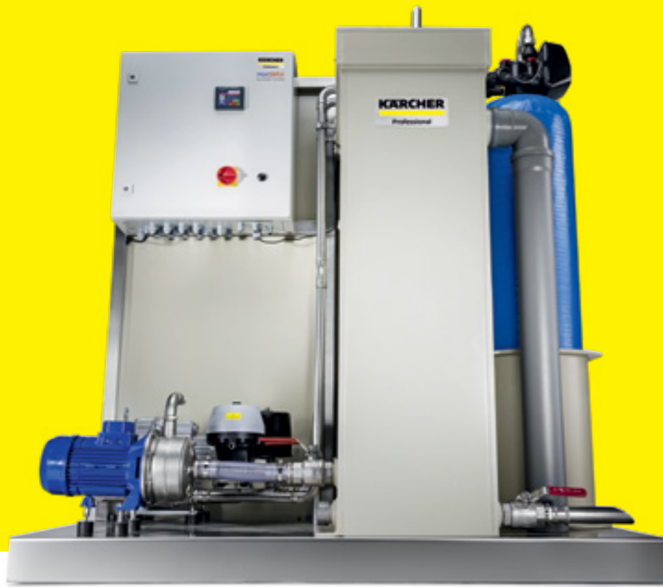
WRB Bio water reclamation system