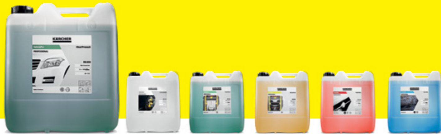
VehiclePro Klear!Prewash RM 890