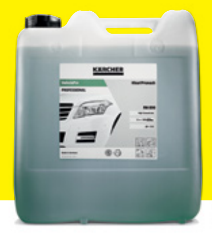
VehiclePro Klear!Prewash RM 890