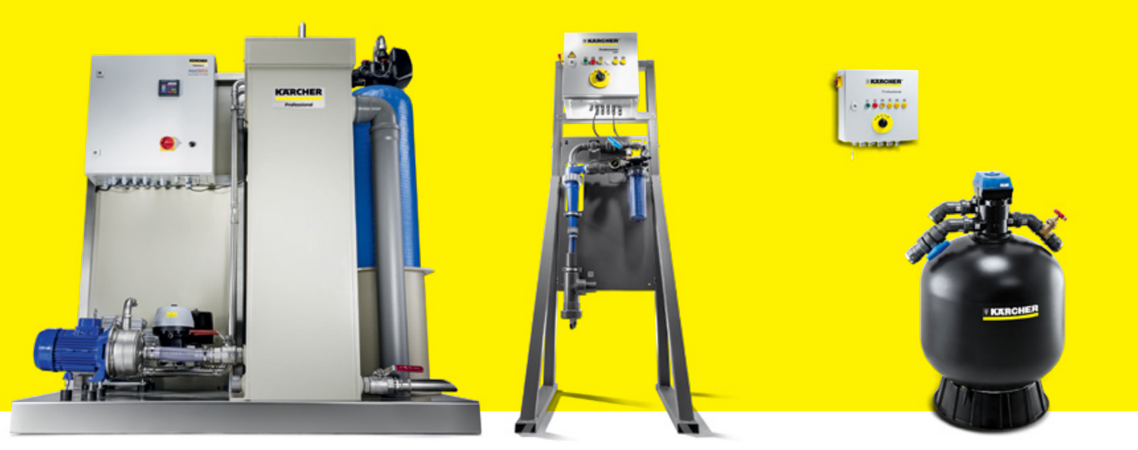
WRB Bio water reclamation system