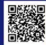
The Compass for Information Literacy Enlightenment