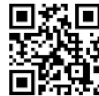
UCHIDA YOKO Web Site

3-25, Toyo 2-Chome, Koto-ku, Tokyo 135-0016 Japan school@uchida.co.jp