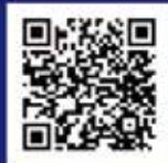
Cyber Security Job File vol.1