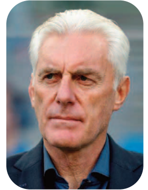
Head Coach of South Africa

I'm happy about the mentality of the team. I think the players showed a good mentality in Harare and it was good for me to see. Defensively I think it was alright. We didn't give too many chances to Zimbabwe and the defence was there so I'm happy about that also.