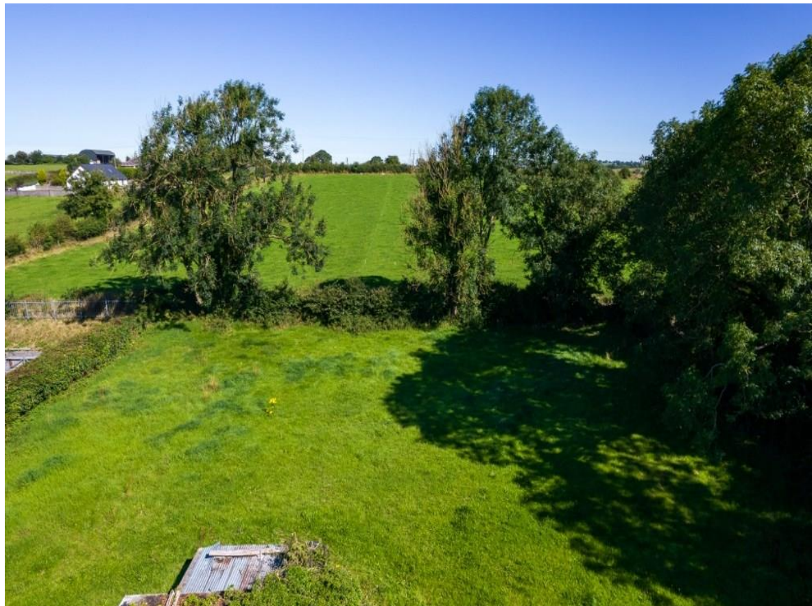
Lissacarrow, Fuerty, Co. Roscommon. F42 W229