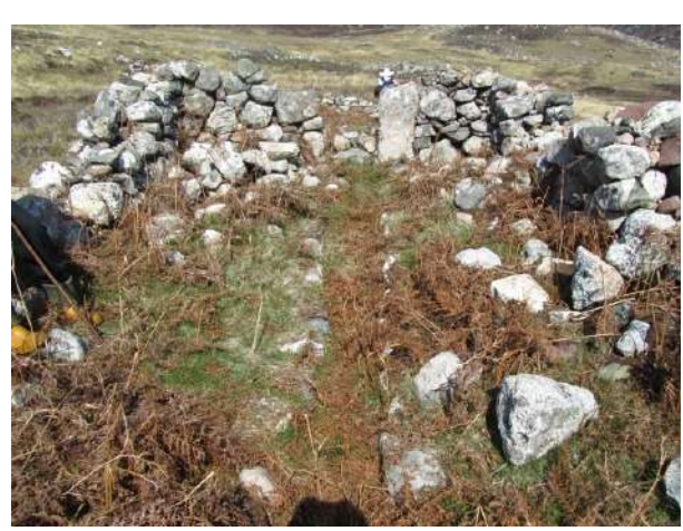
One of the byre drains