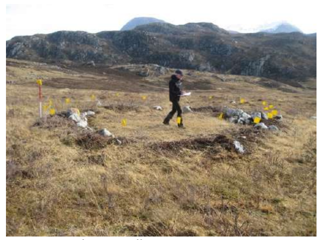
Surveying the roundhouse

A classic horse shoe shaped burnt mound lies beside a small burn.