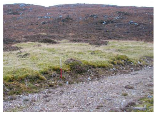
Rig and furrow sectioned by track Meryl Marshall