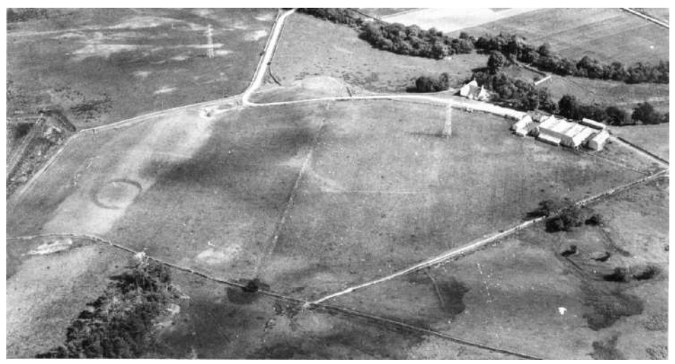
The Torboll Farm Henge

Torboll Farm, outside Dornoch, has one final henge <u>MHG11761</u> that you don't need to visit: there is nothing visible on the ground, just a field.