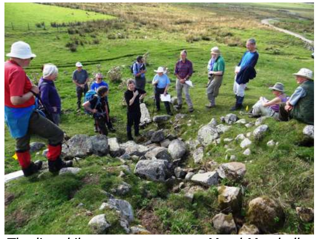
The lime kiln