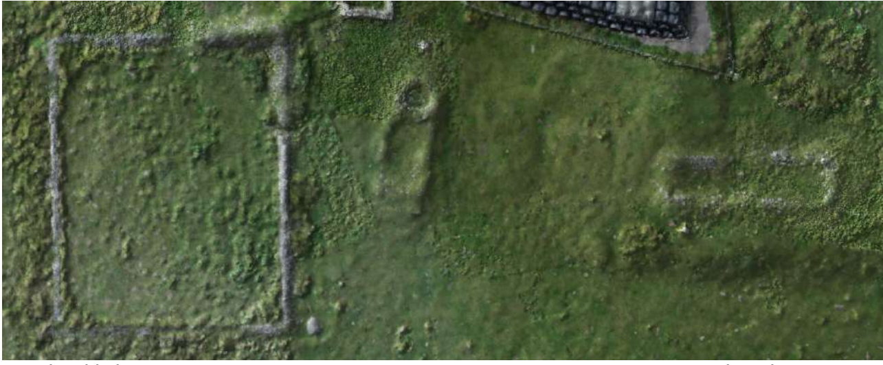
Low level lighting