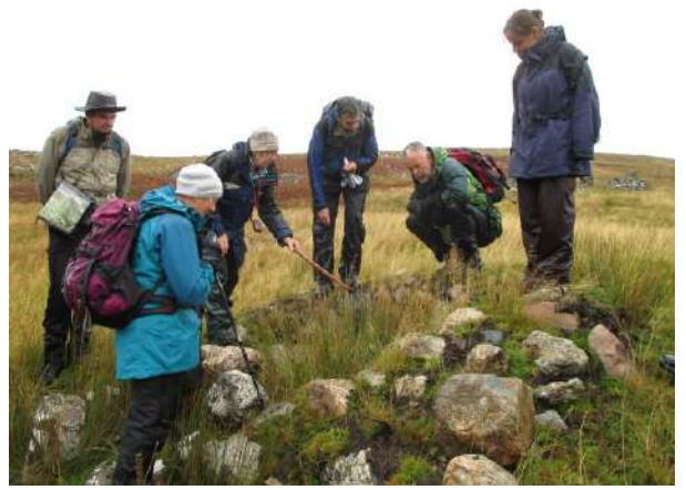
Explaining the workings of the kiln