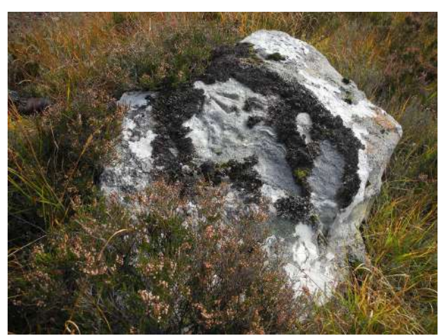
Spot the benchmark

We had noted several bench marks on the 1st edition OS map and we were to find two of them.