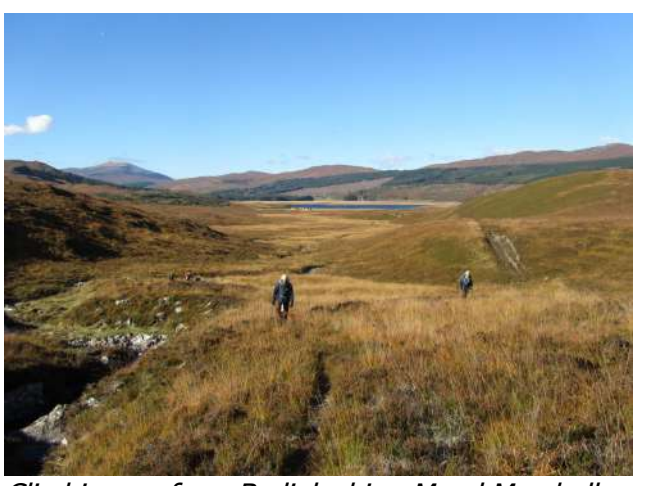
Climbing up from Badinluchie Meryl Marshall

The track southwards was easy going and climbed gradually.