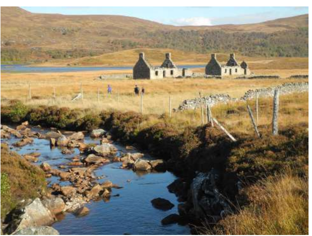
Two buildings at Badinluchie