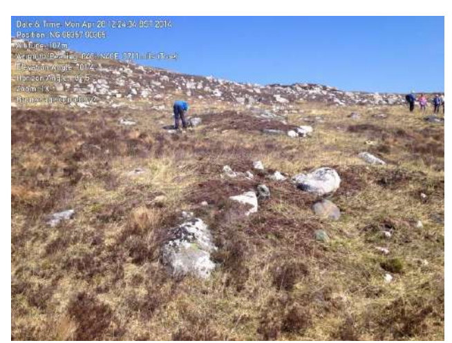
Possible burial cairns

We have established that this is a multiperiod settlement site. There is a 9 m diameter roundhouse with associated field wall and possible burial cairnfield with at least five cairns.