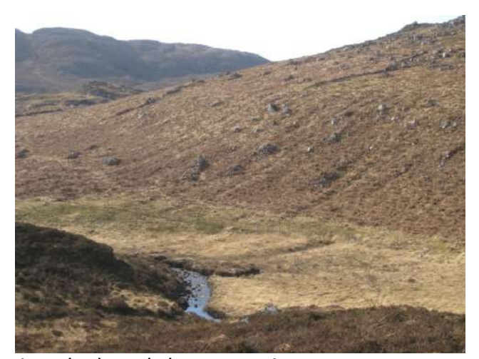
Lazy beds and clearance cairns

There are five large enclosures with turf and stone walls, plus numerous smaller enclosures, extensive lazy beds, stone clearance piles, lynchets and lots and lots of walls! The footings of thirteen small shielings/buildings lie on the slopes around the main township which is built on the top of a group of knolls above the boggier moorland.