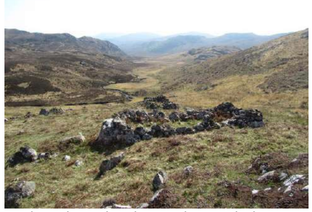
Looking down the glen at Glenarigolach

During the Highland Archaeology Festival 2014 NOSAS led a walk to the site on their second visit to the area. We were not quite so lucky with the weather as in April, but still enjoyed exploring the ruins and features, although some were submerged in bracken.