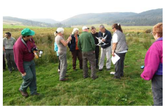
Preparing to fly