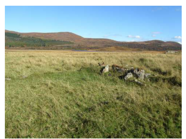
Fireplace with side slabs

But we were more interested in the remains of another building beside the burn; could this be the old inn? A roofed building appears on the first edition OS map but very little is left of it and what did remain was badly wasted;