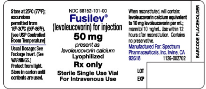
Fusilev Vial - Lyophilized