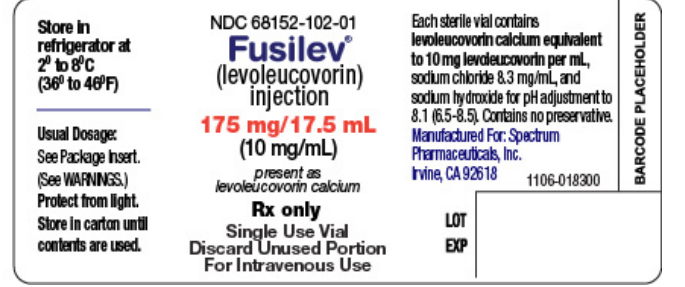
Fusilev Vial - 175 mg / 17.5 mL