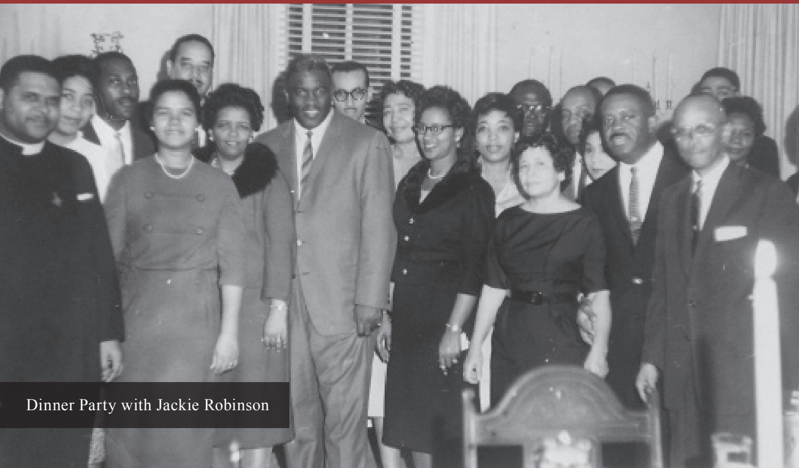
Dinner Party with Jackie Robinson