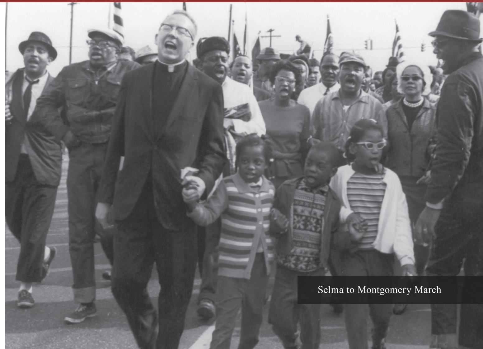
Selma to Montgomery March