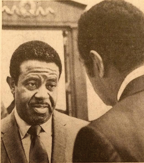
The Rev. Ralph David Abernathy, left, and Representative John Conyers Jr., Michigan Democrat, at news conference.

Meanwhile, Representative John Conyers Jr., Democrat