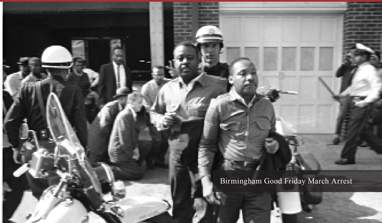
Birmingham Good Friday March Arrest