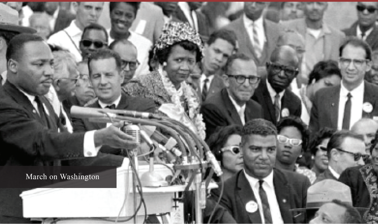
March on Washington