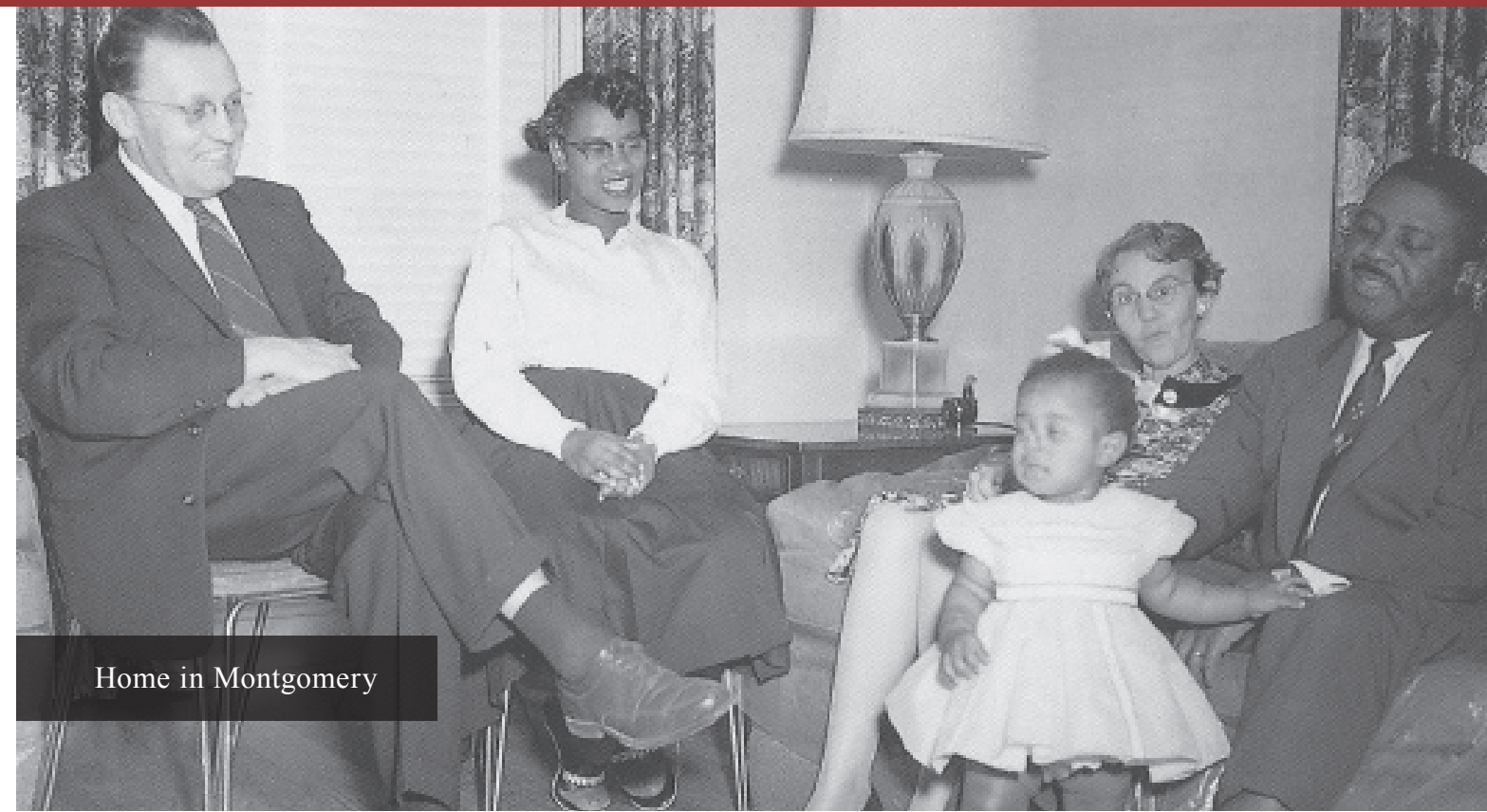
Home in Montgomery