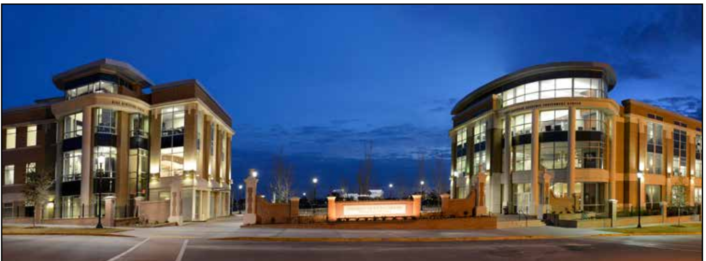
University of South Carolina Athletics Village

Rice Athletics Center – 3rd Floor 1304 Heyward Street Columbia, SC 29208 Phone: (803) 777-1519 Fax: (803) 777-9070 E-mail: athcompl@mailbox.sc.edu Follow us on Twitter: @UofSCCompliance