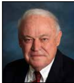
Miles Loadholt 2nd Judicial Circuit