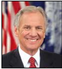
Henry D. McMaster Governor of South Carolina Ex Officio Chairman