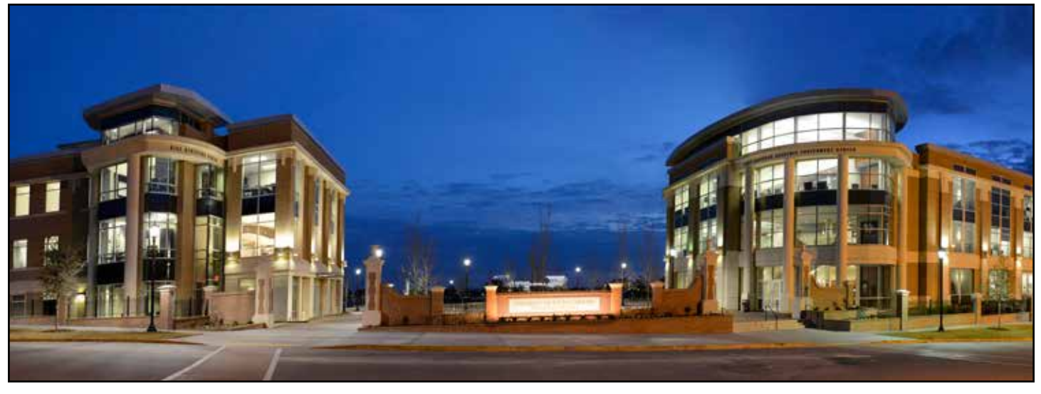
University of South Carolina Athletics Village

Rice Athletics Center – 3rd Floor 1304 Heyward Street Columbia, SC 29208 Phone: (803) 777-1519 Fax: (803) 777-9070 E-mail: athcompl@mailbox.sc.edu Follow us on Twitter: @UofSCCompliance