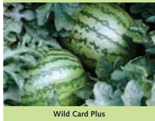
Wild Card Plus