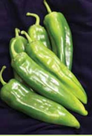
Hot Pepper - Charger