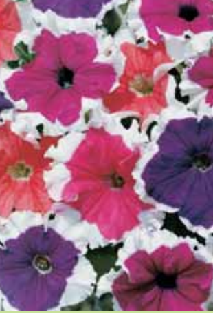
Petunia Frost Series