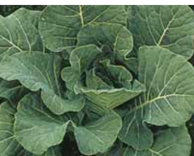
Collards Top Bunch

UT78P BARON 45 days. Unique upright growth keeps broad-round dark green leaves clean. Easy to cut. 1,000 seeds $1.91; 5,000 seeds @ $0.94 per M; 25,000 seeds @ $0.76 per M, 100,000 seeds & over $0.66 per M.