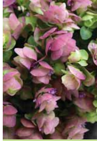
Ornamental Oregano Kirigami