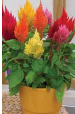
Celosia Kimono Formula Blend