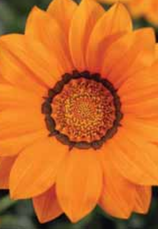
Gazania Big Kiss Orange