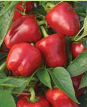
Pepper - Snackabelle Red