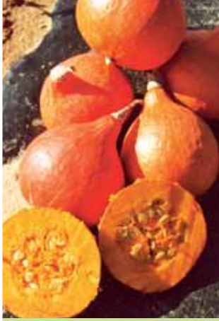
Mini Orange Hubbard