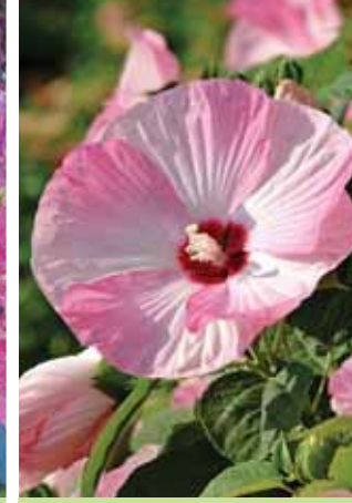
Hibiscus Luna Pink Swirl