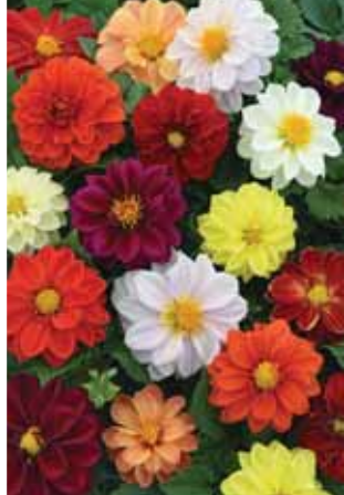
Dahlia Figaro Mix