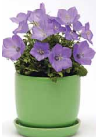
Campanula Rapido Blue