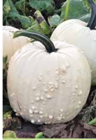
Pumpkin - Specter