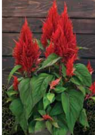
Celosia Century Salmon Pink