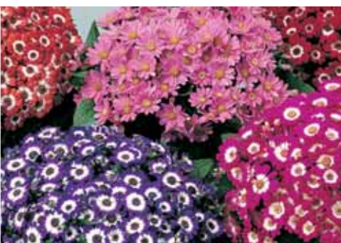
Cineraria Jester Mix

P816B Jester® Mix (6 in/15 cm) Compact, very uniform, small flower, small leaf miniature. High percentage of bicolors in a 5 color mix. Use for 5-6 in/13-15 cm pots. Pelleted seed only. Pkt. (10 pellets) $3.95; 100 pellets $18.50; 500 pellets $82.20; 1,000 pellets & over $125.79 per M.