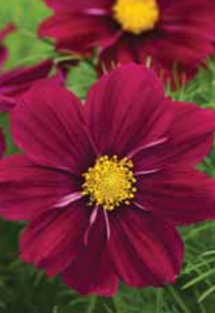
Cosmos Sonata Purple Shades