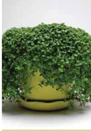
Ornamental Mini Mint