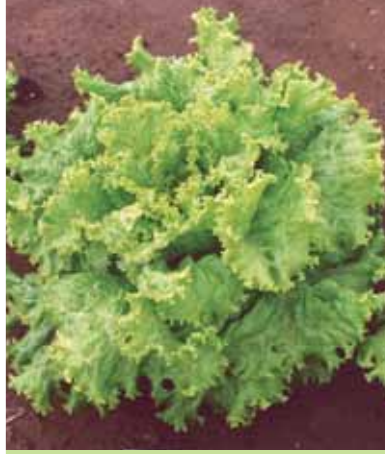
Grand Rapids TBR