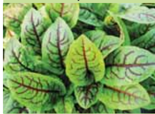
Red Veined Sorrel

160T ANTARES FENNEL 68 days. Annual. Uniform, pure white, round bulbs with dark green fern-like foliage, resists tip burn and is slow to bolt. Very sweet licorice/anise flavor. AAS Winner. Pkt. (25 seeds) $3.50; 1,000 seeds $18.62; 10,000 seeds & over $15.10 per M.