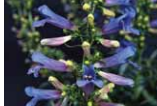
Penstemon Electric Blue