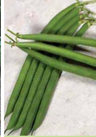
Bean - Desperado