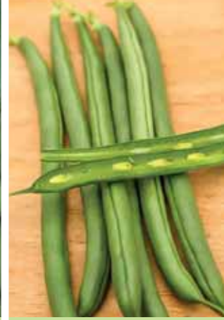
Pole Bean Seychelles