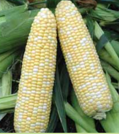
Gourmet Sweet™ Caliber XR