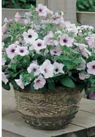
Tidal Wave Silver