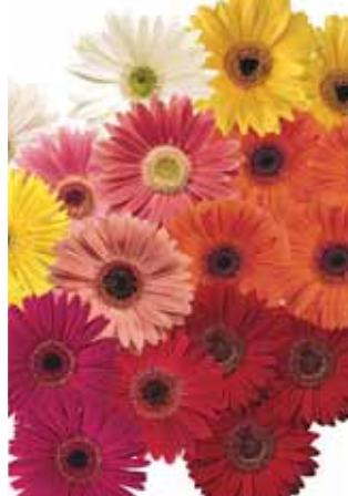
Gerbera Festival Select Growers Mix