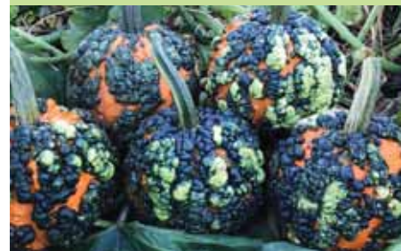
Pumpkin - Miniwarts