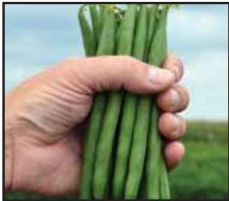
Lasalle Pg 4