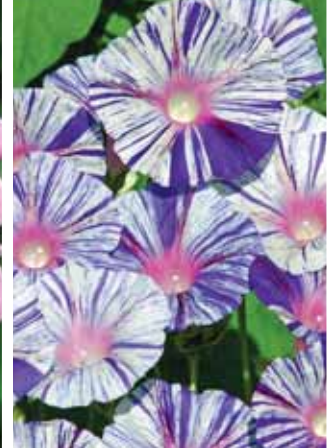
Morning Glory Venice Blue