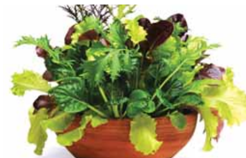
Global Gourmet Mix

P173C CARETAKER M.I. 88 days. Darker green medium sized iceberg type heads with good texture and taste. Wrapper leaves are long and moderately savoyed. Cap leaf provides protection from tip burn. Pellets only. pvp