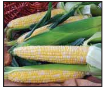
Nectar Pg 22