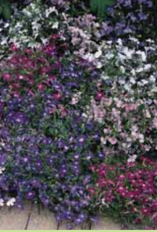
Lobelia Cascades Mix