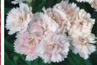
Sweet William Dynasty White Blush