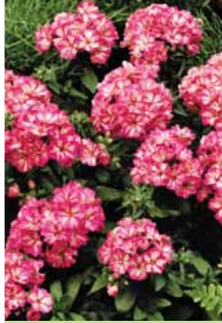
Phlox Grammy Pink & White