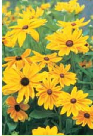
Rudbeckia Indian Summer