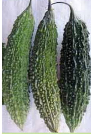
Bitter Gourd Long Thick