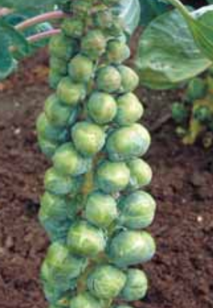
Brussels Sprouts Confidant