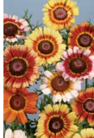
Chrysanthemum Annual Mix