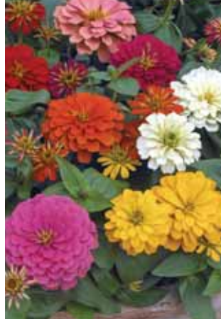
Zinnia Magellan Mix