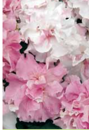
Petunia Double Cascade Orchid Mist