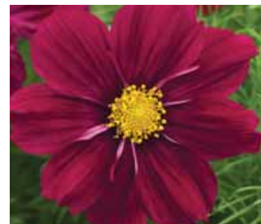
Cosmos Sonata Purple Shades

VIOLA - Sorbet XP Pink Wing: Early prolific bloomer with uniform habit that remains compact in a range of weather conditions. Colormax Lemonberry Pie Mix: A giant-flowered viola that is heat tolerant and fills pots easily, even under heat stress where standard violas suffer. It is a superb autumn performer and a great choice to start the season.