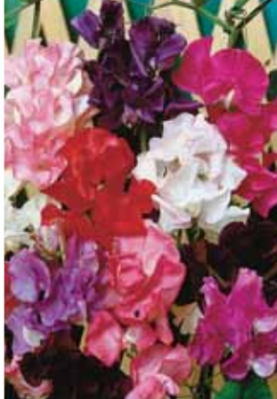
Sweet Pea Mammoth Series