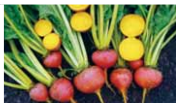
Beet Touchstone Gold