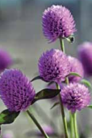
Gomphrena Ping Pong Lavender