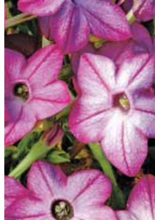
Nicotiana Saratoga Purple Bicolor