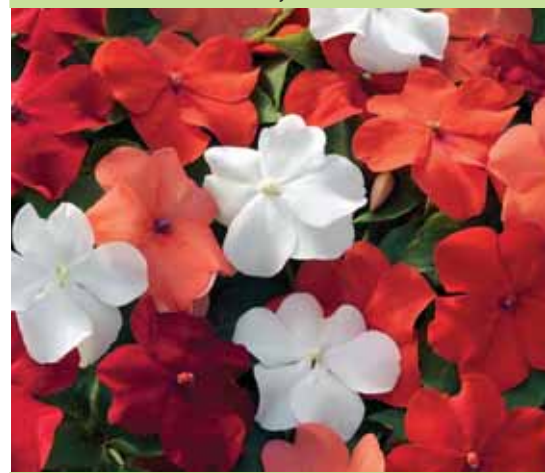
Xtreme Hot Mix