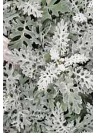
Dusty Miller Silverdust