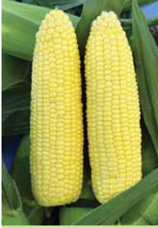
Gourmet Sweet™ Vision MXR