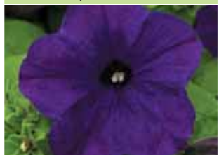
Dreams Midnight Blue