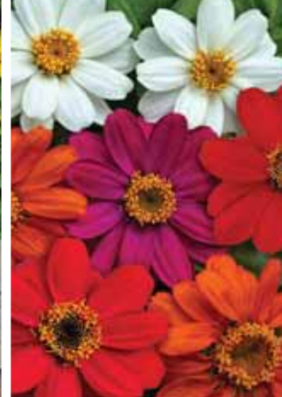
Zinnia Profusion AAS Mix