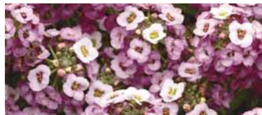
Alyssum Clear Crystals Lavender Shades

Prices for Easter Bonnet coated seed: 5,000 seeds & over $3.73 per M.