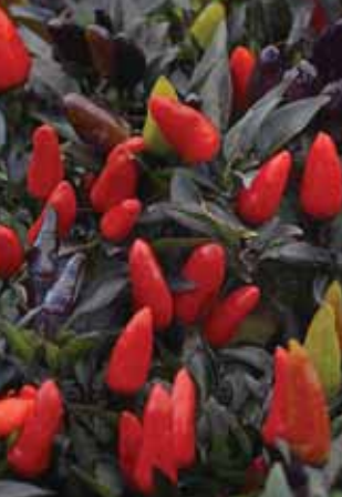
Capsicum Midnight Fire