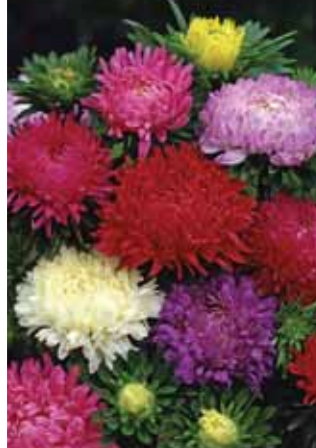
Aster Duchesse Formula Mix