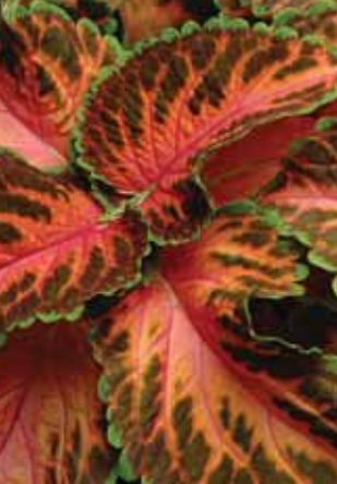
Coleus Wizard Coral Sunrise