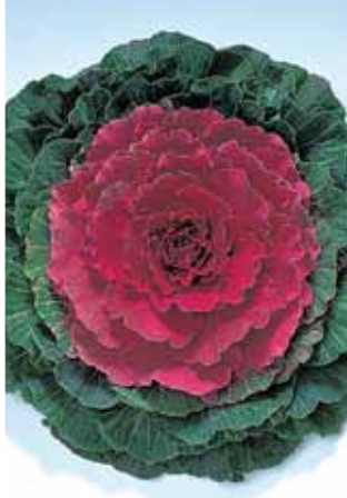
Flowering Kale Pigeon Red