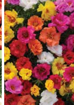
Happy Hour Mix