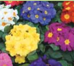
Primula Orion Mix