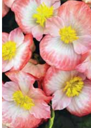
Sprint Plus Blush