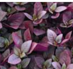
Alternanthera Purple Prince

1261M SuperNova™ Mix (8 in/20 cm) Not as hardy as Pacific Giants but has better disease tolerance and is earlier flowering. Extra large 2 in/5 cm blooms on 4 in/10 cm umbels. Wider color range of up to 11 colors. Pkt. (25 seeds) $4.75; 100 seeds $18.95; 1,000 seeds & over $88.70 per M.