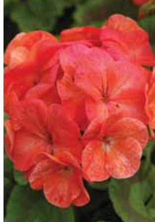
Geranium Pinto Premium Salmon Splash