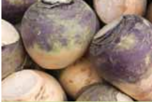
American Purple Top