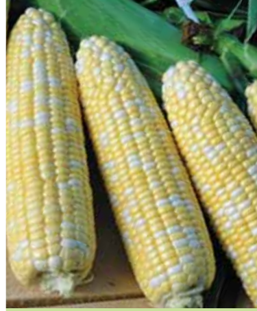
Gourmet Sweet™ American Dream