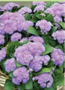
Ageratum Aloha Blue