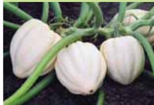
Cream of the Crop