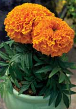
Proud Mari Orange