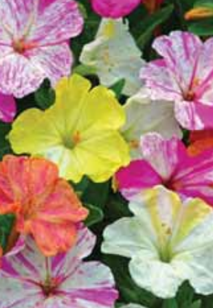
Four O'Clock Marbles Mix