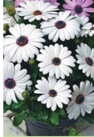
Osteospermum Asti White