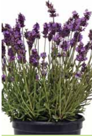
Lavender Avignon Early Blue