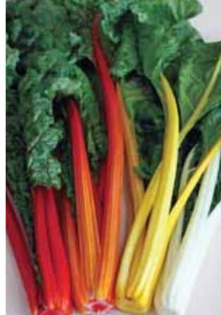
Swiss Chard Celebration