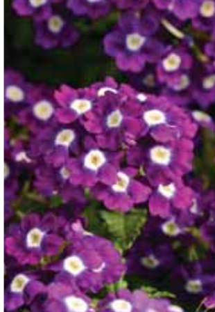
Verbena Quartz Violet/Eye XP