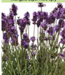
Lavender Avignon Early Blue