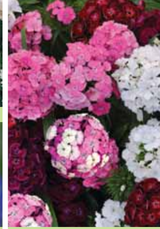
Sweet William Dash Mix