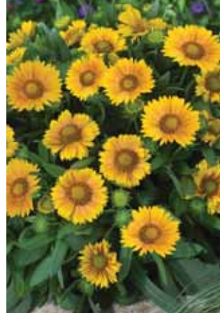
Gaillardia Arizona Apricot