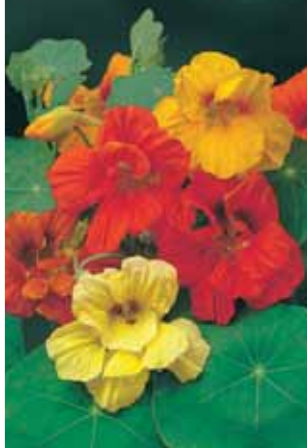
Nasturtium Whirlybird Mix