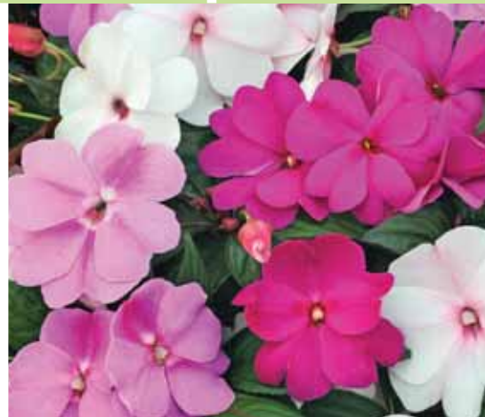
Divine Mystic Mix

Prices for Florific colors: 50 seeds $8.10; 250 seeds $26.25; 1,000 seeds & over $82.96 per M.