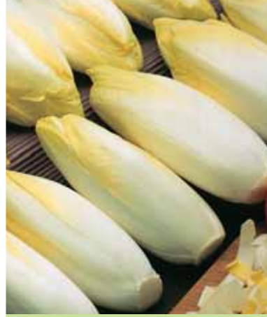
Chicory Witloof Bruxelles