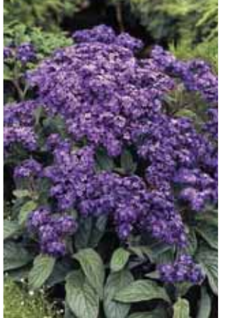
Heliotrope Marine Lemoine Strain