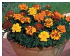
Durango Outback Mix

Prices for Durango colors & mixes: Pkt. (25 seeds) $2.50; 1,000 seeds & over $11.05 per M.