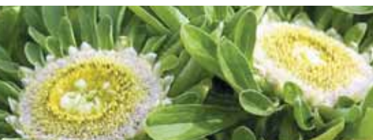
Unique Aster Hulk

631 Hulk (24 in/61 cm) Unique flower features pale green blooms without petals. Likes partial sun or some shade for good color. Pkt. (100 seeds) $2.95; 1,000 seeds & over $34.19 per M.