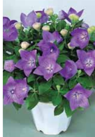
Platycodon Sentimental Blue