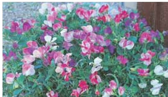
Sweet Pea Cupid Pink

1628 Incense Mix Best color selection of the most fragrant cutting varieties. Pkt. (80 seeds) $3.50; oz. $29.10; 1/4 lb. $77.25; lb. & over $279.45 per lb.