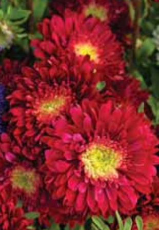
Aster Bonita Scarlet