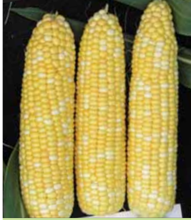
Gourmet Sweet™ Awesome XR