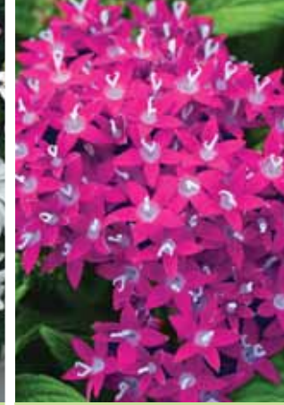
Pentas Lucky Star Raspberry