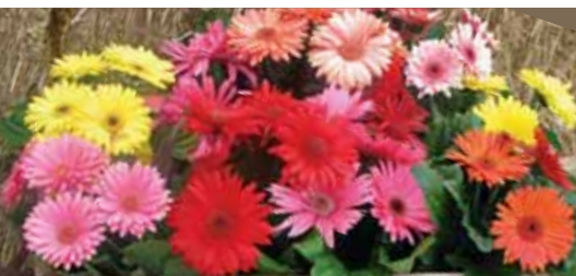
Gerbera Royal Premium Mix

968 Empress Mix (10 in/25 cm) Best potted plant blend of solid colors and picotee shades. European strain. Pkt. (25 seeds) $3.75; 250 seeds $16.60; 1,000 seeds & over $44.79 per M.