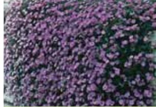
Aubretia Mixed Hybrids