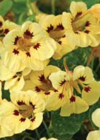
Nasturtium Cream Troika