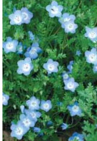
Nemophila Baby Blue Eyes