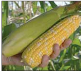
Flagler Pg 20