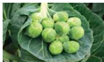
Brussels Sprouts Gustus