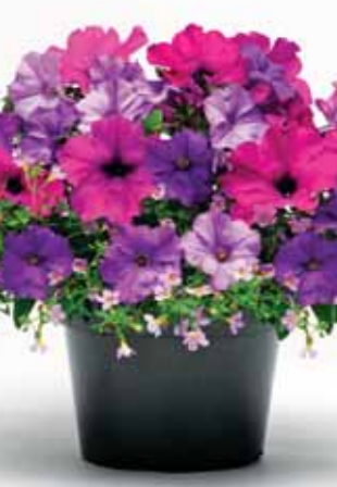
Fuseables Healing Waters