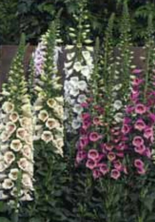
Foxglove Camelot Mix