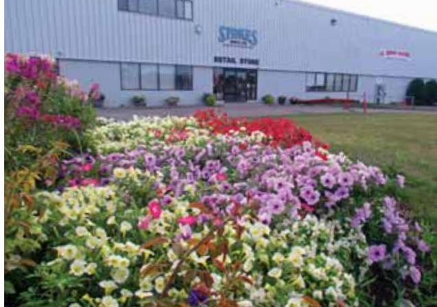
Thorold, Ontario - Offices, Warehouse & Retail Store