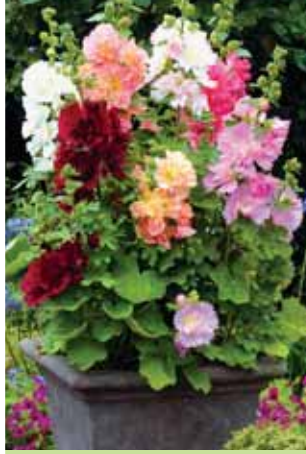
Hollyhock Spring Celebrities Mix