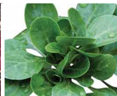
Corn Salad Baron