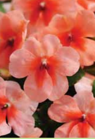
Super Elfin Salmon Splash XP