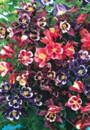
Aquilegia Winky Single Mix