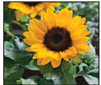
Smiley Helianthus Pg 72