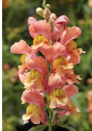
Snapdragon Snaptini Peach