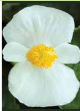
Begonia TopHat White