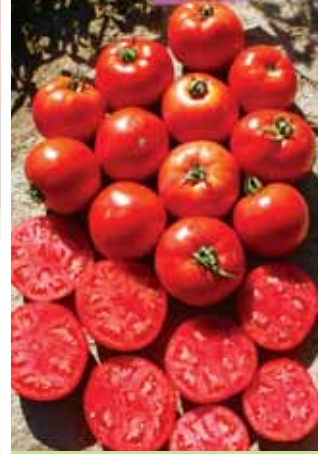
Rocky Top VFFF