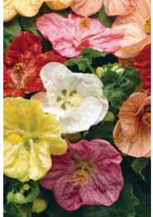
Abutilon Bella Select Mix