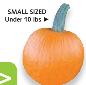
SMALL SIZED Under 10 lbs ▶