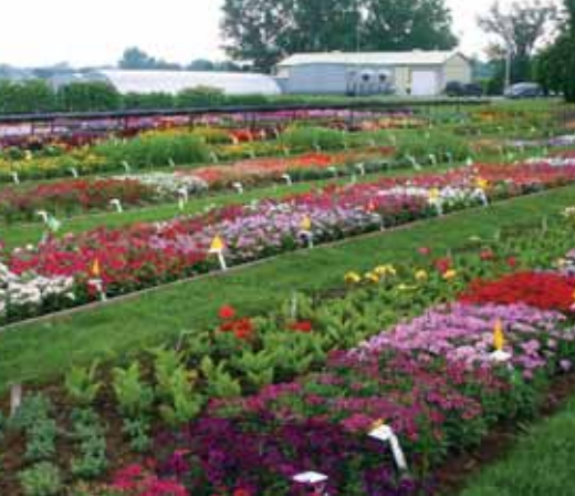
St. Catharines, Ontario - Trial Gardens