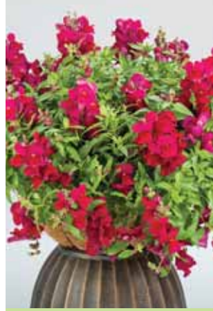
Candy Showers Purple