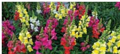
Candy Tops Mix

Prices for Twinny colors & mix: Pkt. (50 seeds) $2.95; 500 seeds $17.20; 1,000 seeds & over $25.59 per M.