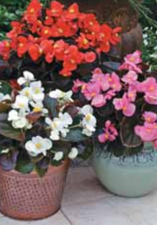
Bada Boom Series