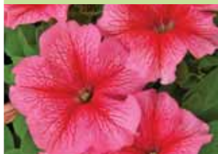
Limbo GP Red Veined