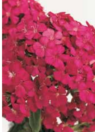
Dianthus Amazon Neon Cherry