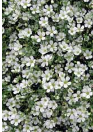
Gypsophila Gypsy White