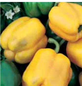
Golden Cal Wonder