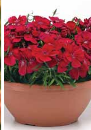
Dianthus Corona Cherry Red