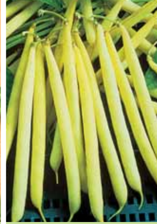
Pole Bean Kentucky Wonder Wax