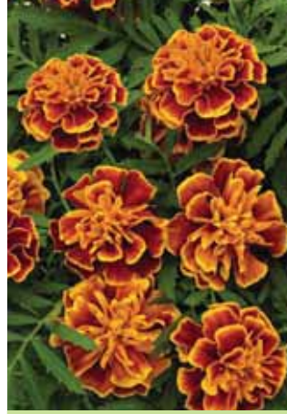
Super Hero Orange Flame