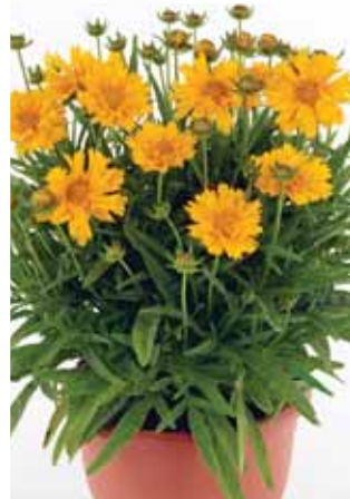
Coreopsis Double the Sun