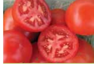
Red Mountain V1V2FF