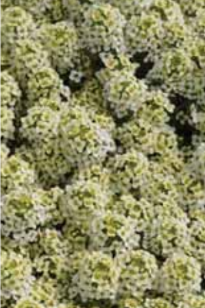
Alyssum Easter Bonnet Lemonade