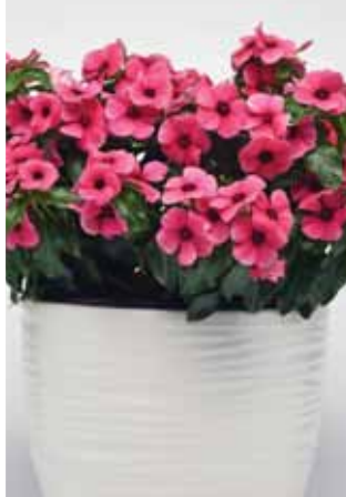
Vinca Tattoo Raspberry