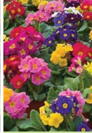
Primula SuperNova Mix