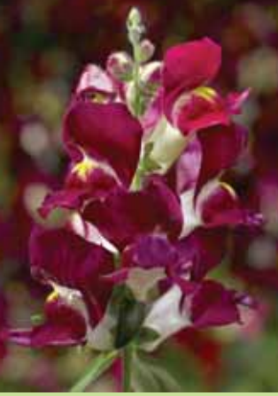
Snaptnini Burgundy Bicolor