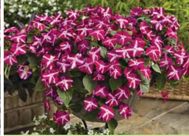
Tumbler Violet Star