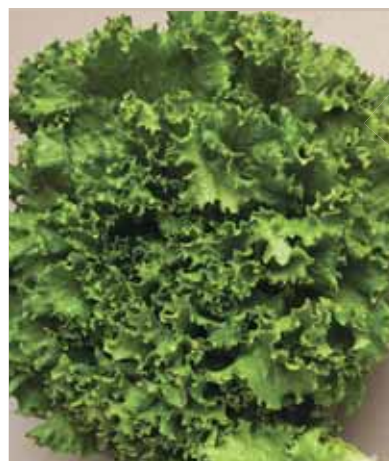
Hoja Verde M.I.