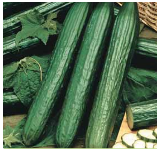
Long European Cucumber - Carmen

257D CHESAPEAKE F1 hybrid. Very early, smooth, blocky fruit change color from dark green to red rapidly. Tall plant provides excellent fruit cover and matures higher yields of red fruit on stakes than row crop varieties. Extend fresh market harvests throughout early summer until mid fall with high tunnel protection. Pkt. (25 seeds) $29.75; 250 seeds $230.05; 500 seeds $348.30; 1,000 seeds $600.25; 5,000 seeds and over $518.84 per M.