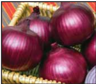
Rubillion Pg 37