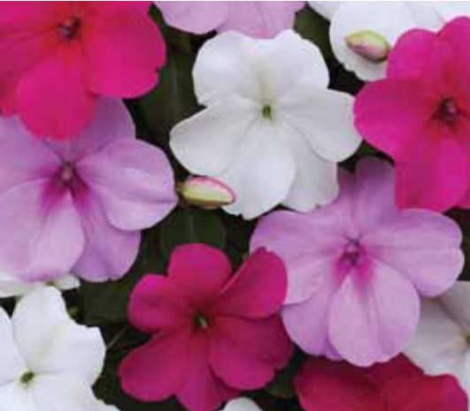
Impreza Wedgewood Mix