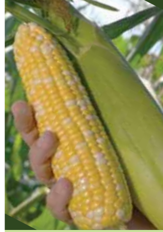
Gourmet Sweet™ Flagler