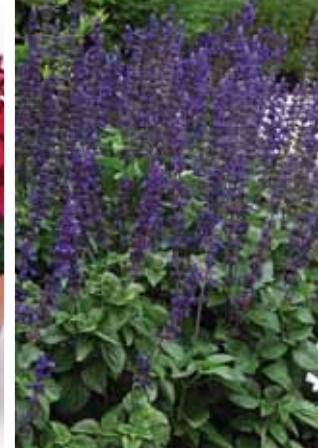
Lavender Big Blue