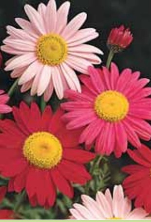
Robinsons Giant Single Mix