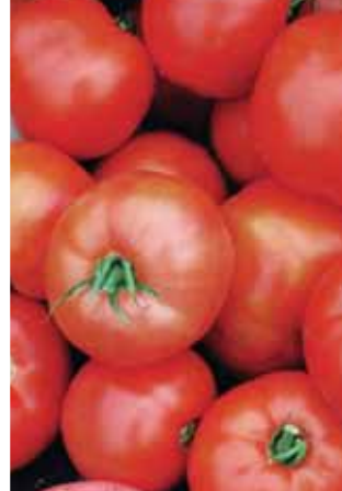
Ultra Sweet VFT