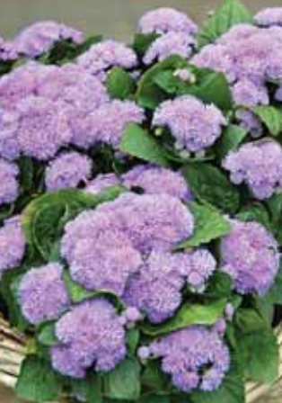
Ageratum Aloha Blue