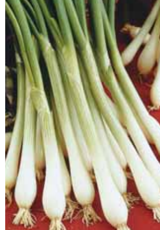
Onion White Lisbon