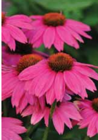
Echinacea PowWow Wild Berry