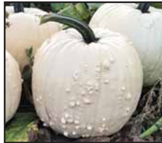
Specter Pg 45