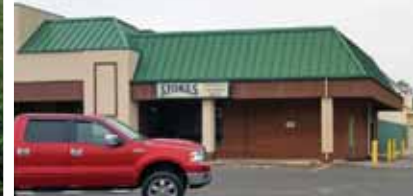
Vineland, New Jersey