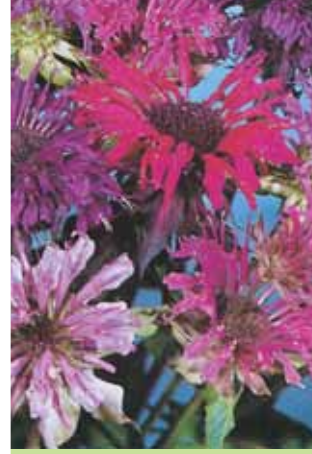
Monarda Panorama Mix