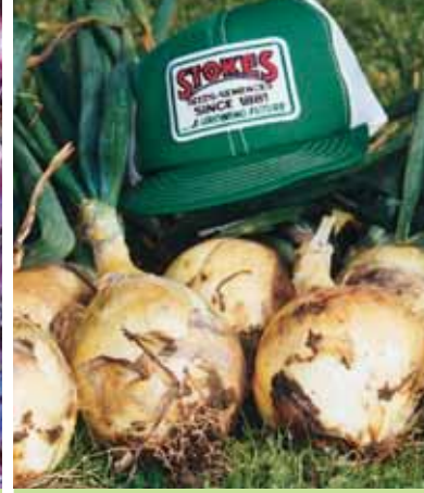
Riverside Sweet Spanish