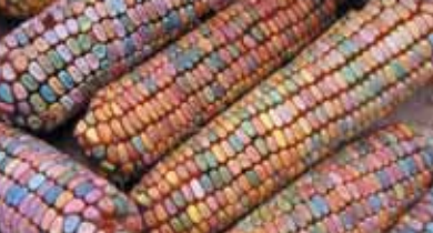
Earth Tones Dent