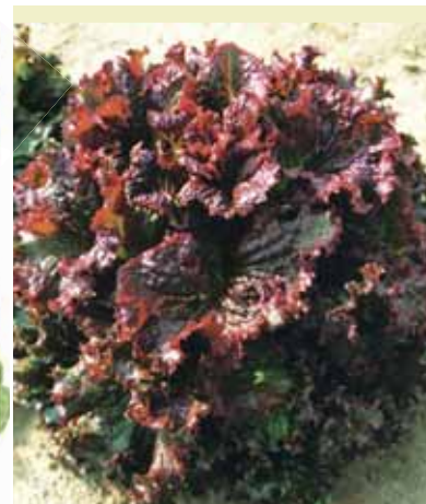
Red Express M.I.