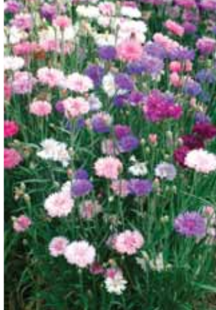
Centaurea Polka Dot Mix