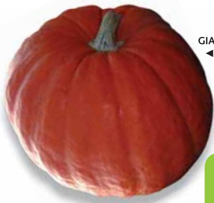
GIANT SIZED ◀ 50+ lbs