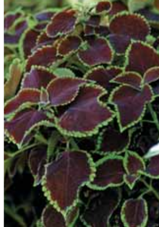
Coleus Chocolate Mint