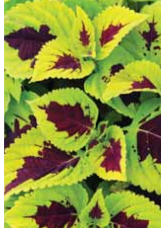
Coleus Kong Lime Sprite