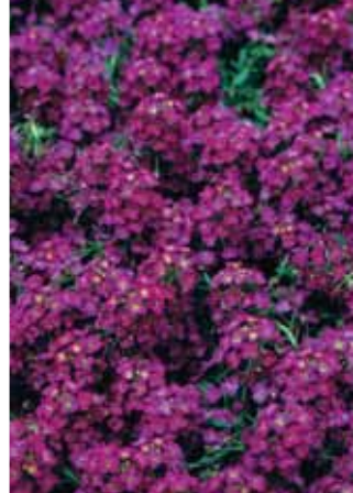
Wonderland Deep Purple