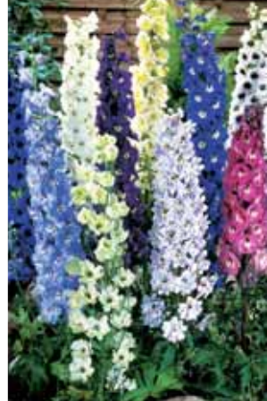
Delphinium Pacific Giants Mix