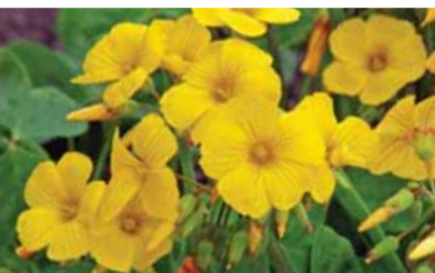
Oxalis Valdiviensis Yellow

1113 Sky Blue (4 in/10 cm) Dwarf, creeping plants spread 15 in/38 cm producing masses of 2 in/5 cm morning glory type blooms. Sky blue with contrasting large white throats. Likes dry, sunny areas. Pkt. (50 seeds) $2.50; 1/16 oz. $3.85; 1/8 oz. $5.30; 1/4 oz. $7.65; oz. $30.60.