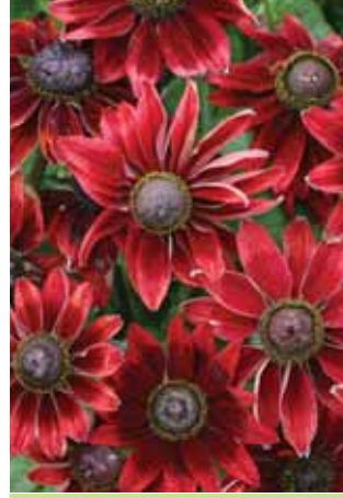
Rudbeckia Cherry Brandy