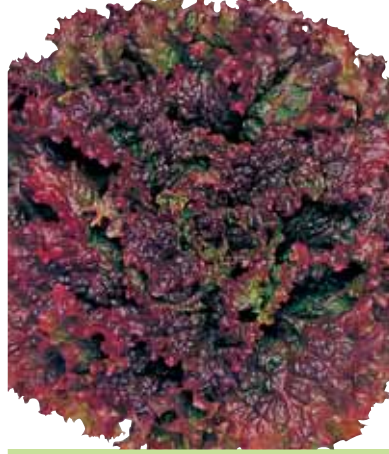
New Red Fire M.I.