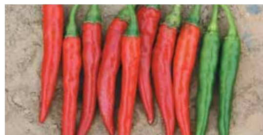
Ring of Fire

264B JALAPENO M 70 days. Dark green, 3.5 in/9 cm long, bullet shaped fruit mature red. (6000sc)