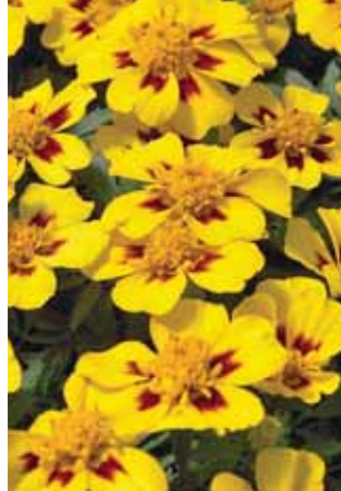
Marigold Disco Marietta