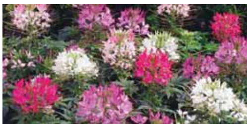
Cleome Sparkler Mix

775Z Dragon's Breath (24 in/61 cm) Glorious vibrant red foliage and plumes. Pkt. (15 seeds) $4.75; 250 seeds $74.25; 1,000 seeds & over $169.50 per M.