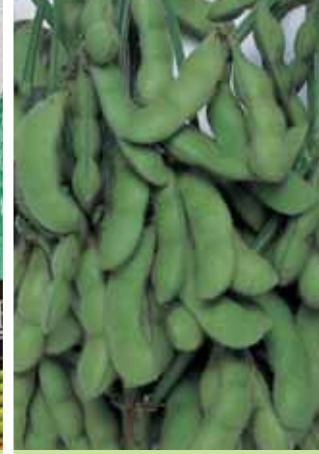
Soy Bean Beer Friend