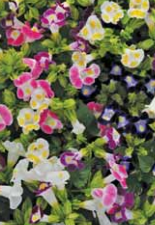
Torenia Kauai Mix