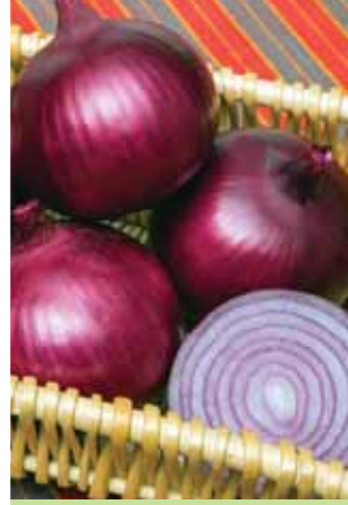
Onion - Rubillion