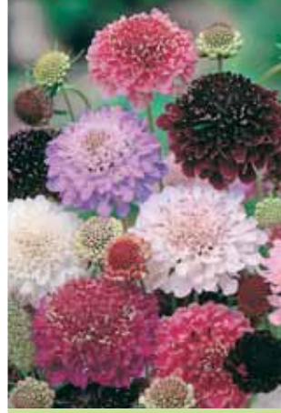
Scabiosa Finest Mix