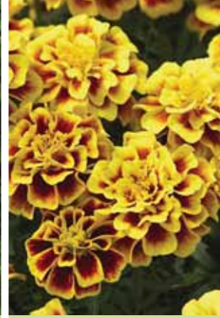
Safari Yellow Fire