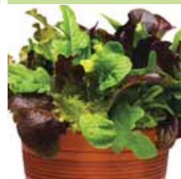
City Garden Mix