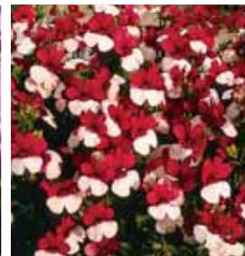
Nemesia Miniature Red & White