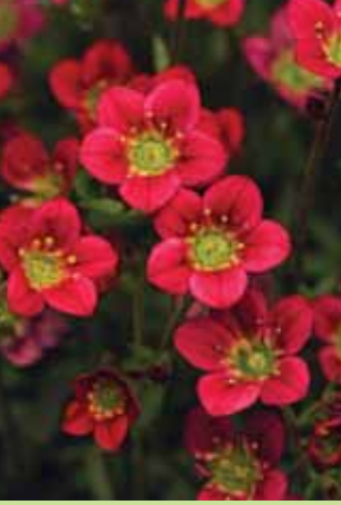
Saxifraga Rocco Red