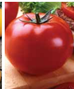
Big Beef VFNT