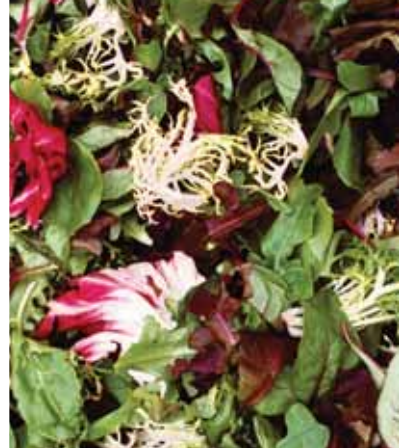
Mild Mesclun Mix