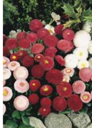
Bellis Perennis Tasso Mix