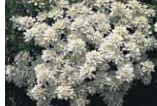
Candytuft Snow White