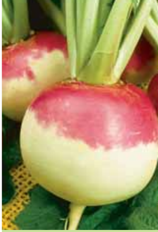
Purple Top White Globe