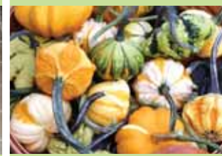
Galaxy of Stars