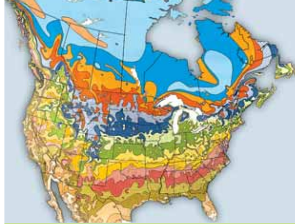
USDA Plant Hardiness Zones

Zone Map: Included in the index below are the approximate zones of hardiness for each perennial and biennial. Zone 3-6 = 3a-6b.