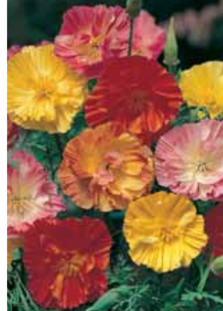
Eschscholzia Mission Bells