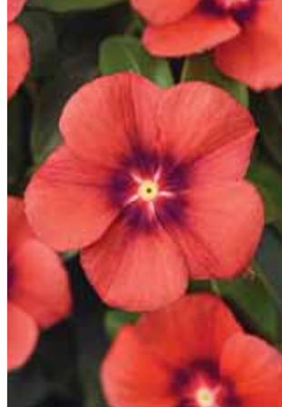
Vinca Tattoo Tangerine