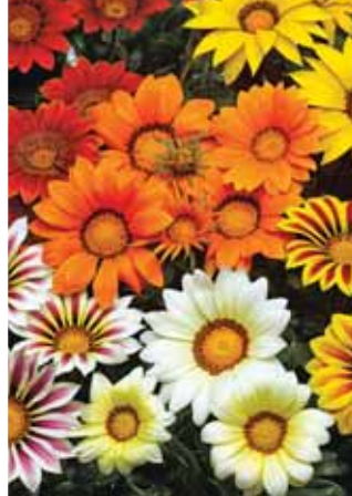
Gazania Big Kiss Mix