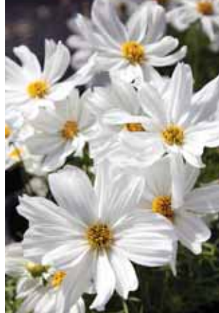
Cosmos Apollo White