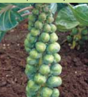
Brussels Sprouts - Confidant