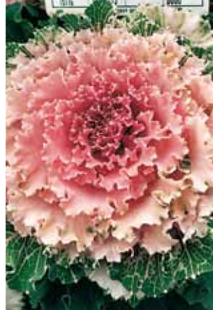
Flowering Cabbage Osaka Pink