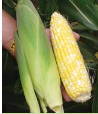
Gourmet Sweet™ EX 08767143