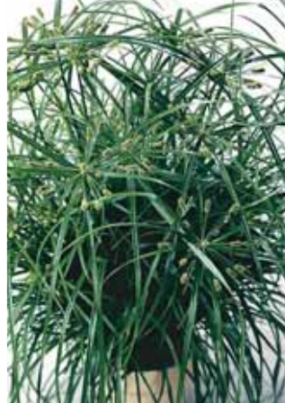
Cyperus Wild Spike