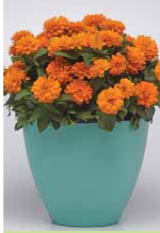
Double Zahara Bright Orange