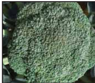
Hydra Pg 8