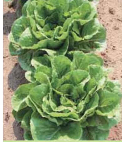
Green Towers M.I.