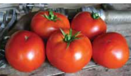
Red Bounty VFFN/TSWV/GLS

333R RED DEUCE VFF/TMV 72 days. Large 10oz/283 g. globe shaped, uniform ripening fruit mature to a deep red color and are very smooth, with excellent eating quality. Determinate plants are strong with good foliage cover, heat resistance and high yields. Stemphylium resistant.