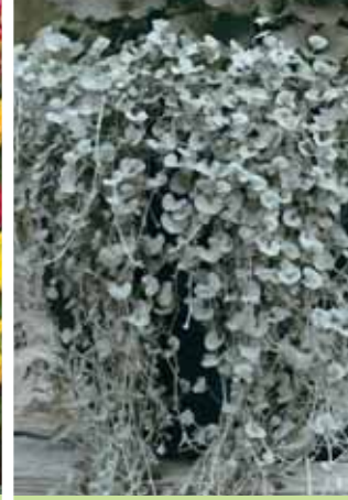
Dichondra Silver Falls