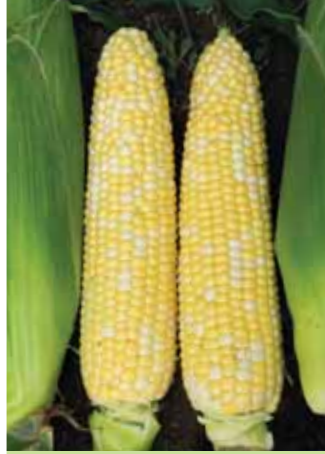
Gourmet Sweet™ Anthem XR