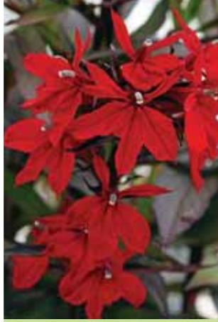
Lobelia Vulcan Red