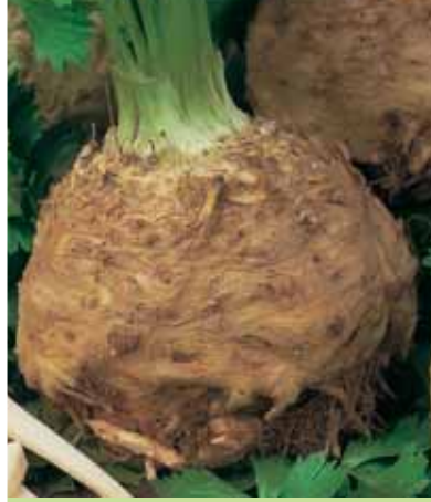
Celericac Giant Prague