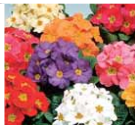
Primula Danova Mix