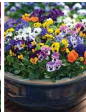
Sorbet XP Autumn Mix