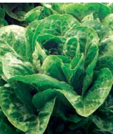
Valley Heart M.I.