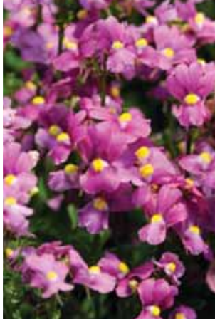
Nemesia Deep Pink