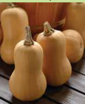
Squash - Butterbaby