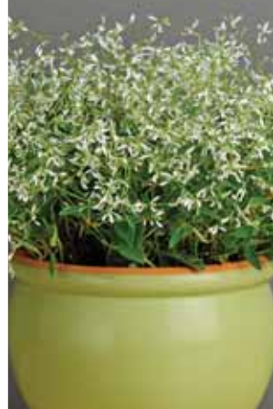
Euphorbia Glitz White