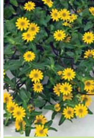
Sanvitalia Million Suns