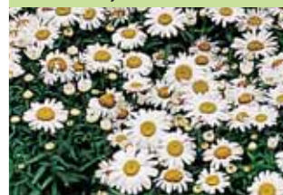
Chrysanthemum Snow Lady