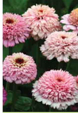
Zinnia Zinderella Lilac