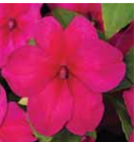
Super Elfin Violet XP

Prices for Xtreme colors & mixes: 50 seeds $4.90; 250 seeds $9.45; 1,000 seeds & over $24.89 per M.