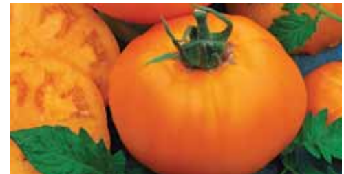
Chef's Choice Orange

373D BRANDYWINE 80 days. Favorite "good tasting heirloom variety" used by bedding plant growers for consumer sales. Huge flat globe 10-16 oz/283-454 gr pinkish red fruit with some stripes. Semi-indeterminate potato leaf plant should be staked. DF, GS