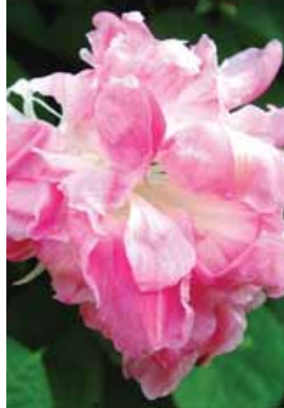
Morning Glory Split Second Double