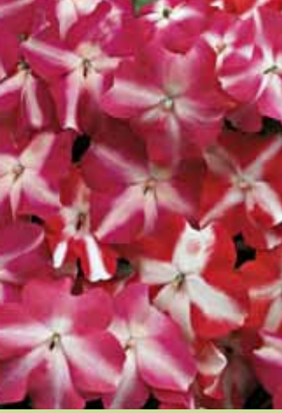
Accent Star Mix