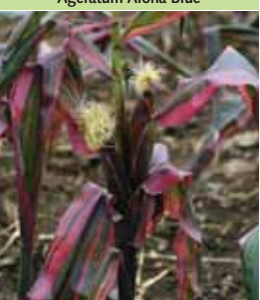
Ornamental Corn Zebra Pink