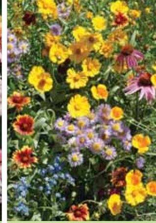
Bee Feed Wildflower Mix