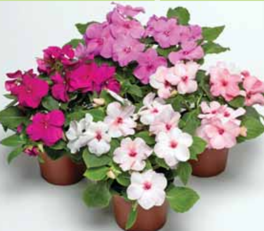
Accent Premium Pastel Mix