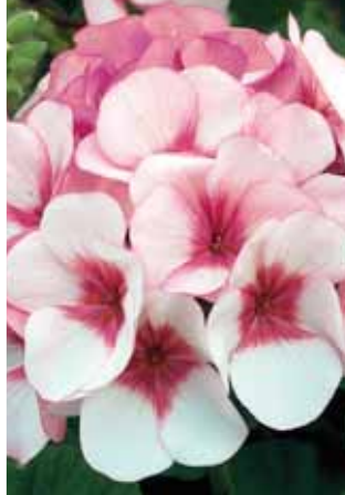
Geranium Maverick Star