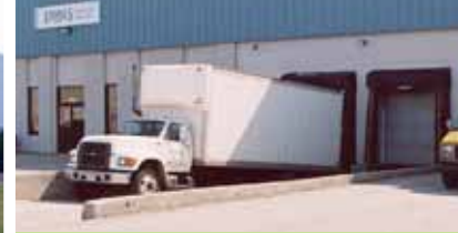
Buffalo, New York