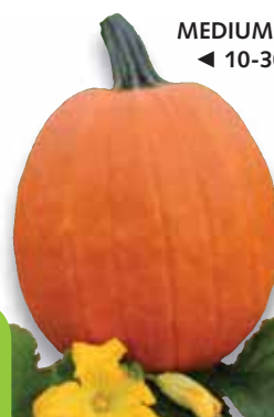
MEDIUM SIZED ◀ 10-30 lbs