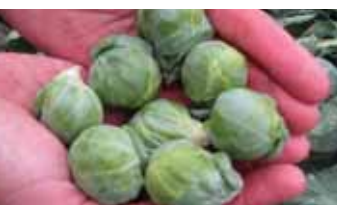
Brussels Sprouts Hestia

42C GOLDEN 65 days. Bright golden orange round novelty beet with refined shoulder, very smooth skin and deep golden interior color. Leaves are light green with attractive yellow baby stems that turn green at maturity. Retains mild sweet flavor and color when cooked (does not bleed interior color like red beets when cooked). Both tops and beets are delicious! Use as a baby beet or regular size for fresh market. Stems are attractive in salads.