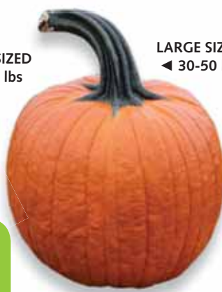
LARGE SIZED ◀ 30-50 lbs