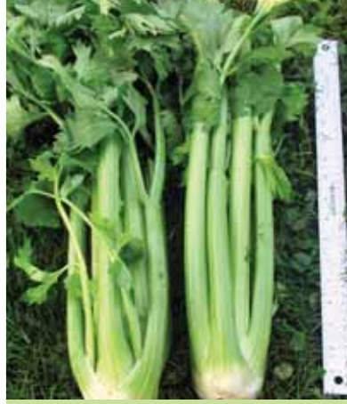
Celery TZ 6200