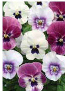
Sorbet XP Raspberry Sundae Mix

Prices for Cool Wave colors & mix: Pkt. (20 seeds) $7.50; 100 seeds $34.85; 1,000 seeds & over $242.90 per M.