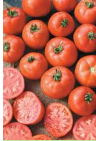
Mountain Fresh Plus VFFN