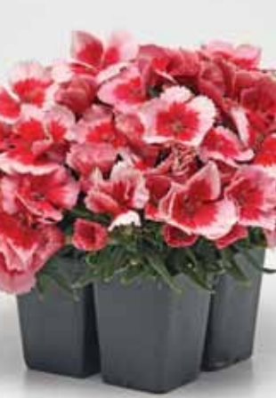
Dianthus Corona Strawberry