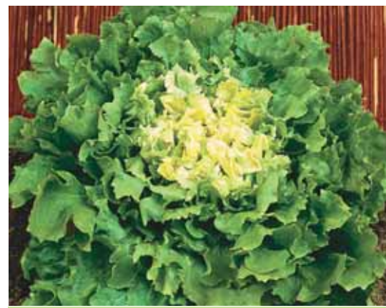
Escarole Full Heart Batavian