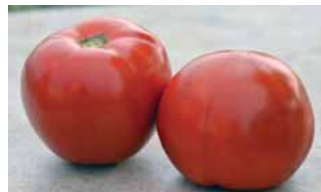
Tomato - Roadster

TOMATO - Roadster: 70 days. Early maturing 8-12 oz/227-340 gr scarlet red, deep globe shaped fruit. Very firm and smooth shouldered with superior flavor. Concentrated set, high yield potential.