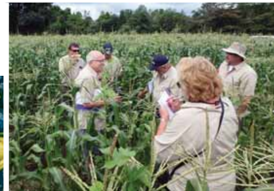
Stokes Corn Trials