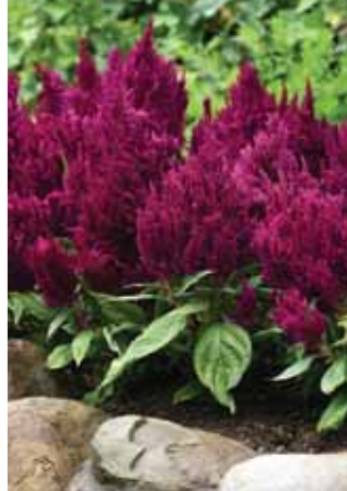
Celosia First Flame Purple