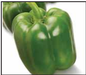
SV3964PB Pg 40