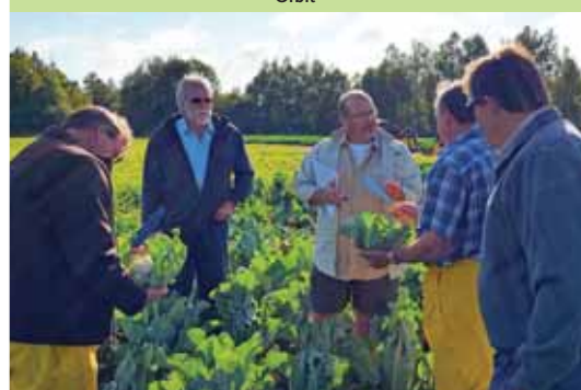
Sales Team Judging Cauliflower