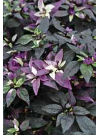
Capsicum Purple Flash