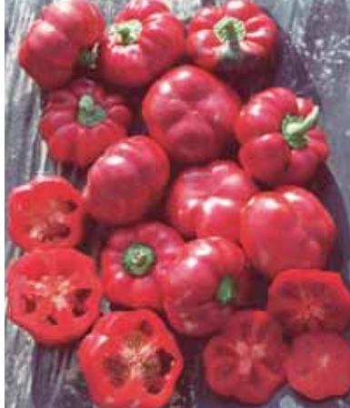
Super Red Pimento