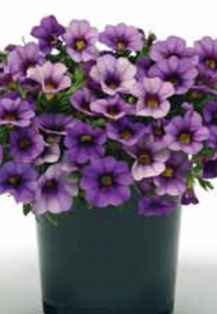
Calibrachoa Kabloom Denim