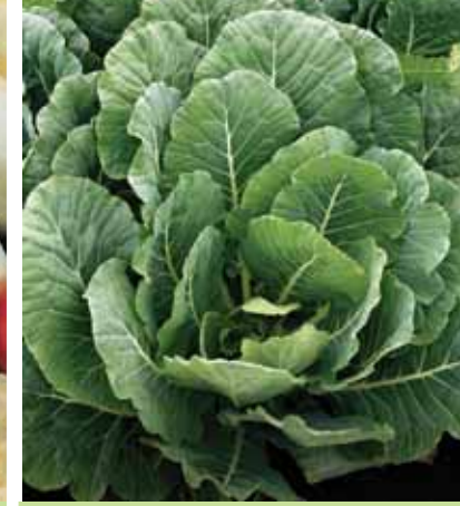
Collards Top Bunch 2.0