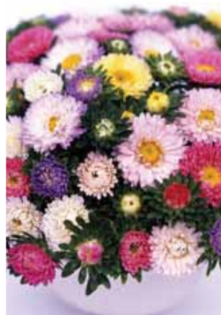
Aster Matsumoto Mix