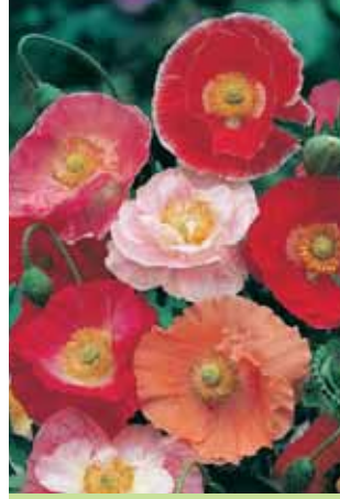
Poppy Shirley Mix