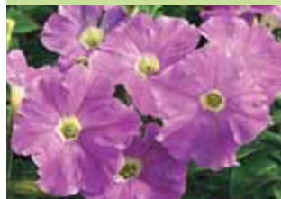
Picobella Light Lavender