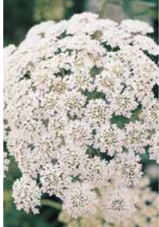
Ammi Majus Queen of Africa