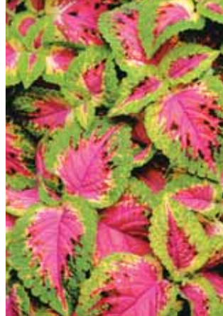
Coleus Premium Sun Watermelon