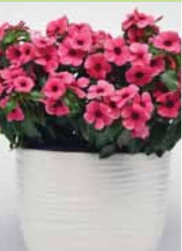
Vinca Tattoo Raspberry