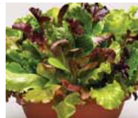
Summer Picnic Mix