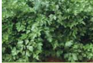
Parsley Gigante 'Italian'