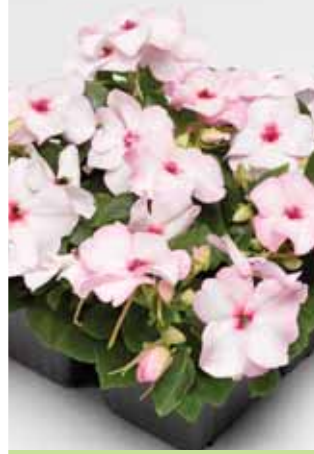
Xtreme Bright Eye