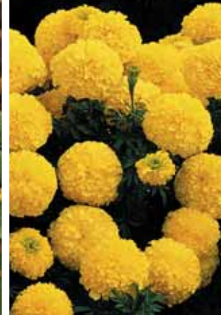
Inca II Primrose