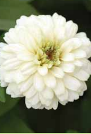
Zinnia Double Zahara White