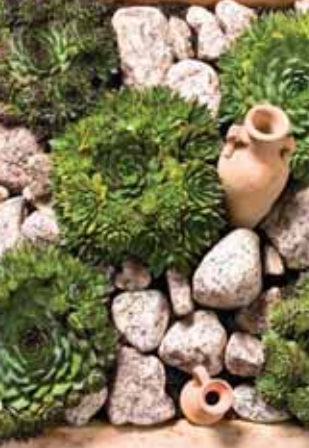
Succulents Hens and Chickens