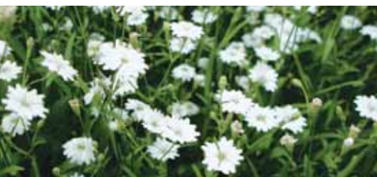
Silene Starry Dreams

872 Wee Willie (8 in/20 cm) Standard miniature, blooms. Good for pots. Crop time 6-8 weeks. Pkt. (30 seeds) $2.25; 1/16 oz. $4.20; 1/4 oz. $7.75; oz. $21.65.