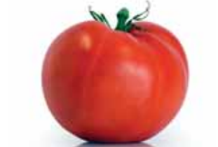
Better Boy VFN