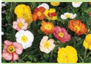
Poppy Champagne Bubbles Mix