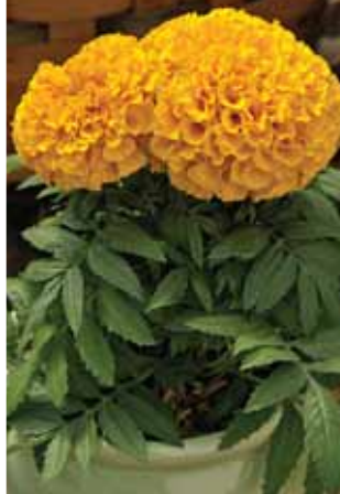
Proud Mari Gold