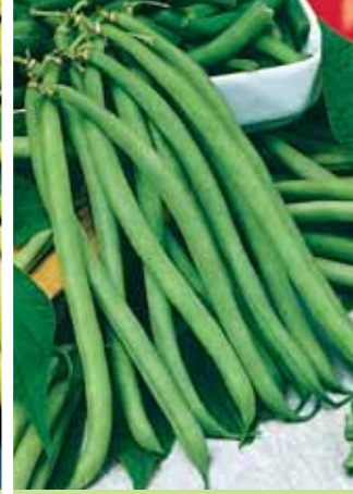
Pole Bean Blue Lake