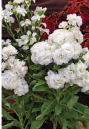
Stocks Mime White