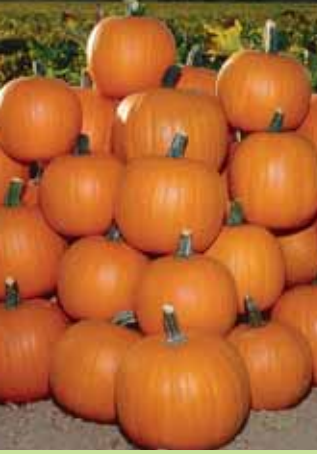
Jack of All Trades