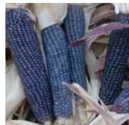
Shades of Blue

392Q CHERRY BERRY 98 days. Larger, longer ears than the original. Husk colors are a blend of beige, burgundy and red. Stalks average 5-6 ft/1.5-2 m in height and have upright attractive red streaked leaves. Yields are fantastic, providing a good pack out. Plant in blocks of 4 rows for good pollination in late spring. Fertilize well.