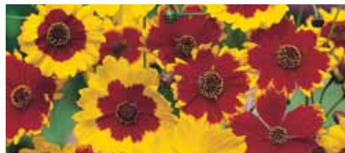
Calliopsis Finest Mix

820 Mix (24 in/61 cm) A choice mixture, shades of salmon, pink, mauve, carmine, white and red. Plants flower from seed in 90 days. Pkt. (1,000 seeds) $2.25; 1/4 oz. $3.10; oz. $6.95.