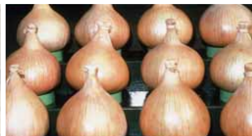
Ailsa Craig Exhibition