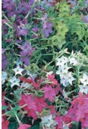
Nicotiana Perfume Mix