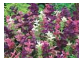
Horminum Tricolor Mix

1284A Strata (14 in/36 cm) Bicolor blue and white spikes. Each blue florette is highlighted by a white calyx. Novel cut flower. AAS and Fleuroselect Winner. Pkt. (25 seeds) $2.50; 1/32 oz. $9.50; 1/16 oz. $17.30; 1/8 oz. $30.90.