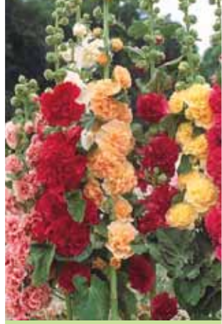
Hollyhock Chaters Triumph Mix