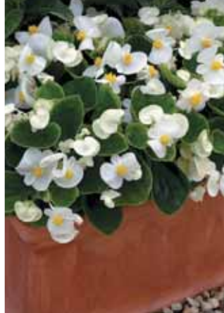
Bada Bing White