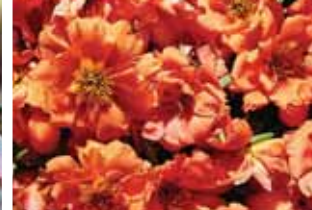
Portulaca Sundial Orange