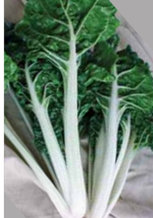
Swiss Chard Silverado