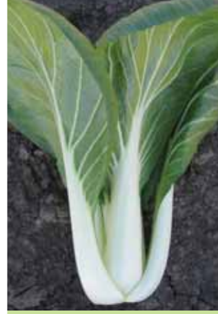
Green Fortune Choi