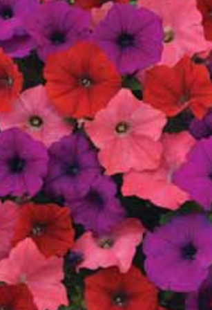
Easy Wave South Beach Mix