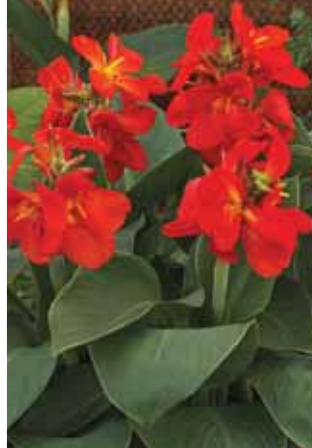
Canna South Pacific Scarlet