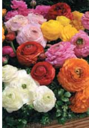
Ranunculus Magic Mix