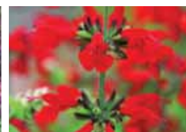
Summer Jewel Red