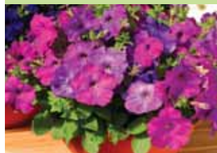
Hurrah Lavender Tie-Dye