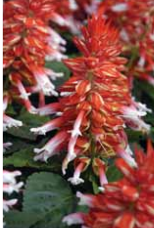
Amore Scarlet Bicolor