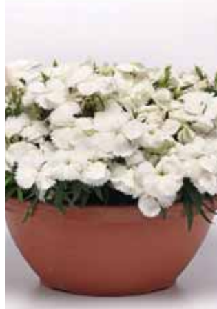
Dianthus Corona White