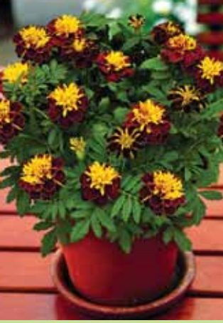
Super Hero Spry