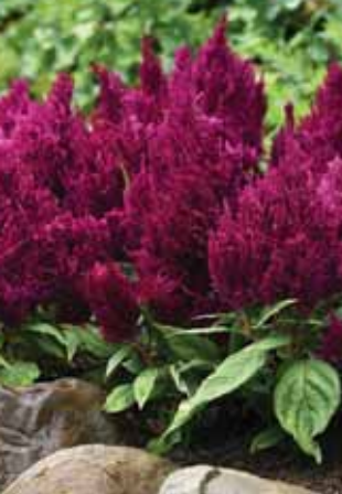
Celosia First Flame Purple