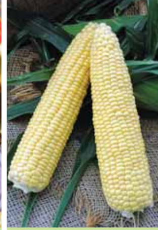
Corn - Vista XR