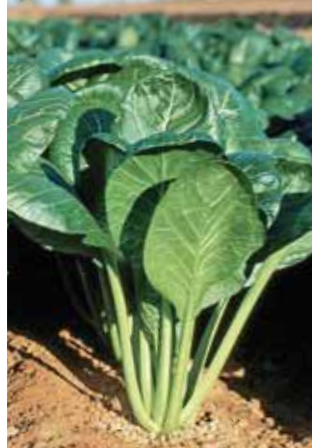
Mustard Green Savanna