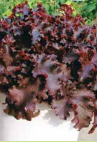
Heuchera Melting Fire