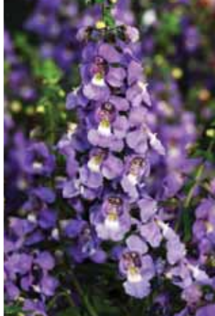
Angelonia Serena Blue