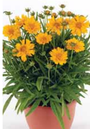
Coreopsis Double the Sun