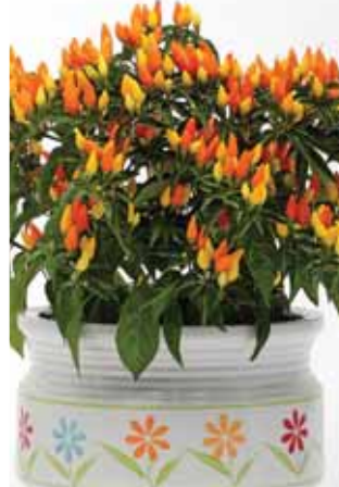
Capsicum Sedona Sun