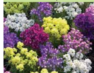
Linaria Fantasista Mix