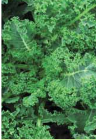
Kale Vates Blue Curled