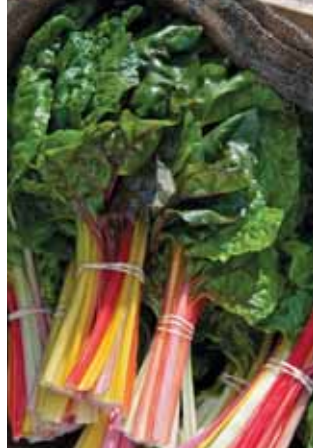
Swiss Chard Bright Lights