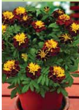
Marigold Super Hero Spry