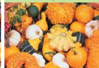
Small Gourds Mix