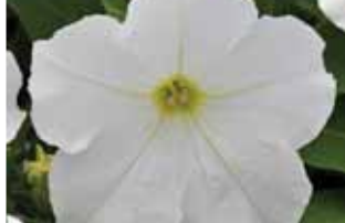
EZ Rider White