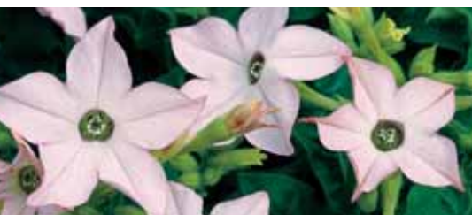
Nicotiana Saratoga Appleblossom

Prices for Whirlybird colors & mix: Pkt. (25 seeds) $2.95; oz. $21.65; 1/4 lb. $58.10; 1/2 lb. $116.20; lb. & over $232.40 per lb.