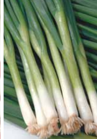
Onion Green Banner