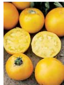
Lemon Boy VFN

V - Verticillium 1 PhR - Late Blight Phytoph. FF - Fusarium 1, 2, 3 Aal - Alternaria Stem Canker TMV - Tobacco Mosaic N - Nematodes GLS - Grey Leaf Spot TYLCV - Yellow Leaf Curl TSWV - Tomato Spotted Wilt Virus