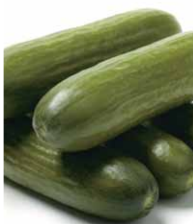
Mini Cucumber Jewell