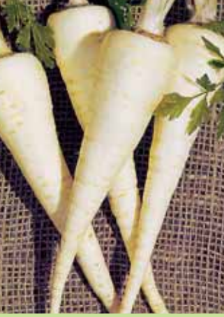
Parsnip Hamburg Half Long