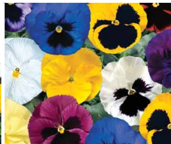
Delta Premium Mix

1145 Exhibition Mix Formula blend from the most popular European grown plain and blotched types. Pkt. (125 seeds) $2.75; 1/16 oz. $12.55; 1/8 oz. $20.60; 1/2 oz. $64.60.