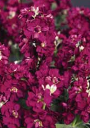
Stocks Vintage Burgundy