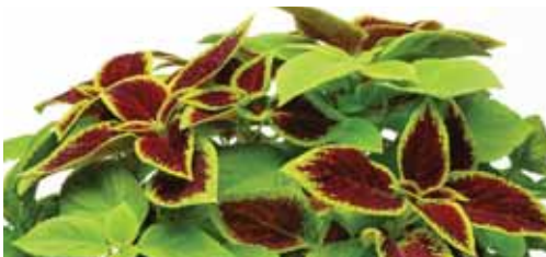
Fuseables Under the Sun

Prices of the above two: Pkt. (10 pellets) $5.95; 100 pellets $38.85; 1,000 pellets & over $250.50 per M.