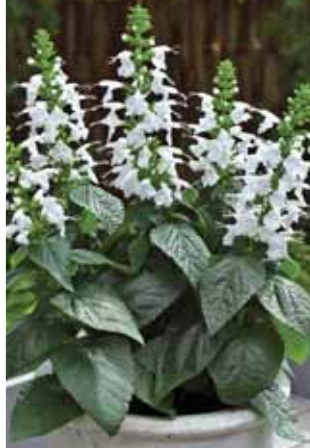
Summer Jewel White