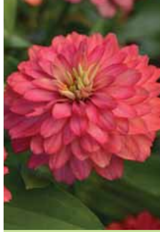
Zinnia Double Zahara Salmon