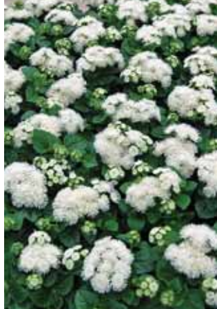
Ageratum Aloha White