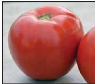
Roadster Pg 52