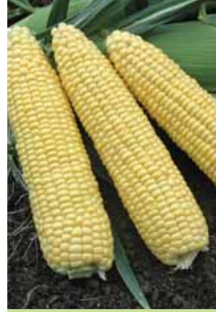
Gourmet Sweet™ Takeoff