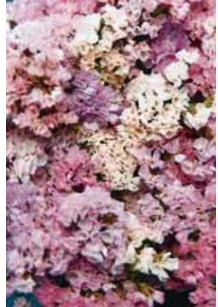
Statice Pastel Shades