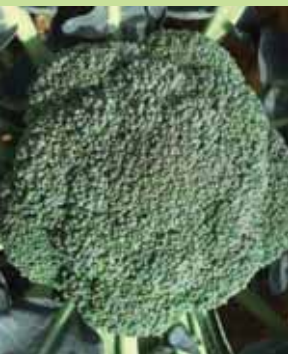
Broccoli - Hydra