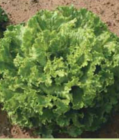
Green Bay M.I.