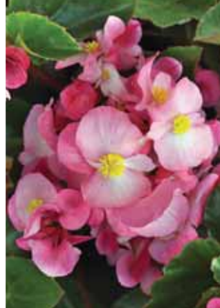
Megawatt Pink Green Leaf