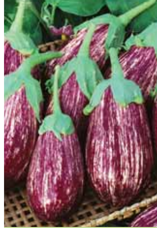
Shooting Stars Striped