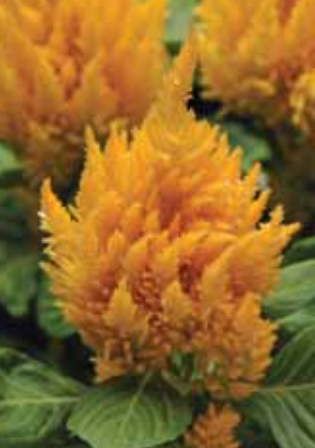
Celosia First Flame Yellow