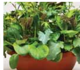
Wonder Wok Mix

Simply Salad Prices: Pkt. (25 pellets) $6.95; 250 pellets $48.55; 1,000 pellets @ $155.25; 10,000 pellets @ $117.45 per M; 50,000 pellets @ $103.95 per M.