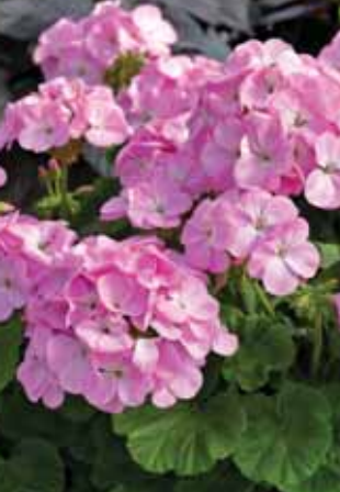
Geranium Multibloom Lavender