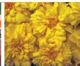
Zenith Lemon Yellow