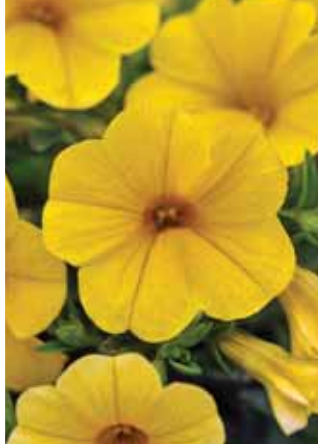
Calibrachoa Kabloom Yellow