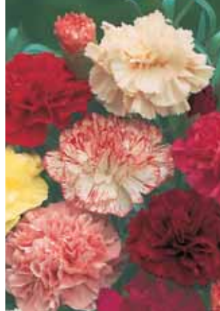
Carnation Enfant de Nice Blend