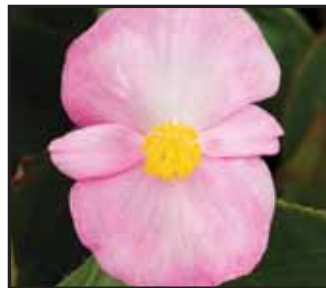
TopHat Pink Begonia Pg 61