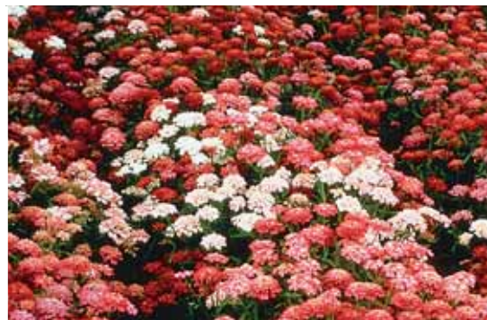
Candytuft Flash Mix

839 Firmament (16 in/41 cm) Bright rich blue, dwarf plant. AAS Winner. Pkt. (150 seeds) $2.50; 1/4 oz. $4.70; oz. $8.70.