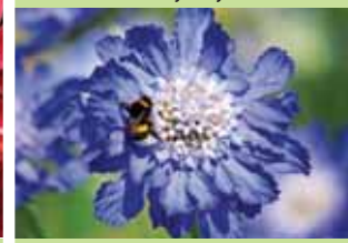
Scabiosa Fama Deep Blue