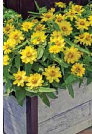
Zinnia Profusion Lemon