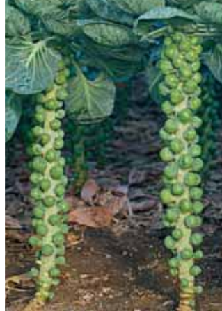
Brussels Sprouts Cobus