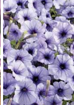
Celebrity Blue Ice