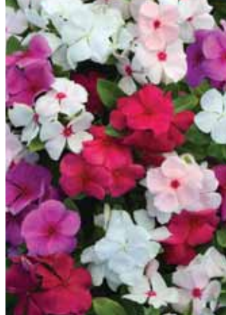
Vinca Valiant Mix