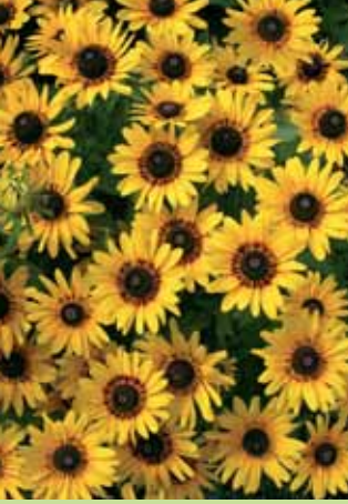
Rudbeckia Denver Daisy