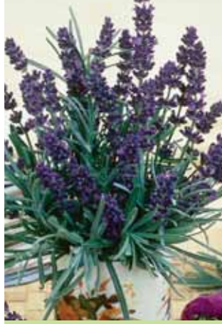
Lavender Munstead Strain