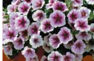
Opera Supreme Raspberry Ice