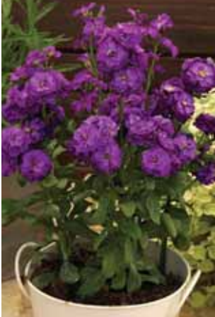
Stocks Mime Blue