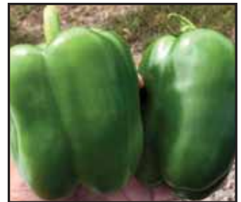
Skyhawk Pg 40