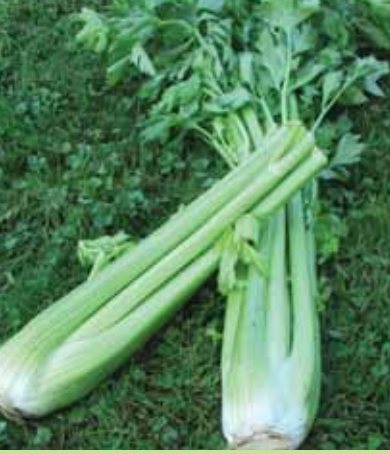
Celery TZ Titus