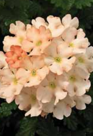
Verbena Tuscany Peach