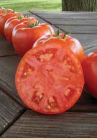
Mountain Merit VFFF/TSWV