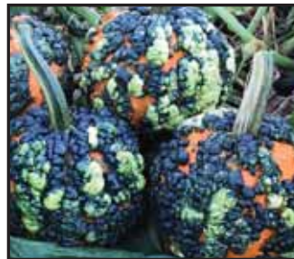
Miniwarts Pg 46