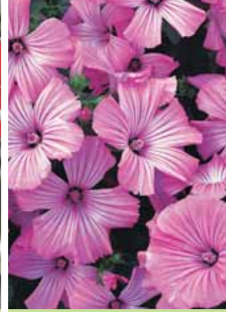
Lavatera Novella Rose