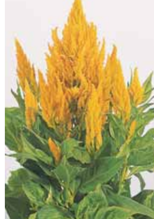
Celosia Fresh Look Yellow