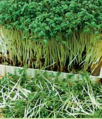
Cress Fine Curled