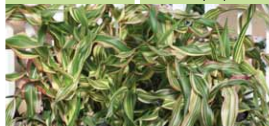
Field of Dreams