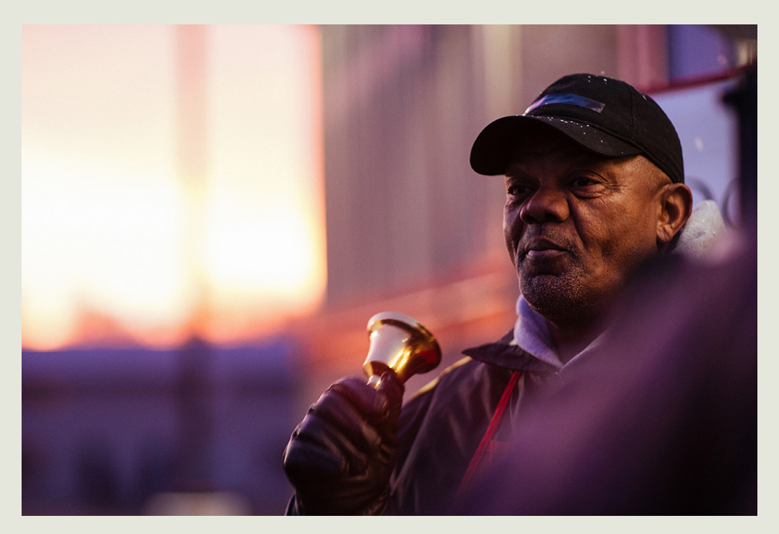
"People are hungry, people are going without a place to sleep at night, they are out in the cold during the winter months, and we have a responsibility to help them get back on their feet."

Within 10 years, the kettle idea spread from the West Coast to the East Coast, and soon after that, all across the world – to Korea, Japan, Chile, and many European countries. Over time, the addition of a volunteer bell ringer at each kettle helped garner attention for the lifesaving work of The Salvation Army.