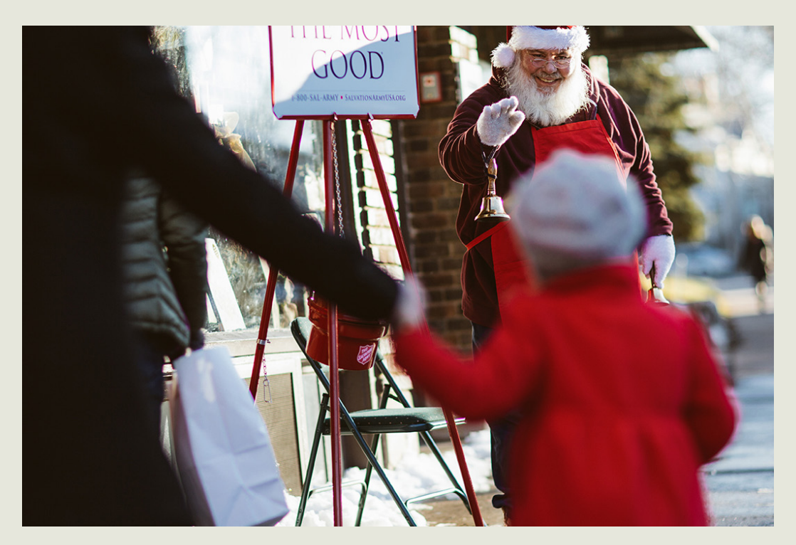
"We welcome anyone and everyone who is willing to ring that bell at the kettle to help us through our bell-ringing season to fund our initiatives and programs throughout the year."

More than a century after their inception, the kettles and bells have become an integral part of the overall holiday vernacular. If you ask anyone what comes to mind when they hear the words "The Salvation Army" during the holidays, they'll say one of two things: "bell ringers" or "red kettles." Even the famous Christmas carol "Silver Bells" was inspired by the sound of volunteers ringing Salvation Army bells around Christmastime.