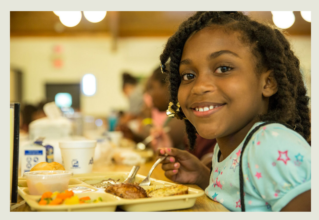
"Every little dollar that someone puts in is going to be put to good use."

In addition to providing assistance throughout the holiday season, donations helped The Salvation Army provide more than 10 million nights of shelter; over 55 million meals; and funding for substance abuse recovery, after-school programs, and emergency shelter for children and families in need year-round.