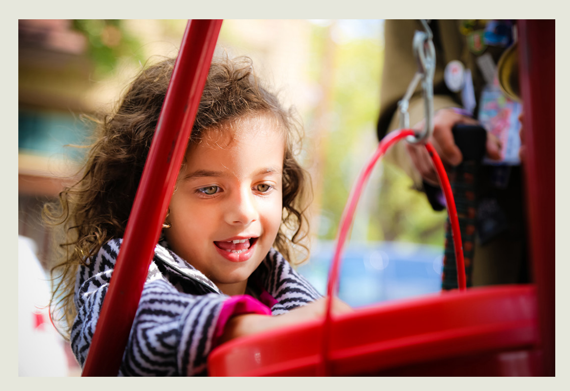
"It's part of Christmas. It's part of the community, it's part of spreading the gospel."

In its milestone 125th year, The Red Kettle Campaign of 2015 set a new national fundraising record. Some 25,000 bell ringers of all ages, ethnicities, and backgrounds – along with numerous corporate partners – raised $149.6 million for the campaign, with all money going to work directly in the community where it was raised.