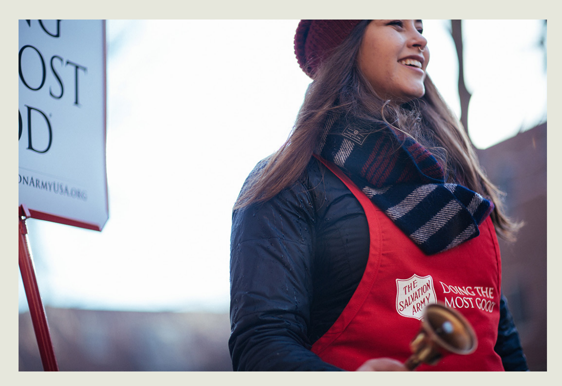
"If you're wondering why someone is ringing the bell, it's because they want to make a difference."

With a bell as our battle cry, The Salvation Army Red Kettles continue to fund the fight to deliver spiritual light and love to almost 25 million people each year – people who might otherwise be forgotten, but shall never go unserved.