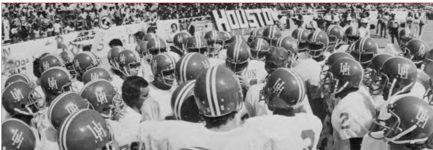
Houston, the new kids on the block in the Southwest Conference, defeated Baylor, 23-5, in its inaugural conference game on Sept. 11, 1976, from Waco, Texas.