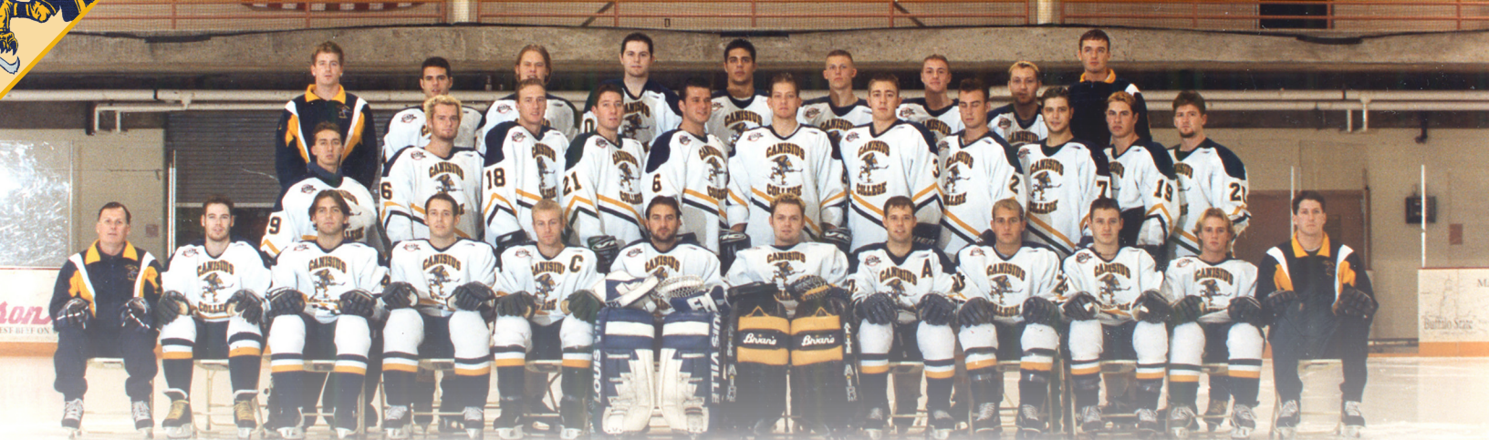
The 1999-2000 Griffis matched a school record with 21 victories.