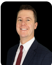
HC PARKER BURGESS