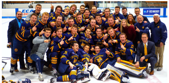
2019 ECAC Hockey Cleary Cup Champions