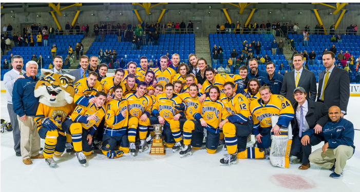
2015 ECAC Hockey Cleary Cup Champions