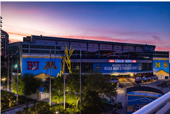
The sun rises over Amalie Arena in Tampa, Fla., site of the 2023 NCAA Men's Division I Frozen Four.