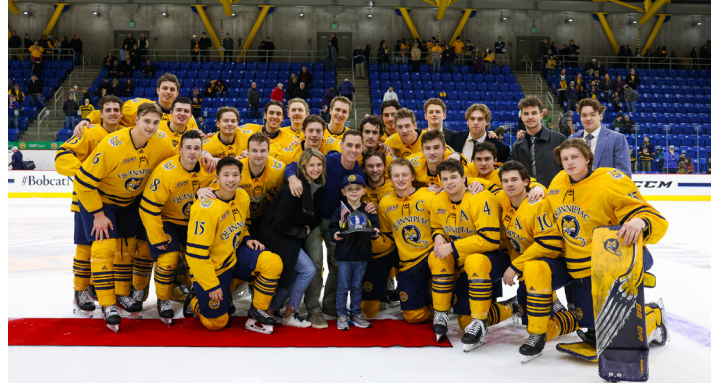
2023 Heroes' Hat Winners