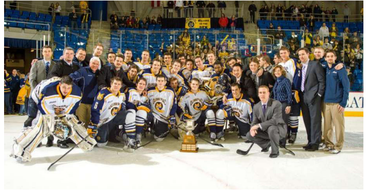
2013 ECAC Hockey Cleary Cup Champions