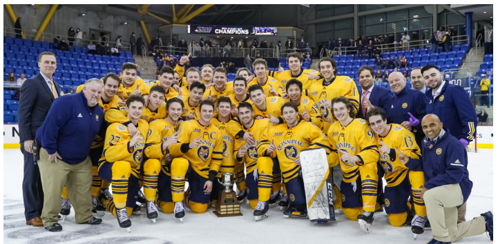
2022 ECAC Hockey Cleary Cup Champions