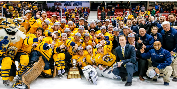
2016 ECAC Hockey Whitelaw Cup Champions