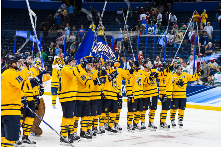
Quinnipiac players offer a stick salute to the fans after a win vs. Boston College to advance to the national championship.