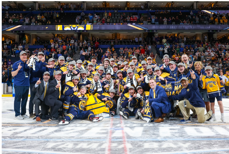
The official championship photo of the 2023 national champion Quinnipiac Bobcats