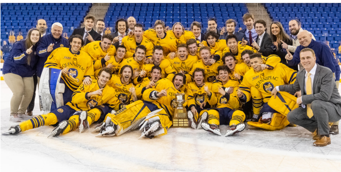
2021 ECAC Hockey Cleary Cup Champions