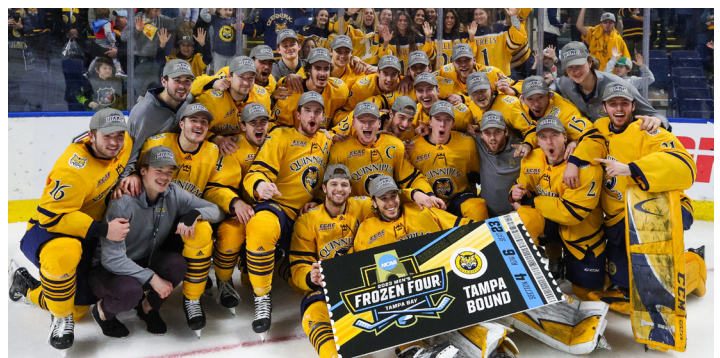
2023 NCAA Bridgeport Regional Champions