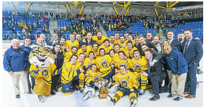
2016 ECAC Hockey Cleary Cup Champions