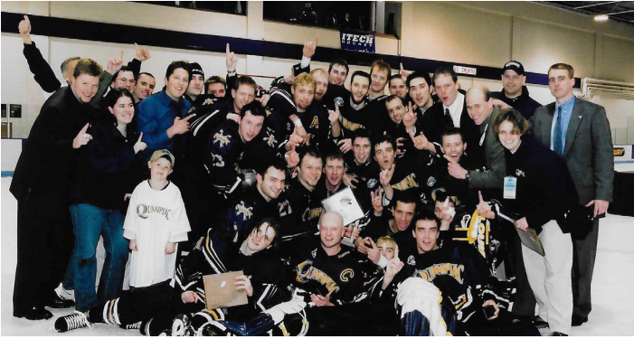
2002 MAAC Tournament Champions