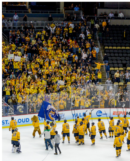
Quinnipiac celebrates a 4-1 win to advance to its 1st national championship.