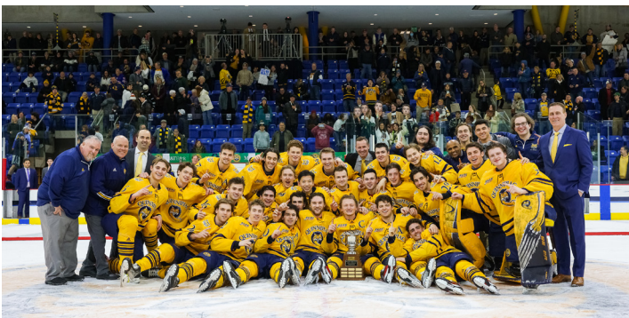
2023 ECAC Hockey Cleary Cup Champions