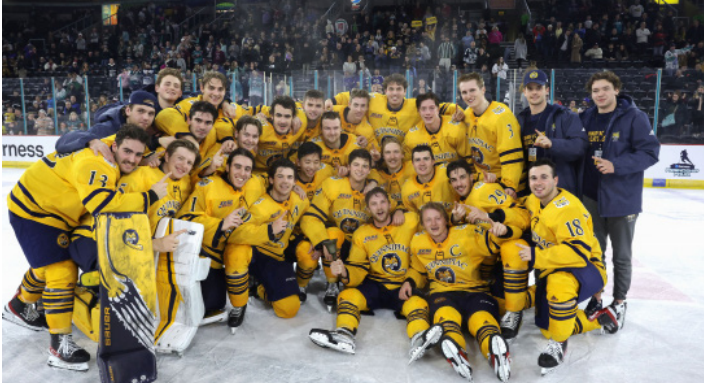
2023 Friendship Four Champions