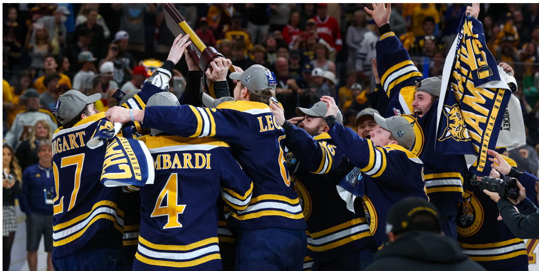
2023 NCAA National Champions