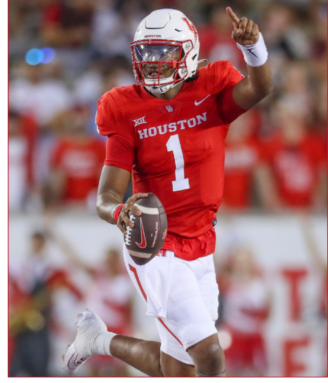
Smith is one eight quarterbacks and the lone Big 12 signal caller to complete 30 passes alongside a 75% completion rate and no interceptions in a game, doing so last Saturday vs. Sam Houston (31 completions, 77.5% and no INTs).