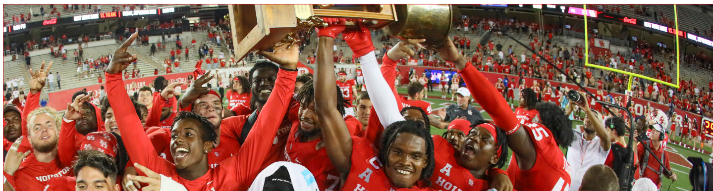
Houston used a late rally to secure its seventh consecutive victory over Rice, defeating the Owls, 34-27, a season ago inside TDECU Stadium.