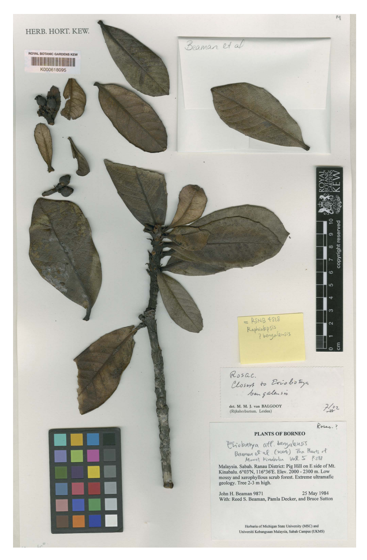
Figure 2 – The type collection of Eriobotrya balgooyi at Kew.