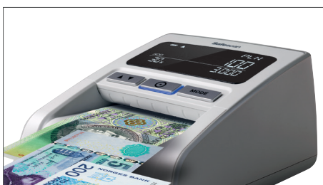
Verifies up to 9 currencies