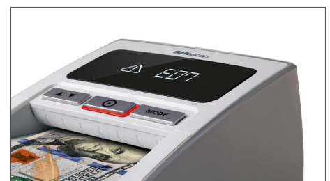
Suspected banknote alarm with visual and audio alert