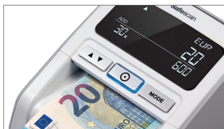
Shows value and total amount of the scanned banknotes