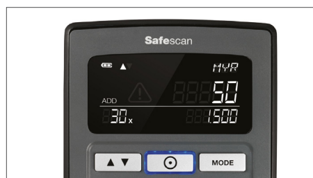
Shows value and total amount of the scanned banknotes