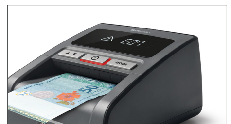
Suspected banknote alarm with visual and audio alert