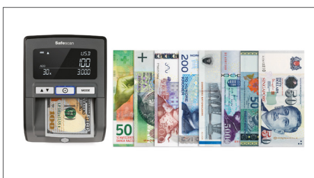
Verifies up to 9 currencies