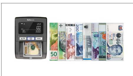
Verifies up to 9 currencies