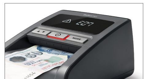
Suspected banknote alarm with visual and audio alert