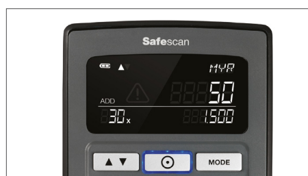
Shows value and total amount of the scanned banknotes