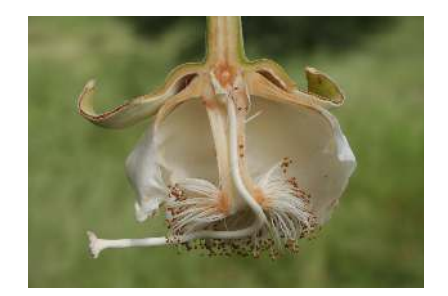
Marco Schmidt - CC-BY-SA-3.0 http://creativecommons.org/licenses/by-