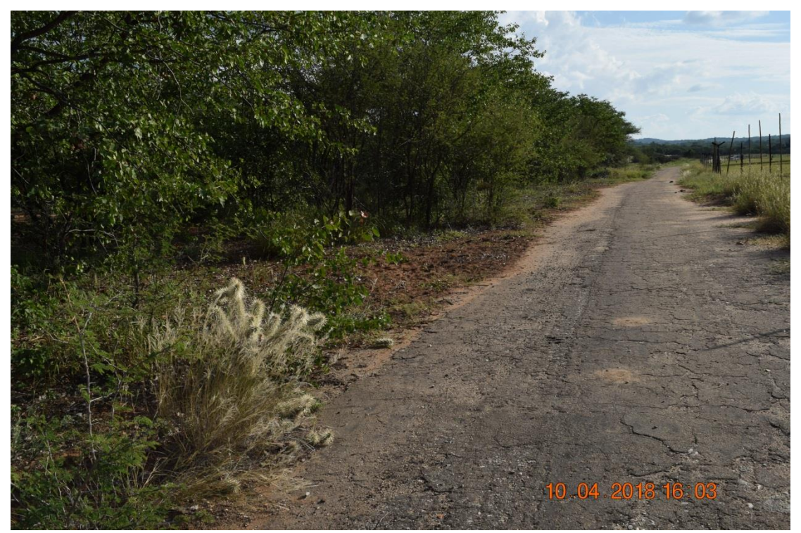
Figure 5: View of vegetation along military patrol road. This area will also be cleared.