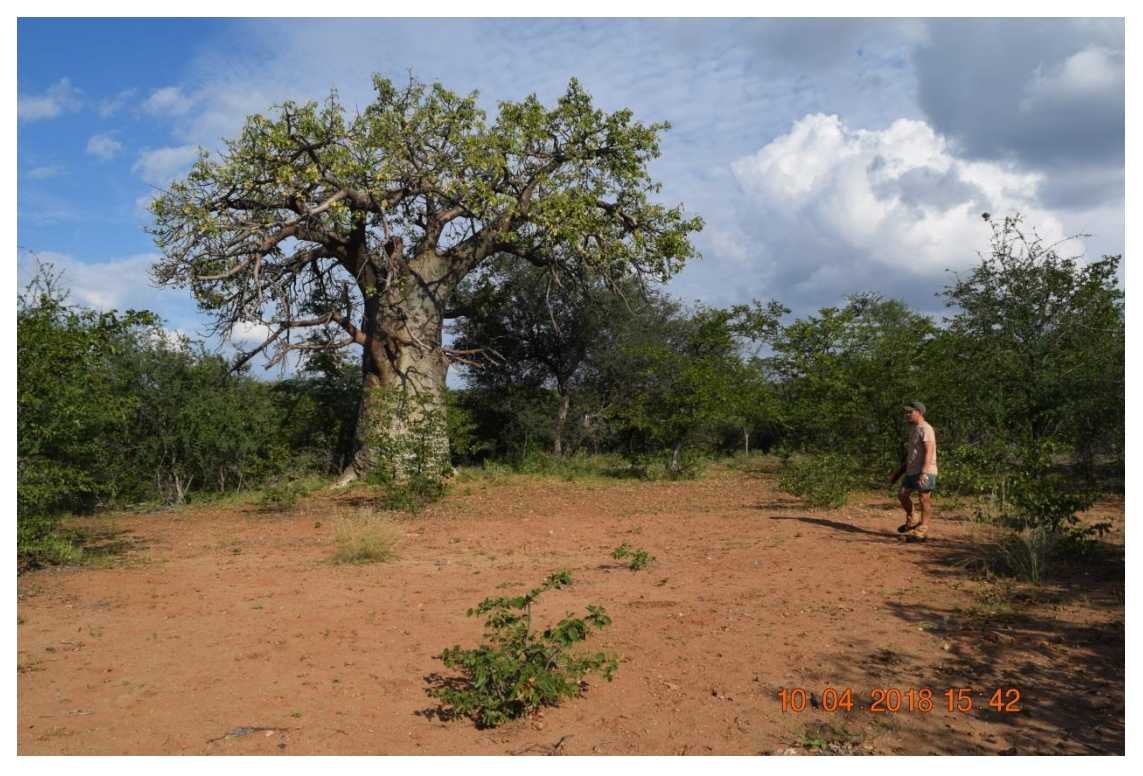
Figure 3: View of undisturbed area Sub-area A: Watercourse

The un-named watercourse enters the project area from the south after crossing underneath the gravel district road. Open water was found not found to be common in summer months along the watercourse. This is the smallest