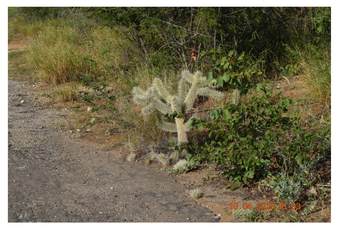
Figure 7: Invader specie