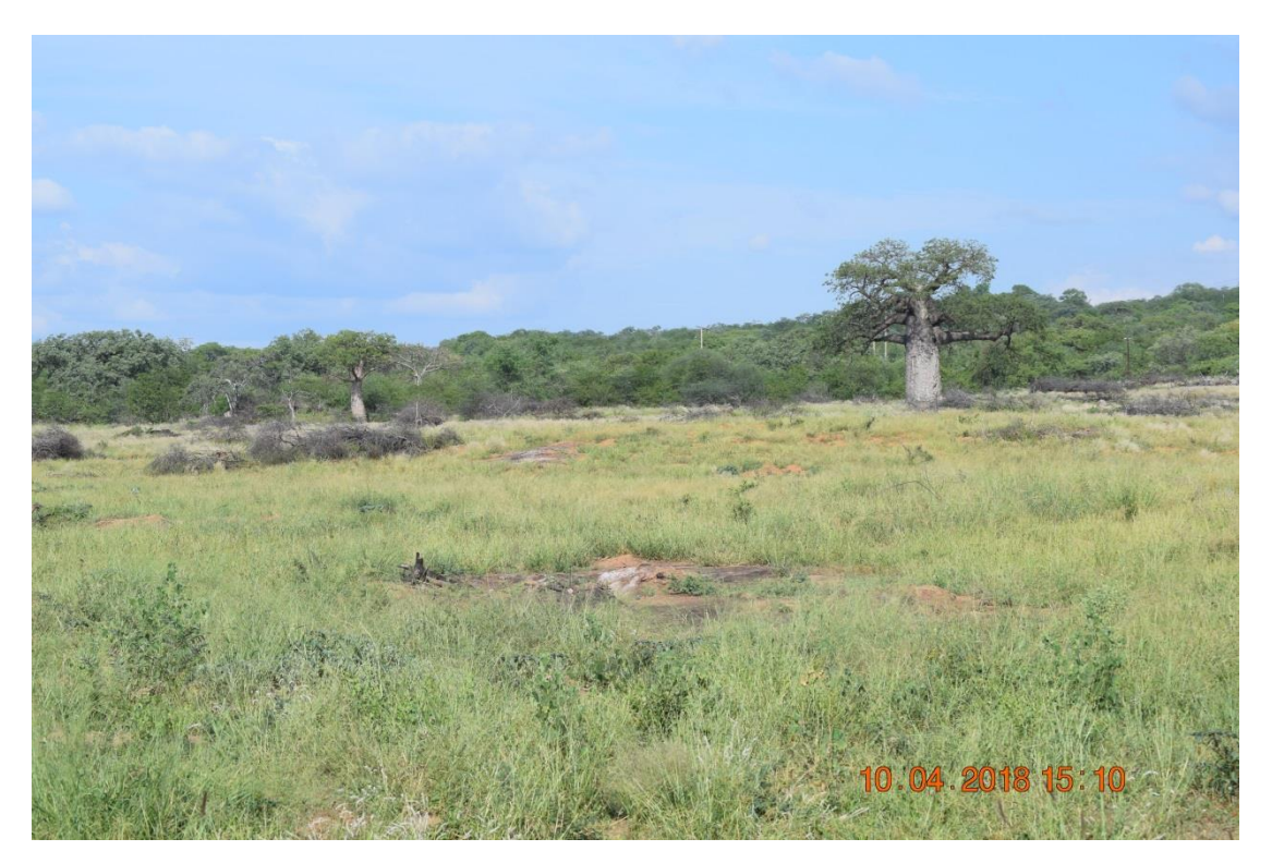
Figure 2: View of vegetation removed The ecological structure are discussed below