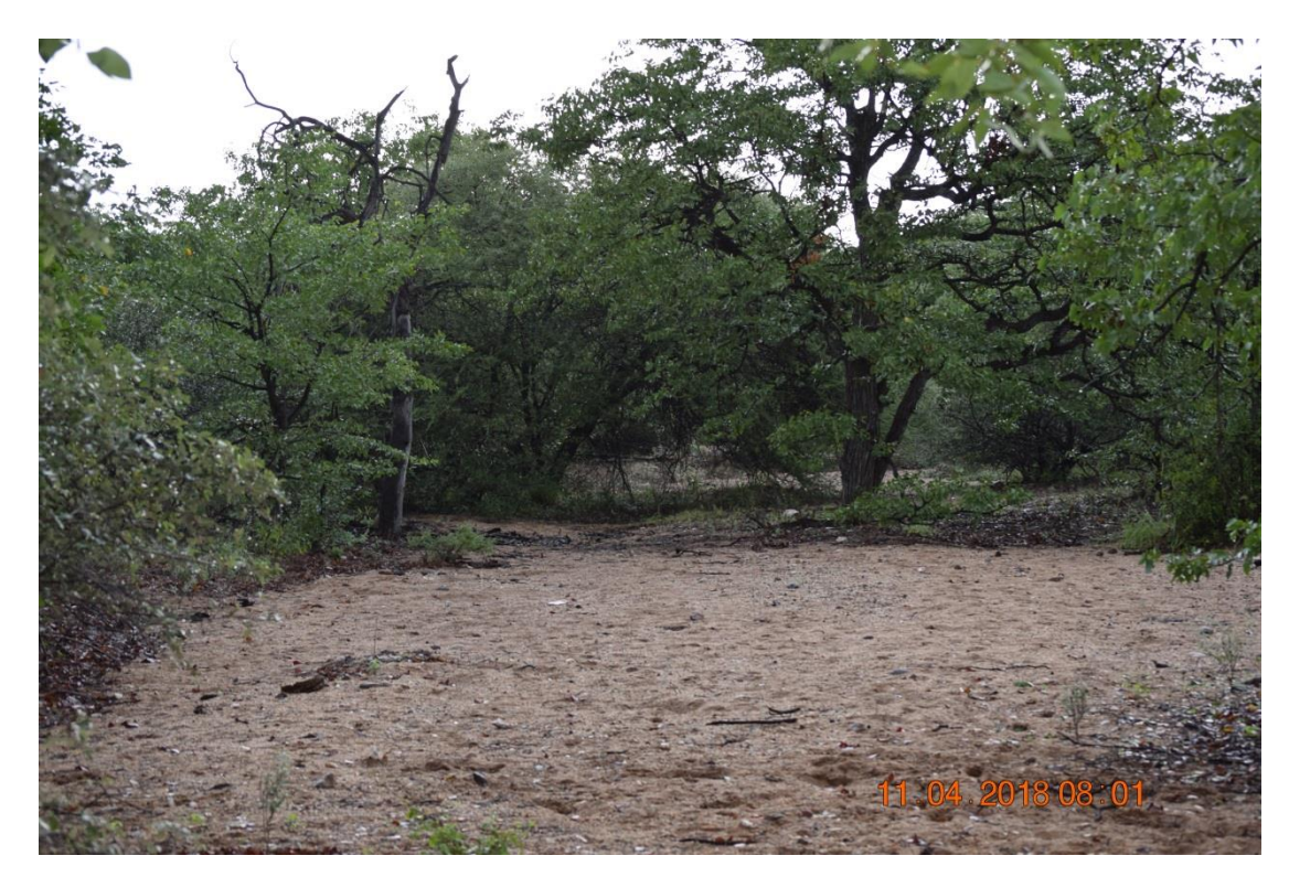
Figure 8: View of watercourse with stable vegetation

The closer to the Limpopo river the vegetation structure does not alters to larger and denser vegetation associated where perennial water bodies are found. The integrity of the vegetation on the banks has to be preserved by the 32 meter buffer zone, this will prevent impact.