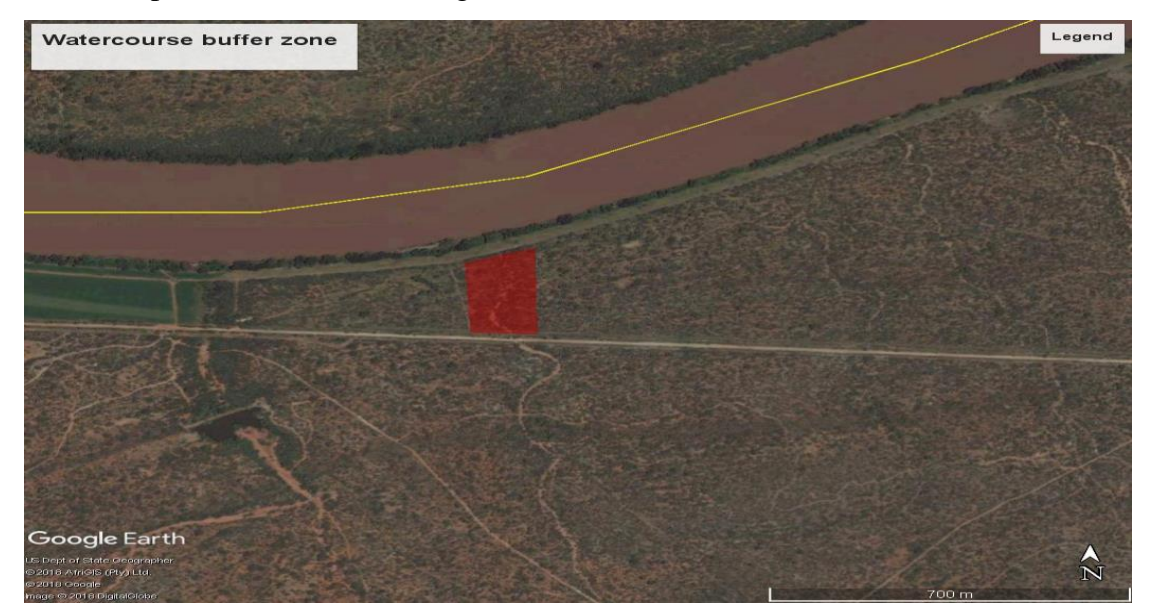
Figure 11: Buffer zone along watercourse recommended

the east) that is planned to be cleared in future. A 32 meter minimum buffer zone will protect the terrestrial vegetation associated with the watercourse.