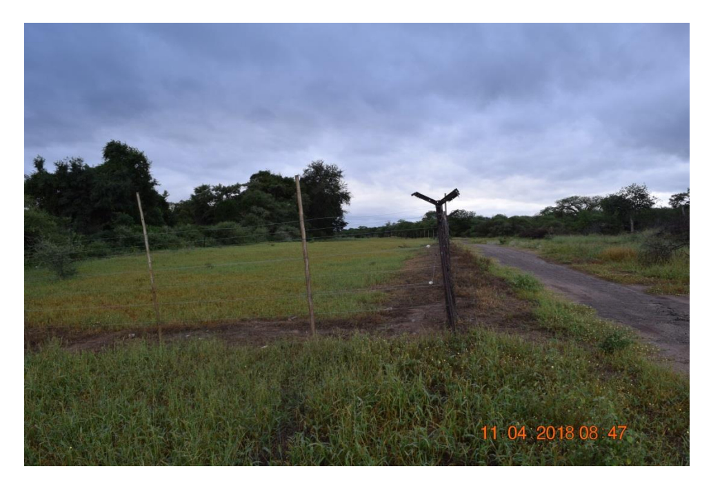
Figure 9: View of terrain with riparian zone left on picture and project on right of road