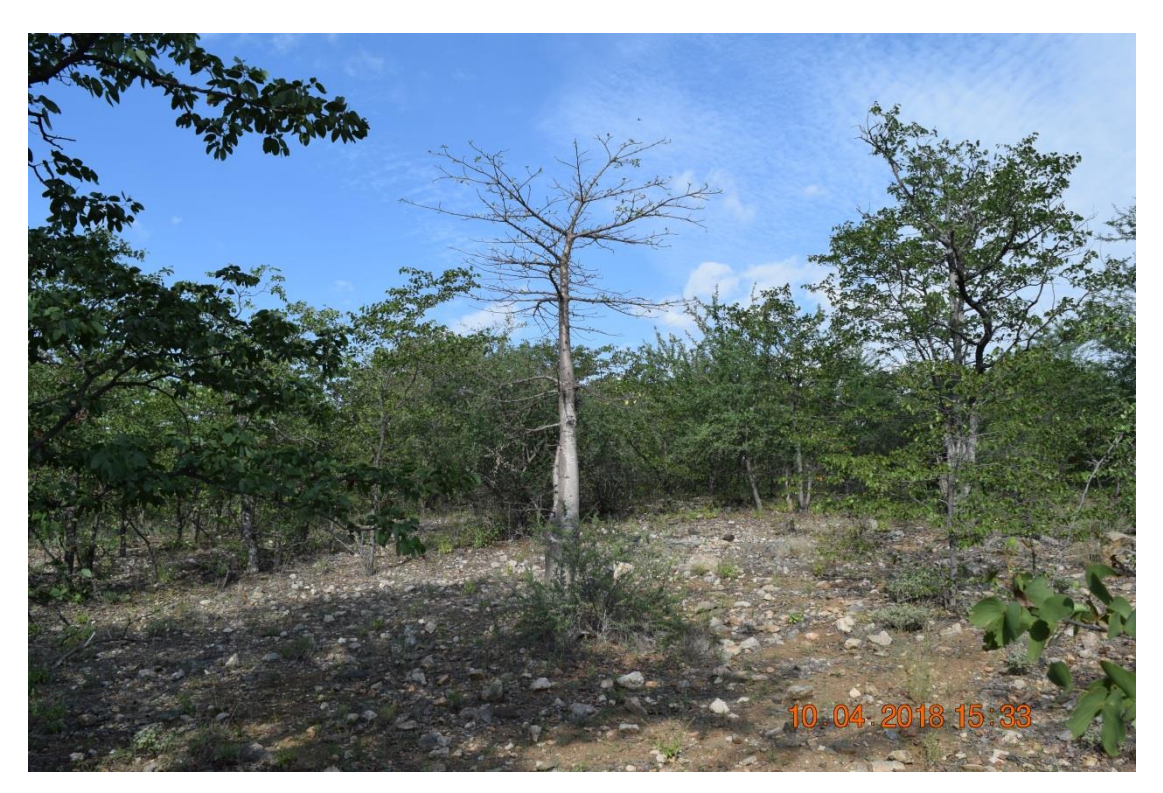
Figure 6: View of small baobab tree

Table 2: List of woody, non-woody, grasses and sedges species recorded on project area