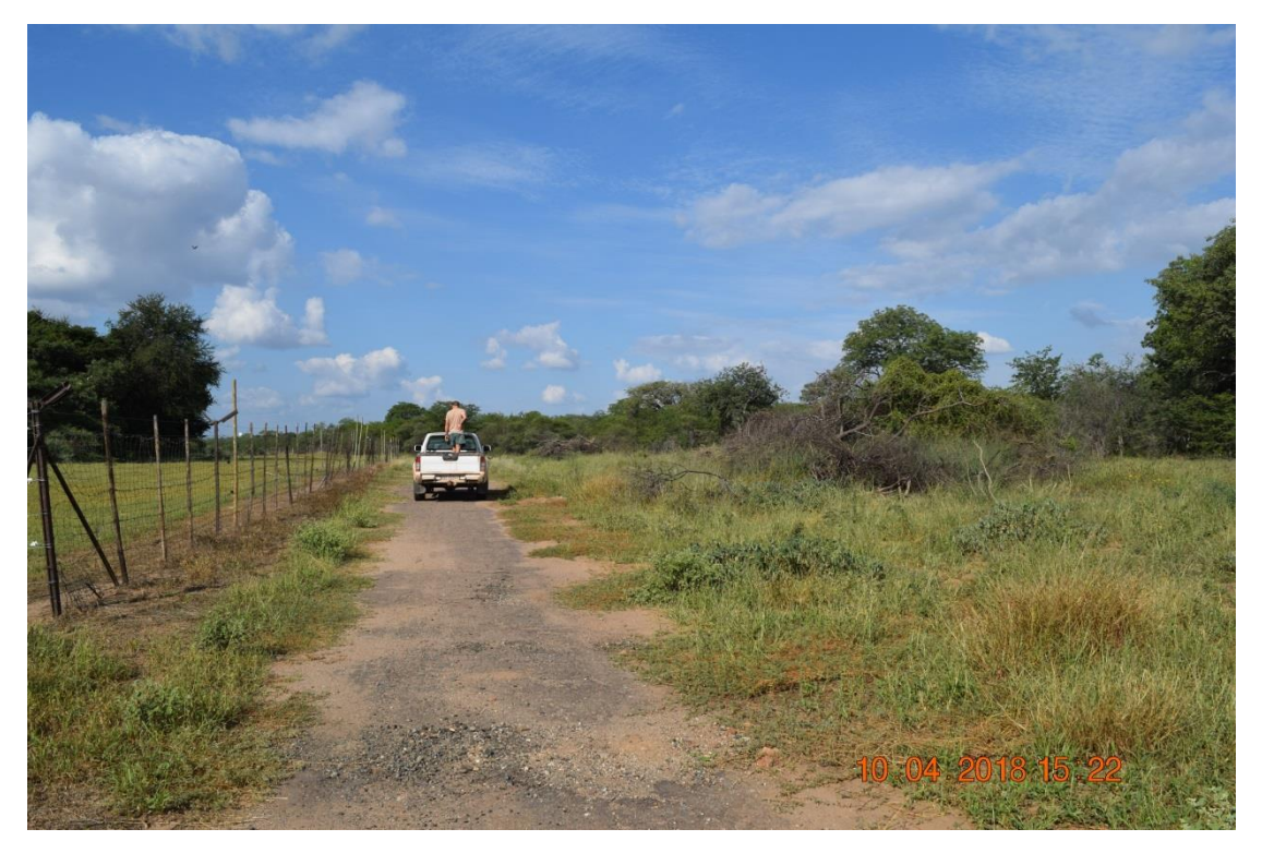
Figure 1: View of vegetation and human impact (road/fences)

The area is situated in transformed floodplain area. Management roads also traverse the area.