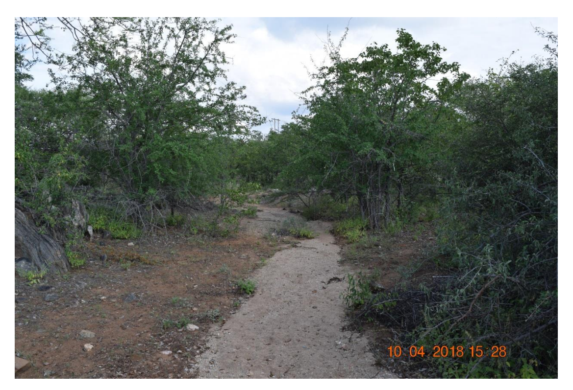
Figure 4: Vegetation on watercourse bank

The ecological structure for this plant community is dominated by Colophospermum mopane interspersed mostly with Acacia spp . with baobab trees and various shrubs. The habitat provided for wild life is marginal, due to location in close proximity to farming infrastructure, in this area as can be expected and confirmed by sightings and signs of spoor and droppings. The area is effectively used for migrating of smaller mammal species. This area had a Low-Moderate conservation value ascribed to it due to moderate species richness and low presence of exotic species.