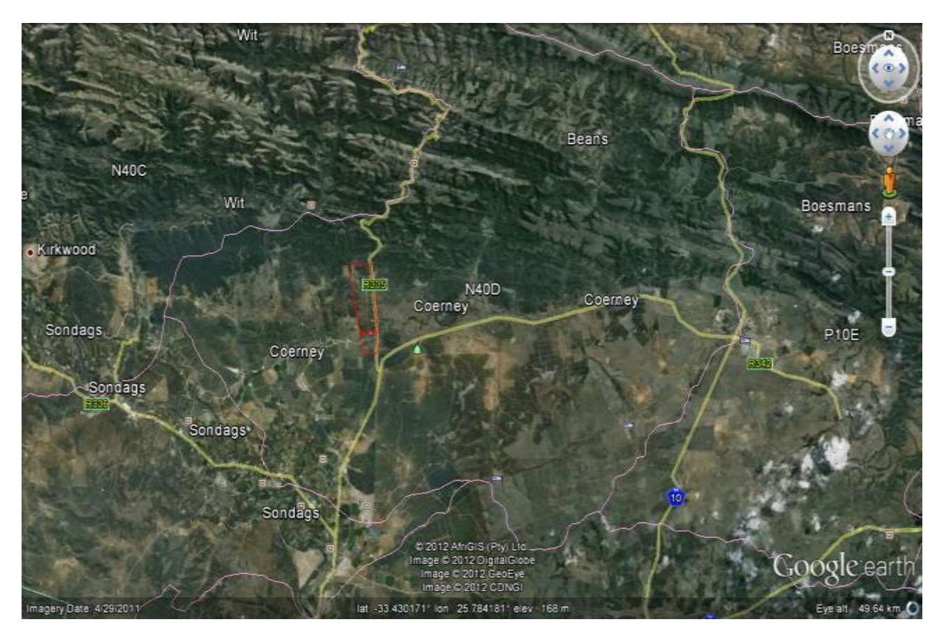
Figure 7.1: Google Earth image of the study area indicating study locality in red and regional quaternary catchments

The provisional development proposal entails the development of an additional approximately 300 hectares on the Remainder of Farm 82 Wolve Kop (~908 ha), Portion 1 of Farm 77 Wellshaven (~22ha) and Portion 3 of Farm 77 Honeyvale (~128ha) for agricultural purposes. The expansion of the agricultural infrastructure of the farm will include the clearing of indigenous vegetation, landscaping and levelling the site for citrus orchards, installation of water reticulation and irrigation infrastructure, construction of a balancing dam, the establishment of unpaved access roads and the establishment of windbreaks (Detail in Chapter 2).