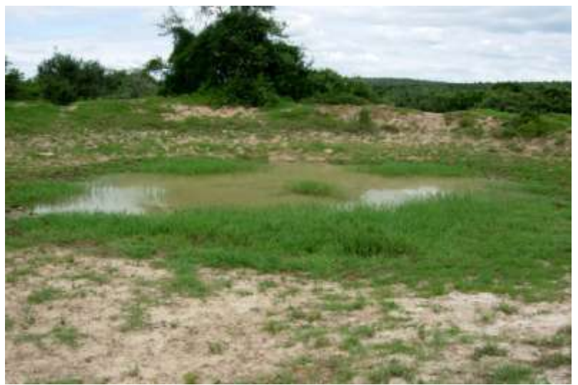
Photo 7.2: The typical scenario within the region, where the natural depression has been altered by increasing its catchment depth, through excavation of the pan floor.