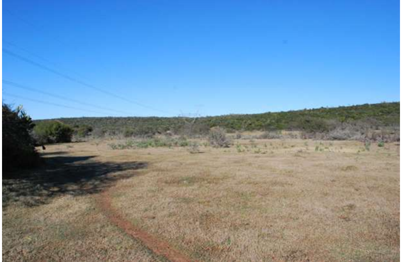
Photo 7.1: Example of cleared areas historically used for the cultivation of wheat.

This together with the channel form limits the formation of permanent riparian / obligate riparian zones being found within the development area. Plant species recorded (Appendix 1), were mostly associated with the 2 local thicket types and are thus not dependent on sources of water.