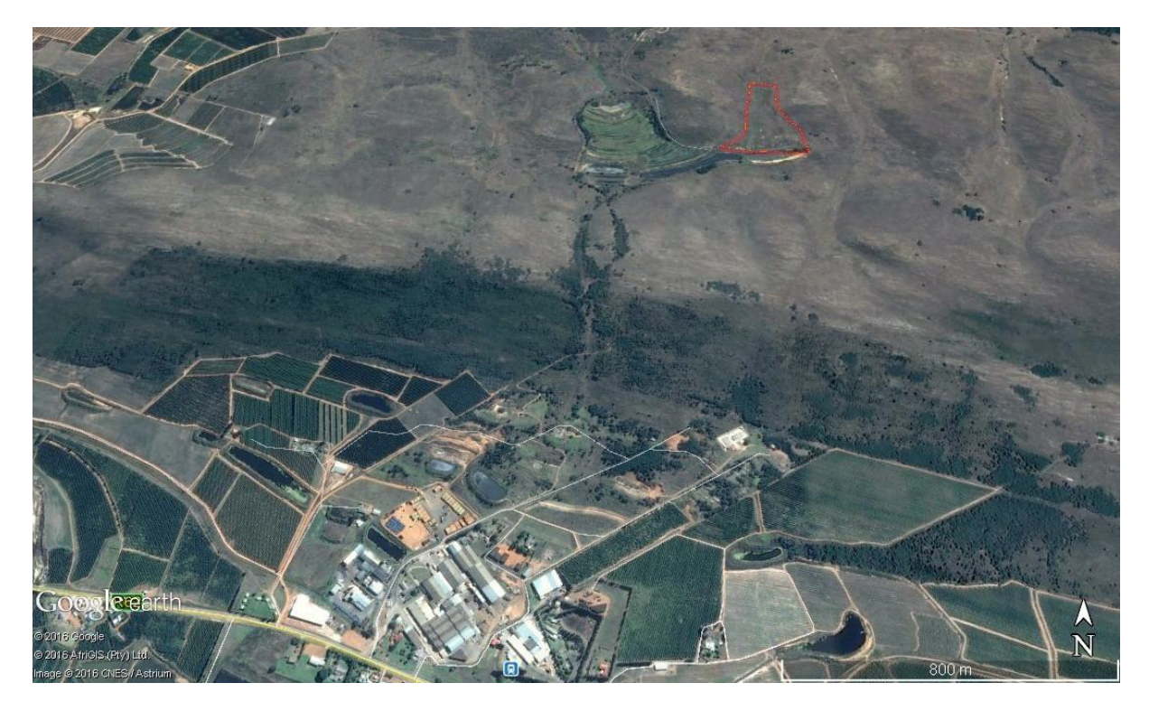
Map 1 Site of the proposed Granor Passi evaporation ponds (red outline).