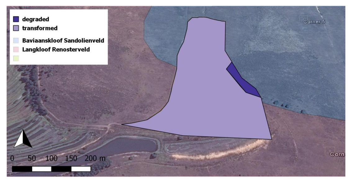
Map 4 Map 4 Site of the Granor Passi evaporation ponds