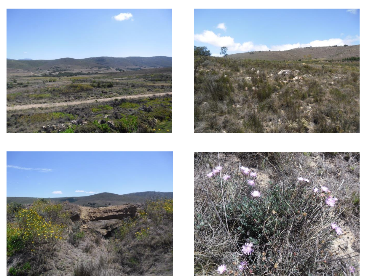
Photo 1Photo 1 Clockwise from top left: View of the site showing dominance of grasses and asteraceous shrubs; the degraded sandolienveld on the eastern edge; Lampranthus elegans , one of the attractive but not threatened protected species on site; the broken dam at the bottom of the eroded drainage line.

A number of Invasive Alien Plants (IAPs) occur on site but in very low numbers, with only a few individual pines ( Pinus radiata ), Black Wattle ( Acacia mearnsii ), Rooikrans ( A. cyclops ) and Scotch Thistle ( Cirsium vulgare ) present. All these species are rated as 1b or 2 according to NEMBA: Alien and Invasive Species List of 2014, and need to be cleared. A number of other alien species are present, but are not regarded as invasive (see Appendix 1).